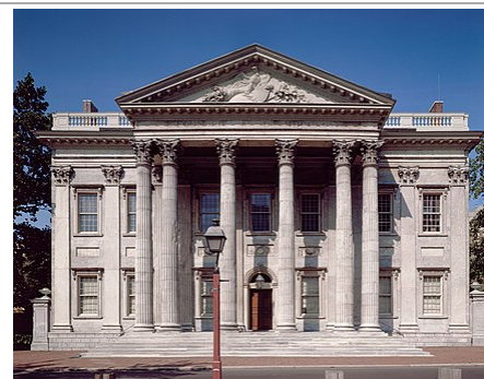
3rd Street façade