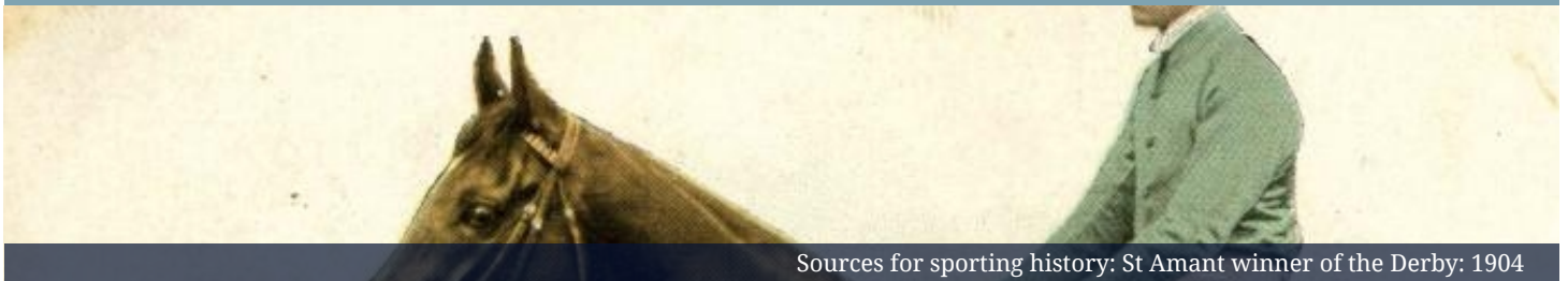
Sources for sporting history: St Amant winner of the Derby: 1904

Welcome to The Rothschild Archive's website