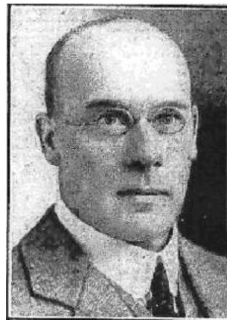
John Hope Simpson