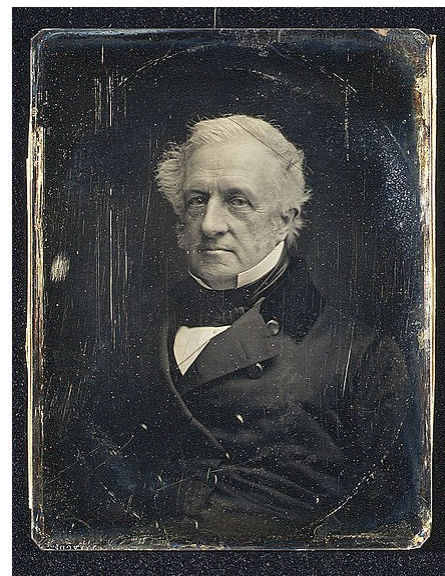
George Peabody , Morgan's senior partner and the founder of the firm that would become J. S. Morgan & Co.

Upon Morgan's arrival in London in 1854, Peabody & Co. was immediately in a position of strength as a leading dealer in American securities in the city; American grain, cotton, and railroad values soared during and after the Crimean War. [20][21] Morgan was placed in charge of much of the firm's iron portfolio, which included the marketing of railroad bonds in both New York and London. The iron business had drawn the firm into greater involvement in financing American railway construction,