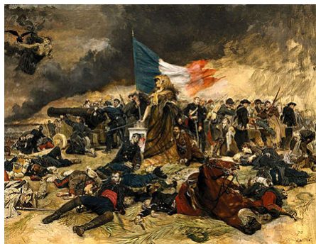
Morgan's decision to finance the French during the losing days of the Franco-Prussian War netted him a profit of £1.5 million.

In 1864, Morgan's ten-year agreement with Peabody expired. Though Peabody retired as promised, he denied Morgan the use of his name and capital. Morgan's grandson later recalled this as "at that time, the bitterest disappointment of his life". Peabody also forced unfavorable terms on Morgan's lease of the bank's 22 Old Broad Street offices. [35] Morgan succeeded Peabody as head of the firm and reluctantly changed its name to J. S. Morgan & Co. [36] Despite his disappointment, J. S. Morgan was the largest American bank in London and had earned £444,000 in the prior ten years, leaving Morgan a powerful platform for future investments. [35]