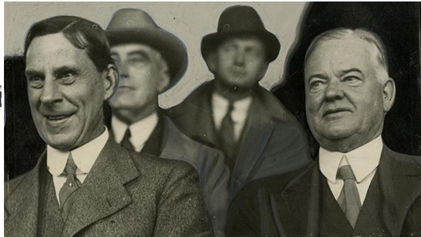
L/R: Ray Lyman Wilbur, Herbert Hoover

Digitized by Google Original from PRINCETON UNIVERSITY