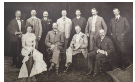
Colonial Secretary Joseph Chamberlain & Lord Milner in South Africa