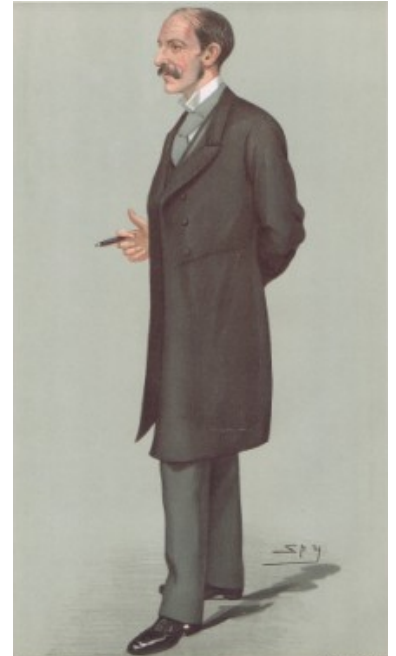
A caricature of Milner from Vanity Fair in 1897

On 4 May, Milner penned a memorable dispatch to the Colonial Office, in which he insisted that the remedy for the unrest in the Transvaal was to strike at the root of the evil—the political impotence of the injured Uitlanders . "It may seem a paradox," he wrote, "but it is true that the only way for protecting our subjects is to help them to cease to be our subjects." The policy of leaving things alone only led from bad to worse, and "the case for intervention is overwhelming." Milner felt that only the enfranchisement of the Uitlanders in the Transvaal would give stability to the South African situation. He had not based his case against the Transvaal on the letter of the Conventions, and regarded the employment of the word "suzerainty" merely as an "etymological question," but he realised keenly that the spectacle of thousands of British subjects in the Transvaal in the condition of " helots " (as he expressed it) was undermining the prestige of Great Britain throughout South Africa, and he called for "some striking proof" of the intention of the British government not to be ousted from its predominant position. This dispatch was telegraphed to London, and was intended for immediate publication; but it was kept private for a time by the home government. [5]