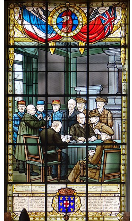
The Stained Glass at Doullens Town Hall, commemorating the Doullens Conference and the Unity of Command. Lord Milner is standing, centre

possible. Lord Milner wrote, "On March 23rd, my birthday, I received a call from the Prime Minister who wanted me to go over to France and report personally on the position of affairs there. I left the next day. On March 26th, at 8 in the morning, I drove to a meeting at Doullens, France, arriving there at 12:05pm. Immediately I met General's Haig, Petain, Foch, Pershing, their staff officers, and President [b] Clemenceau. The front had broken wide open in front of us, threatening Paris. There was confusion in the ranks as to what to do, and who was in charge. I immediately took the general's aside, and using the powers entrusted with me as the Prime Minister's representative, I deputised General Foch, making him the Allied Commander at the front, and told him to make a stand." That stand was taken at Amiens, a town with a critical railway station, that, if taken, could have divided the allies in half, driving the British into the sea, and leaving Paris and the rest of France open for defeat. When Milner returned to London, the War Cabinet gave him its official thanks. [47] On 19 April he was appointed Secretary of State for War in place of the Earl of Derby, who had been a staunch ally of Field-Marshal Haig, and presided over the Army Council for the remainder of the war.