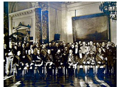
Lord Milner's mission to Russia.

Following the death of Lord Kitchener aboard the HMS Hampshire on 5 June 1916, on 20 January 1917 Milner led the British delegation (with Henry Wilson as chief military representative and including a banker and two munitions experts) on a mission to Russia aboard the Kildonan Castle ( http://www.bandstaffregister.com/page1967.html ). There were 50 delegates in all including French (led by de Castelnau ) and Italians. The object of the mission, stressed at the second Chantilly Conference in December 1916, was to keep the Russians holding down at least the forces now opposite them, to boost Russian morale and see what equipment they needed with a view to coordinating attacks. However, a feeling of doom prevailed over the meetings once it was discovered that Russia had huge equipment problems, and that England's ally operated way behind that of the west, which negated its manpower advantage. Instead of helping its ally, England's assistance was reduced to intervening with a task force to prevent allied stockpiles from falling into the hands of revolutionaries at the port of Archangel . The official report in March [35] said that even if the Tsar was toppled—which in fact happened just 13 days after Milner's return—Russia would remain in the war and that they would solve their "administrative chaos". [36] In fact, the Russian Revolution continued until 1923, when the forces loyal to the Tsar, the White Movement , were finally defeated.