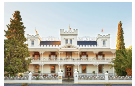
The Lord Milner hotel in Matjiesfontein , South Africa