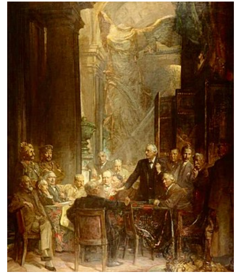
"Statesmen of World War I", depicting the low point of the war. Lord Milner is seated between PM Lloyd George and Winston Churchill.

The artillery barrage commenced at 4:45am, it lasted four hours, and when it ended, the German infantry advanced through no-mans land, and right up to the trenches without being seen. They easily routed the British Fifth Army, and part of the Third Army, to its left. Within a day, they opened a gap 50 miles wide and penetrated seven miles deep. Within a week, they were almost half way to Paris. The allied generals were paralyzed. On March 25, General Haig of the B.E.F. communicated an order to the French that he was slowly withdrawing to the Channel Ports, and he requested 20 French divisions to cover his right flank, to prevent German encirclement. [44] General Petain, a day earlier, ordered his Army to fall back and cover Paris. The lack of an allied leader, and the lack of reserves to plug the gap caused the generals to look out for their separate interests. As a result, the hole in the front widened, and the Germans were about to pour in. [45][46]