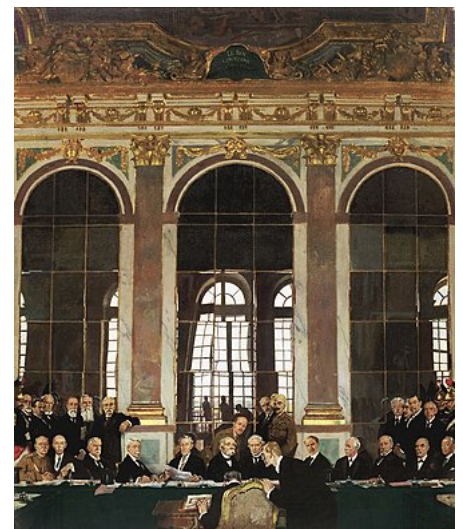
William Orpen's famous painting of the signing of The Treaty of Versailles. Lord Milner is seated, third from the right.

Milner was present at an important meeting at 23 Rue Nitot, Lloyd George's flat in Paris, on June 1, 1919, when the Empire Delegation discussed Germany's counterproposals to the peace treaty. In a last minute attempt to improve the conditions imposed on Germany, Lloyd George went back to Prime Minister Clemenceau and President Wilson to ask for revisions. He told them that without substantial changes to bring the treaty closer in line with the 14 Points, England would not take part in