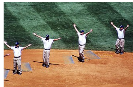
Members of the grounds crew of Yankee Stadium pause to do the YMCA dance.