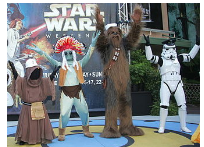
Star Wars characters, a Jawa, Greedo, Chewbacca and an Imperial Stormtrooper, assume the roles of the Village People for the "Y.M.C.A." dance at a Disney "Star Wars Weekends" event in 2007.