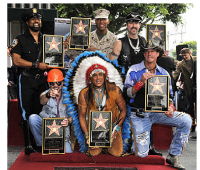
Village People receive their star on the Hollywood Walk of Fame in 2008. Left to right – front row: David Hodo, Felipe Rose, Jeff Olson / back row: Ray Simpson, Alex Briley, Eric Anzalone

At the beginning of the 21st century Village People released two singles, "Gunbalanya" (2000) and "Loveship 2001" (2001) under the name "Amazing Veepers". It was reported in 2001 that 'Gunbalanya', which was recorded with indigenous Australian people, took its title from a word meaning "in the tribe" though it is in fact the name of an Aboriginal settlement. Leatherman/Biker