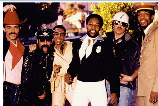
Village People in 1978. From left: Randy Jones , Glenn Hughes , Felipe Rose , Victor Willis , David Hodo , Alex Briley