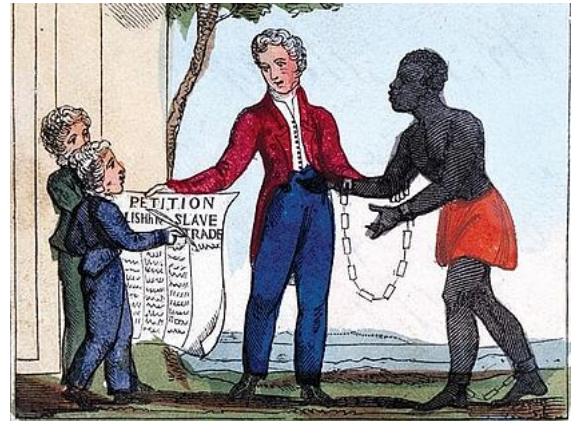
Illustration from the book: The Black Man's Lament, or, how to make sugar by Amelia Opie . (London, 1826)

slaves as business assets to the registered owners of the freed slaves. In 1833, £20 million amounted to 40% of the Treasury's annual income [24] or approximately 5% of British GDP at the time. [25] To finance the payments, the British government took on a £15 million loan, finalised on 3 August 1835, with banker Nathan Mayer Rothschild and his brother-in-law Moses Montefiore ; £5 million was paid out