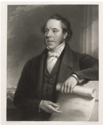
Portrait of abolitionist Thomas Clarkson , circa 1840, after Henry Room ; on the scroll is "Slavery abolished; Jamaica; August 1st 1838", the date the apprenticeships ended

The Act passed its second reading in the House of Commons unopposed on 22 July 1833, just a week before William Wilberforce died. [20] It received the Royal Assent a month later, on 28 August, and came into force the following year, on 1 August 1834. In practical terms, only slaves below the age of six were freed in the colonies. Former slaves over the age of six were redesignated as "apprentices", and their servitude was abolished in two stages: the first set of apprenticeships came to an end on 1 August 1838, while the final apprenticeships were scheduled to cease on 1 August 1840. The Act specifically excluded "the Territories in the Possession of the East India Company, or to the Island of Ceylon, or to the Island of Saint Helena." The exceptions were eliminated in 1843. [21]