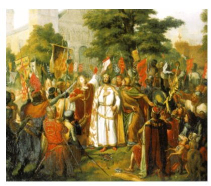
19th-century painting on display at <u>Versailles</u> depicting Raymond IV along with Adhemar of Le Puy

He was present at the <u>siege of Nicaea</u> and the <u>Battle of Dorylaeum in 1097, [2]</u> but his first major role came in October 1097 at the <u>siege of Antioch. [2]</u> The crusaders heard a rumour that <u>Antioch</u> had been deserted by the <u>Seljuk Turks</u>, so Raymond sent his army ahead to occupy it, offending Bohemond of Taranto who wanted the city for himself. The city was, however, still occupied, and was taken by the crusaders only after a difficult siege in June 1098. Raymond took the palatium Cassiani (the palace of the emir, Yaghi-