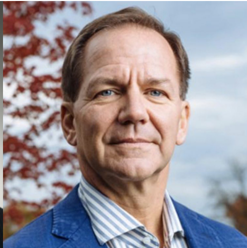
Paul Tudor Jones II Investor and Philanthropist