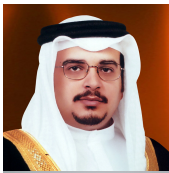
H.R.H. Prince Salman bin Hamad Al-Khalifa Kingdom of Bahrain