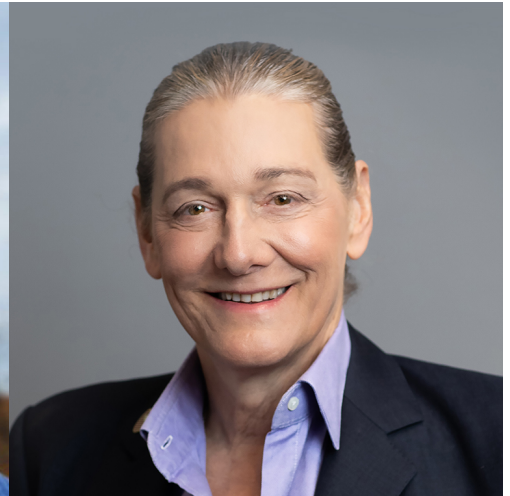
Martine Rothblatt, Ph.D. Founder, SiriusXM and United Therapeutics