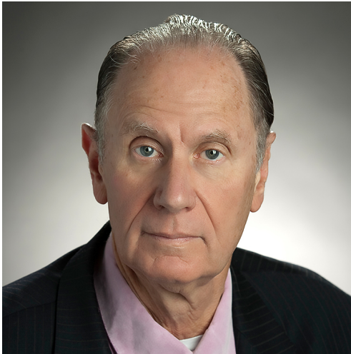
David Bonderman Founding Partner, TPG Capital