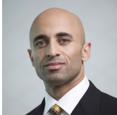
H.E. Yousef Al Otaiba United Arab Emirates Ambassador to the United States