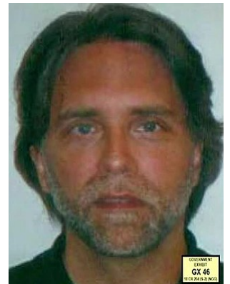
NXIVM founder Keith Raniere

NXIVM featured a practice called "exploration of meaning" that involved senior members questioning participants as they delved into their childhood memories. [100]