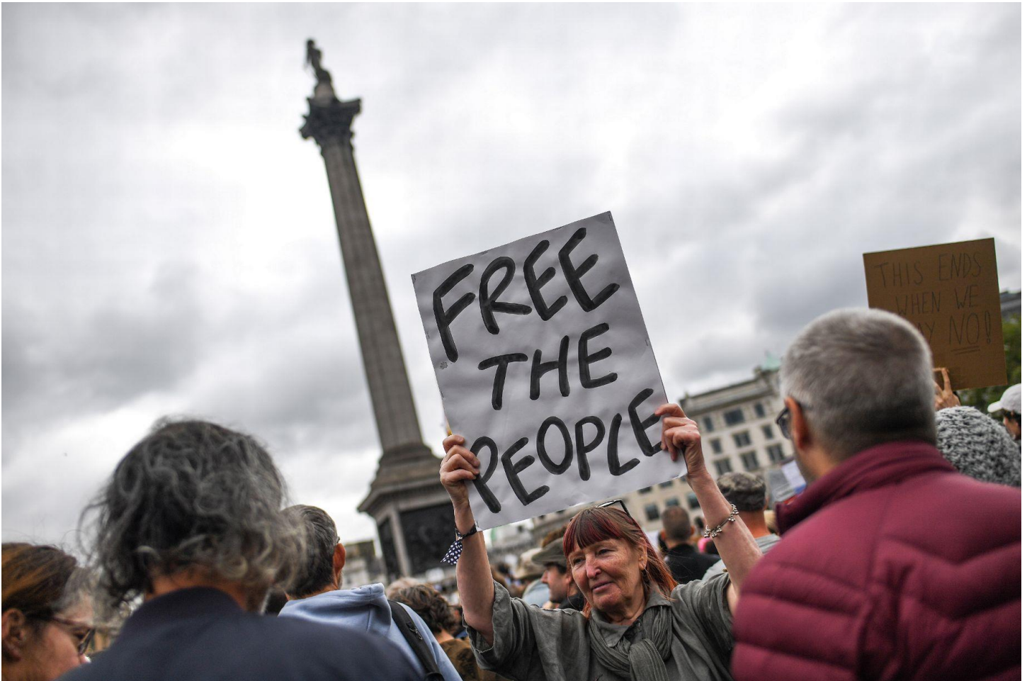
Figure 4: Many people did not wear masks to the event, which saw thousands in attendance. For educational purposes only. Fair Use relied upon.