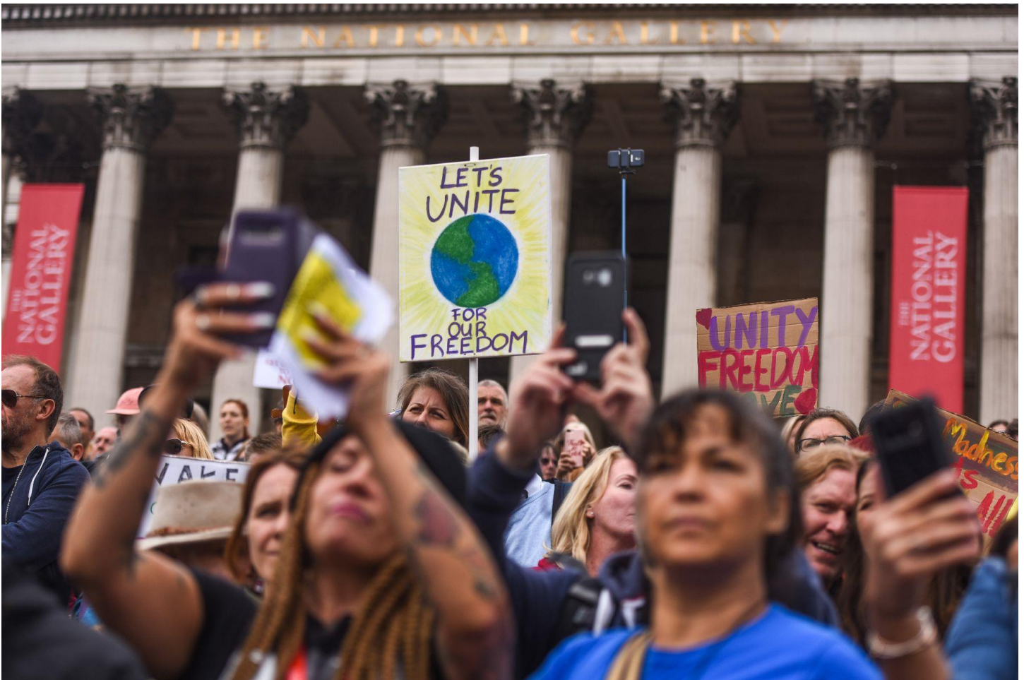
Figure 8: Jeremy Corbyn's brother, Piers Corbyn, was a planned speaker at the Unite for Freedom march. Photo: Getty Images. For educational purposes only. Fair Use relied upon.