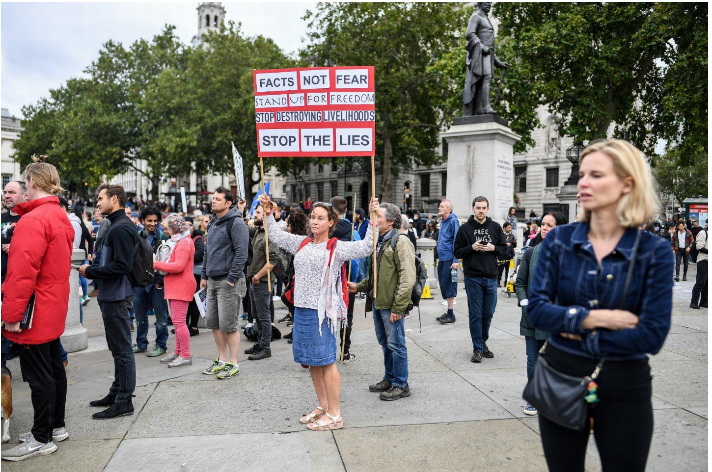
Figure 9: A woman calls for the government to "stop destroying livelihoods" at the Unite for Freedom march. Photo: Getty Images. For educational purposes only. Fair Use relied upon.