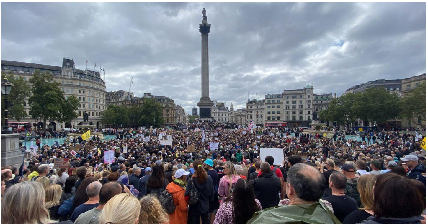
Figure 1: The United for Freedom protest in Trafalgar Square. For educational purposes only. Fair Use relied upon.

Some called for an end to government-imposed lockdown measures while others called the virus a 'hoax'. There were also signs saying 'no to vaccinations'