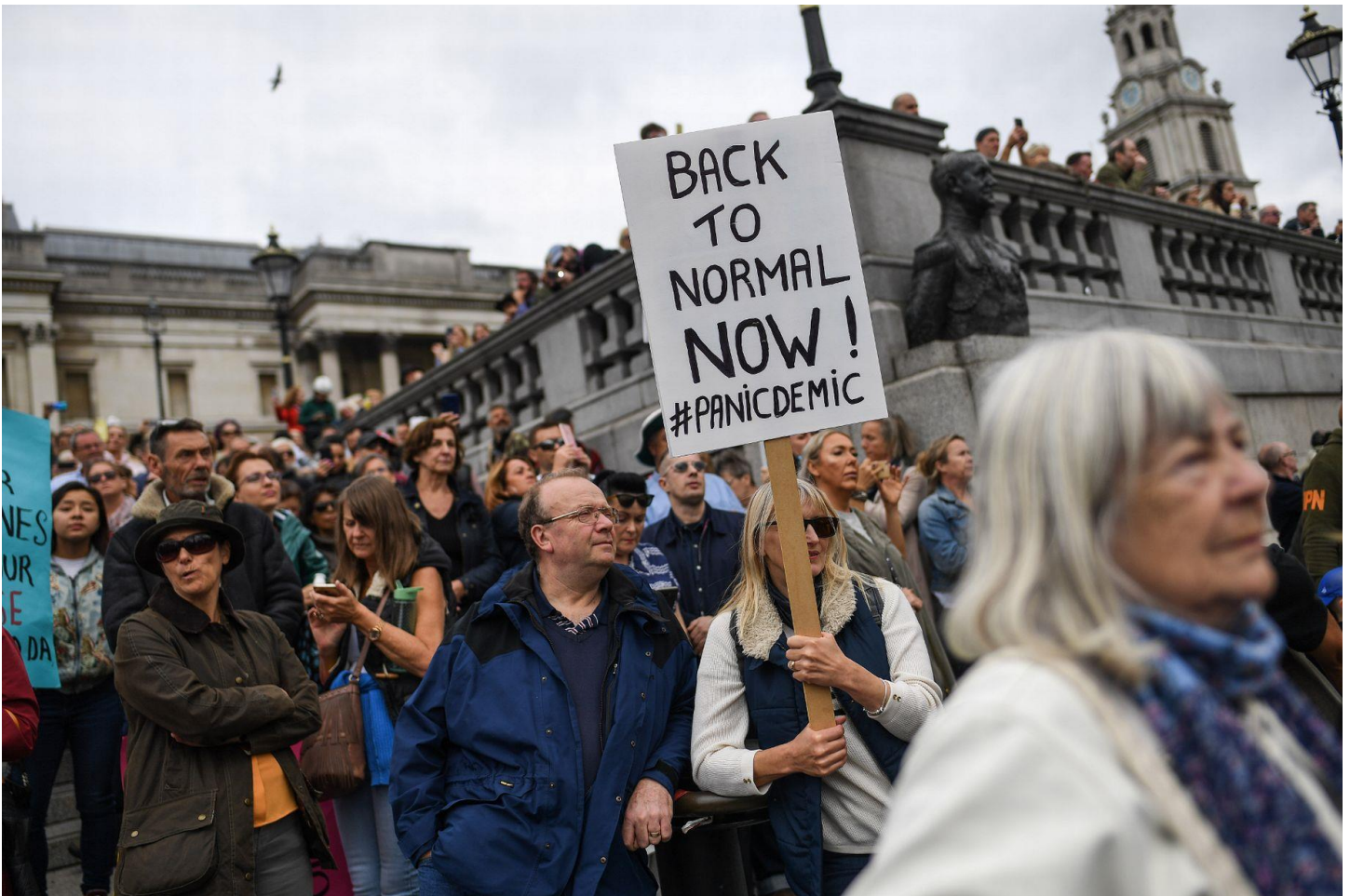
Figure 5: People called for a return to "normal" and an end to lockdown restrictions. Photo: Getty Images. For educational purposes only. Fair Use relied upon.