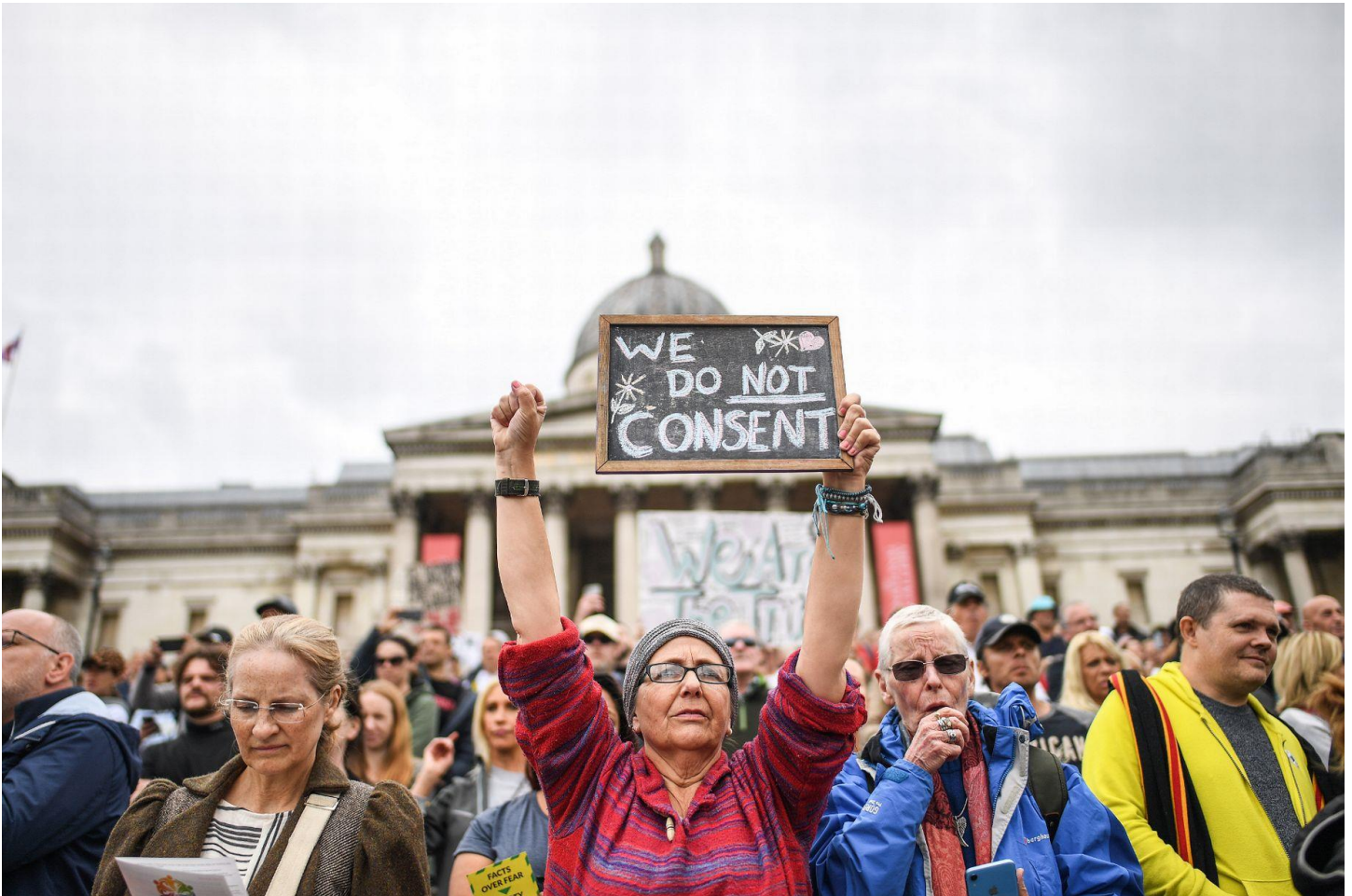
Figure 6: Others said they did not "consent" to the restrictions put in place by the government during the pandemic. For educational purposes only. Fair Use relied upon.