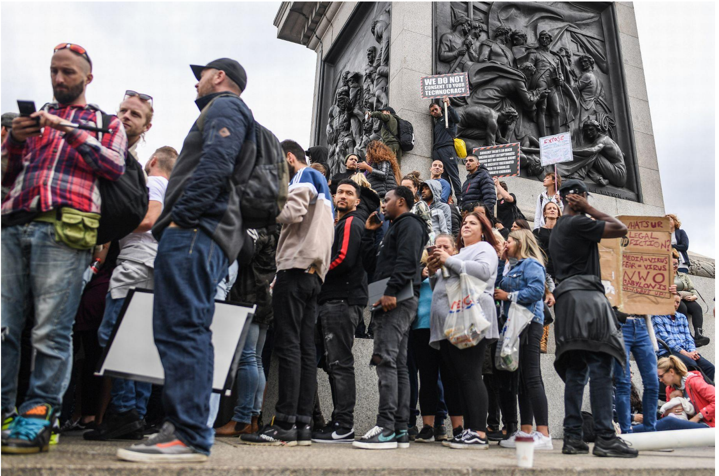
Figure 10: Social distancing was not being observed in many cases as thousands attended the event. For educational purposes only. Fair Use relied upon.