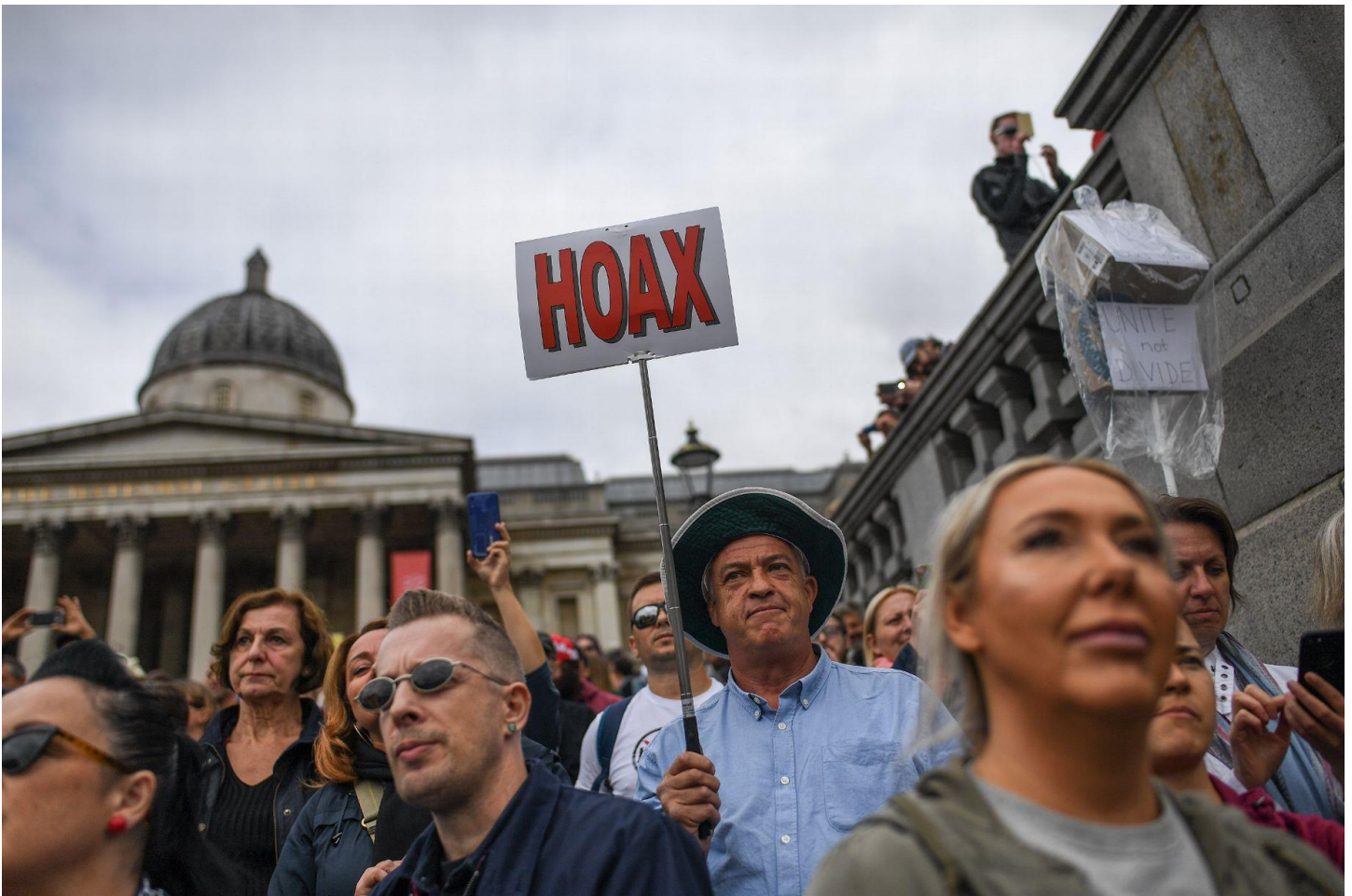
Figure 11: A man carries a sign branding the pandemic 'hoax' at the United for Freedom march in London. Photo: Getty Images. For educational purposes only. Fair Use relied upon