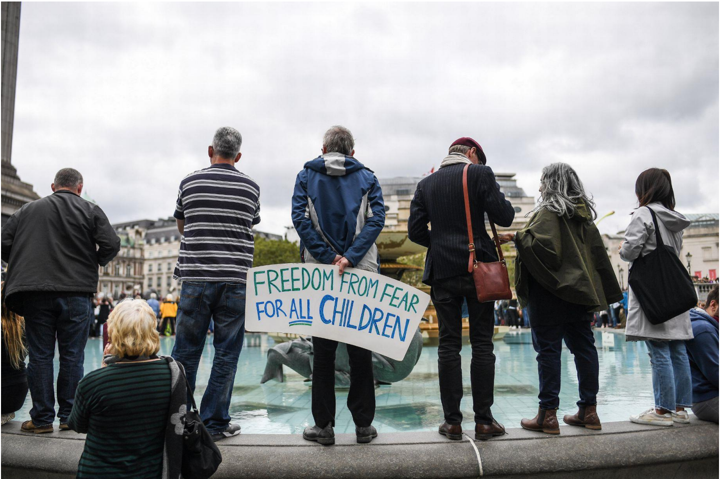
Figure 2: Protesters are seen at the Unite for Freedom protest in Trafalgar Square on August 29. For educational purposes only. Fair Use relied upon.