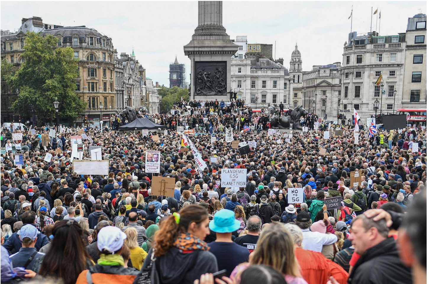
Figure 7: Social distancing did not appear to be in place at the large-scale event. Photo: Getty Images. For educational purposes only. Fair Use relied upon.