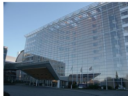
The AstraZeneca R&D facility in Mölndal, Sweden