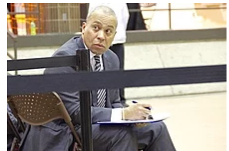
Patrick at a public meeting for the Chicago Police Accountability Task Force on February 23, 2016

Following Patrick's speech at the 2012 Democratic National Convention, a reporter asked if Patrick was interested in a 2016 presidential bid. He responded that he intended to return to the private sector after completing his second term as governor. [93] In July 2013, Patrick unequivocally ruled out a 2016 presidential bid. [94][95]