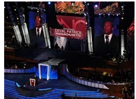
Patrick speaking at the 2008 Democratic National Convention