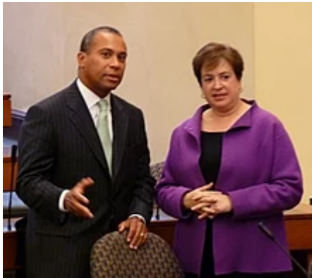
Patrick with future Supreme Court associate justice Elena Kagan at the Harvard Law School, in 2008.

While Patrick was in middle school, one of his teachers referred him to A Better Chance, a national non-profit organization for identifying, recruiting and developing leaders among academically gifted minority students, which enabled him to attend Milton Academy in Milton, Massachusetts. [11] Patrick graduated from Milton Academy in 1974 and went on to attend college, the first in his family. [15] He graduated from Harvard College, where he was a member of the Fly Club, with a Bachelor of Arts degree, cum laude , [15] in English and American literature, in 1978. He then spent a year working with the United Nations in Africa. In 1979, Patrick returned to the United States and enrolled at Harvard Law School. While in law school, Patrick was elected president of the Harvard Legal Aid Bureau, where he first worked defending poor families in Middlesex County, Massachusetts. At Harvard, Patrick won "Best Oralist" in the prestigious Ames Moot Court Competition, in 1981. [16]