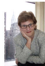
Knoco New York