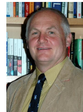
Knoco South Africa