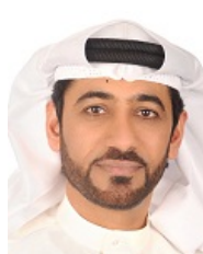
Knoco Gulf States