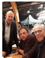
KM services in Benelux