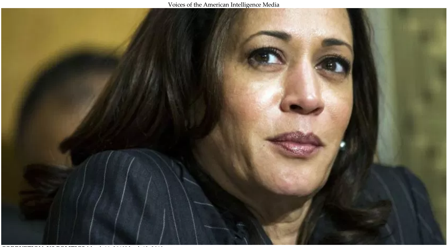
CORRUPTION, US POLITICS March 11, 2019March 12, 2019