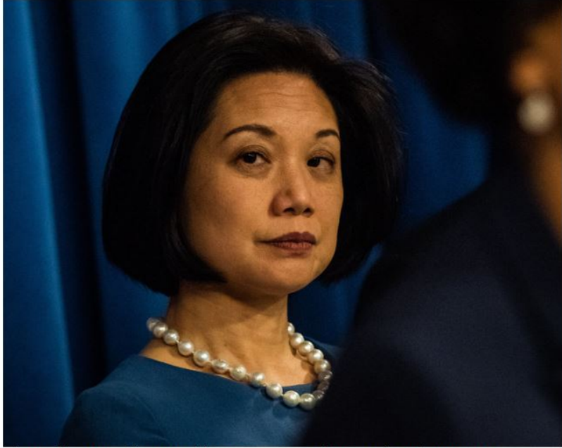
Most of the pictures of her are gooey sweet. In this version, her SES fangs come out.

The SES is a globalist nation state undermining the U.S. Constitution