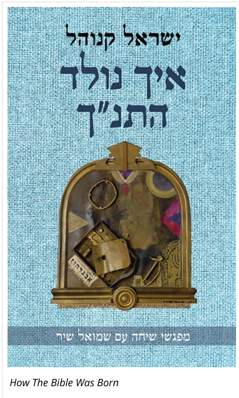
How The Bible Was Born

Amenophis collected all the lepers in Egypt together and settled them in a remote city, Avaris, which had previously been the Hyksos's capital. The lepers rebelled against Amenophis and appointed a leper priest called Osarseph as their leader. Osarseph had previously served at the temple of the sun god (the biblical "On") in Heliopolis, and he gave the