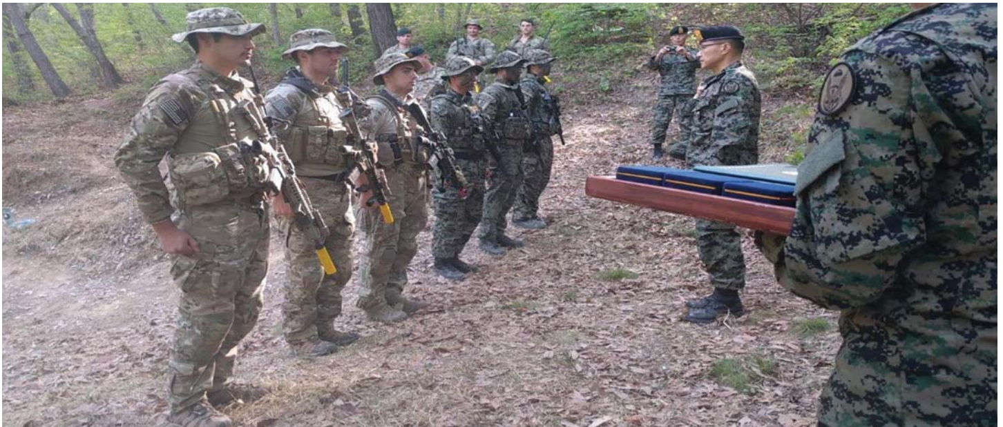
Soldiers from the 1st Special Forces Group (Airborne) and the Republic of Korea Special Forces receive recognition from the Republic of Korea Special Warfare Command for their lifesaving actions on April 25. The partnered special operations forces were taking part in training when a local Korean asked them to assist a badly injured elderly farmer. Their emergency care saved the farmers life.

"It was a great opportunity for the detachments to demonstrate the friendship and interoperability of ROK and U.S. SOF," said the Republic of Korea Special Forces battalion commander in charge of the Korean Special Forces soldiers involved in the event. "Further, it demonstrated to the Korean people that we can be trusted as a combined force. It was truly the friendship between our forces that set the conditions for the Soldiers to help the elderly farmer, and leave a positive impression on the local community."