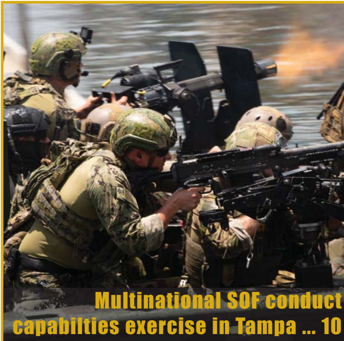
Multinational SOF conduct capabilities exercise in Tampa ... 10