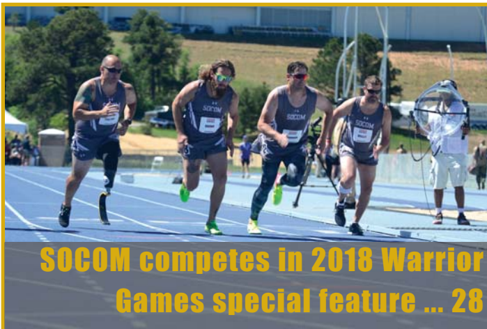
SOCOM competes in 2018 Warrior Games special feature ... 28