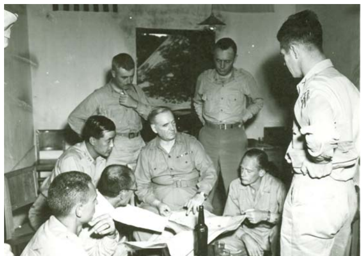
William J. Donovan briefing a plan during World War II.

Donovan retired from active duty and returned to his work as a lawyer. His first job after the war was serving as an aide to the U.S. chief prosecutor at the Nuremberg war crimes trials. He died at the age of 76 on February 8, 1959 at the Walter Reed Army Medical Center, in Washington, D.C. He is buried in Arlington National Cemetery.