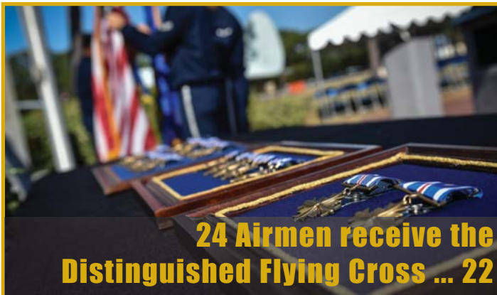
24 Airmen receive the Distinguished Flying Cross ... 22