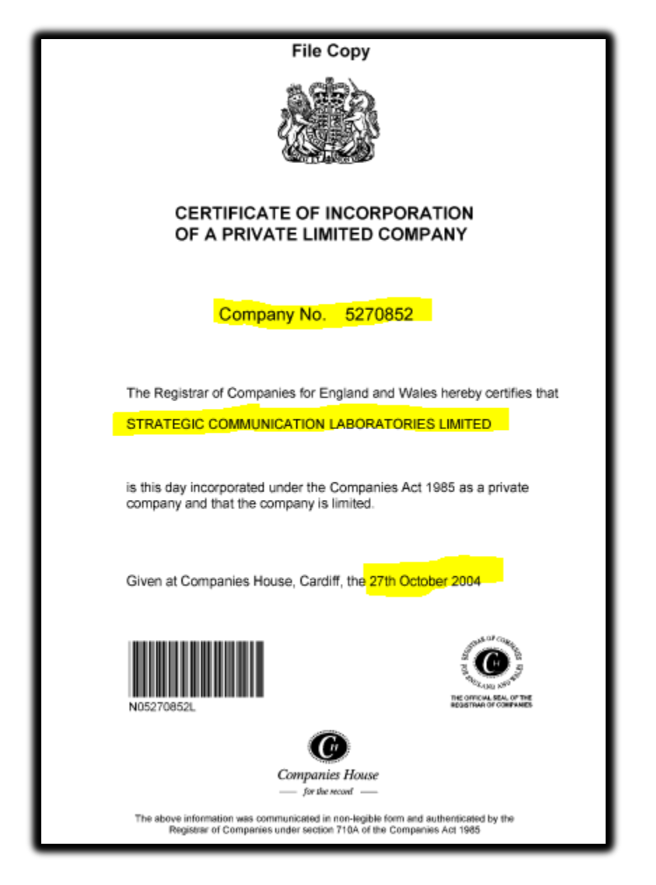
Figure 2: <u>Strategic Communication Laboratories Limited, Co. No. 5270852. (Oct. 27, 2004)</u>. Certificate of Incorporation. Renamed Boldnote Limited on Jul. 20, 2005. Companies House.

Door #2: Strategic Communication Laboratories Limited (Jul. 20, 2005)—Mass Deception (aka Data Mining)