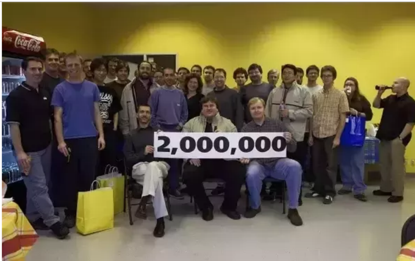
LinkedIn at 2 million users