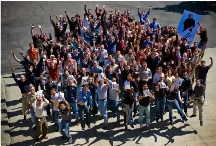
LinkedIn at 20 million users