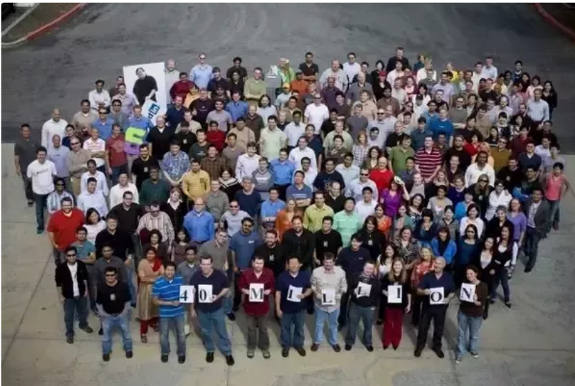
LinkedIn at 40 million users