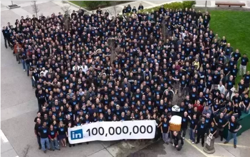
LinkedIn at 100 million users