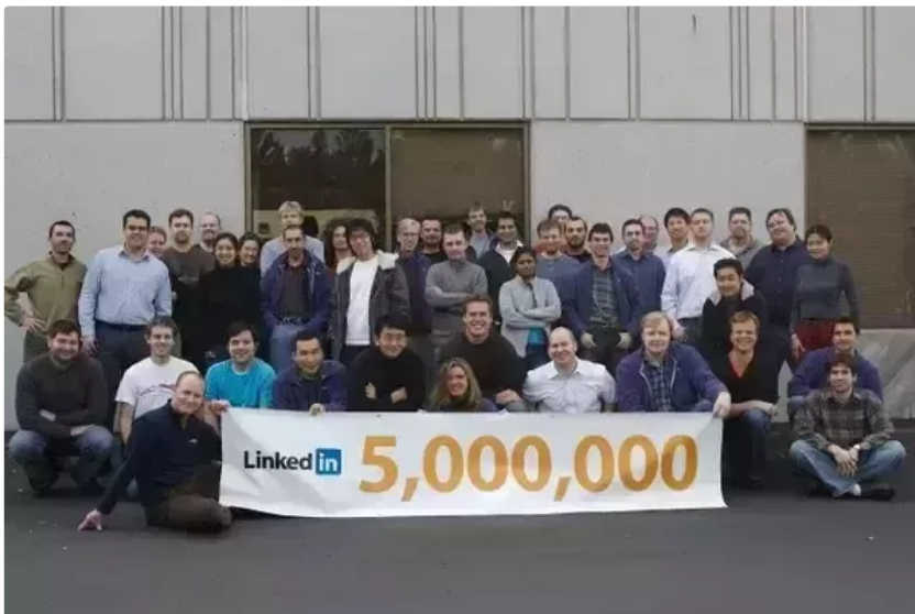
LinkedIn at 5 million users