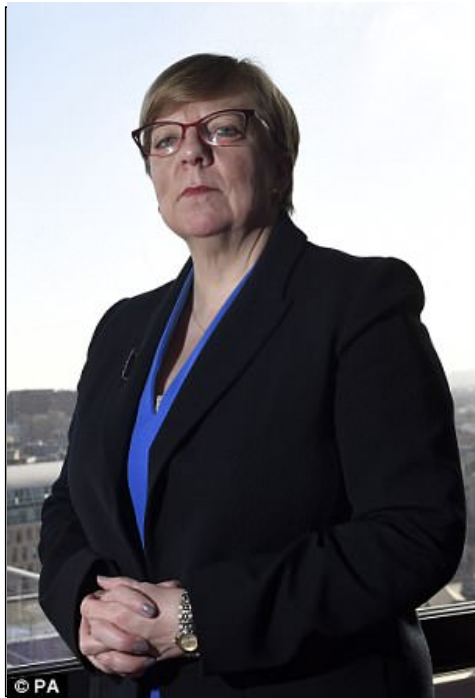
The five-year tenure of Alison Saunders (pictured) as Director of Public Prosecution has been branded 'disastrous' by critics

'She has a wealth of prosecution experience and is accustomed to dealing with regulators and counterparts at the highest level globally.'