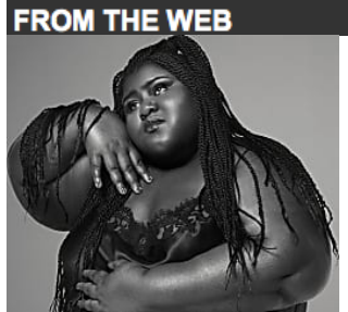
Remember Precious? Try Not To Gasp When You See Her Now, After Losing 230lbs Military Bud