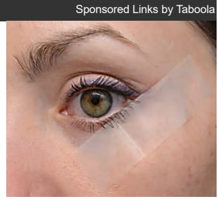
Plastic Surgeon Reveals: "You Can Fill In Wrinkles At Home" (Here's How)