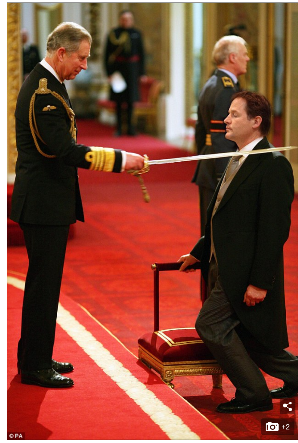
Honoured: The Daily Mail's mock-up of how the ceremony might have looked

This is the man who presided over the Lib Dem's worst electoral defeat in its history — reducing its number of MPs from 63 when he took over in 2007 to just eight when he stood down in 2015.