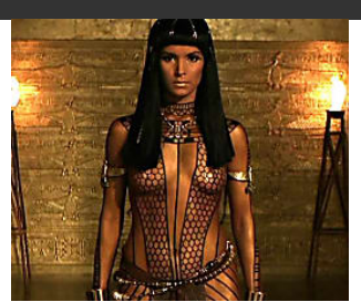
'Mummy' Star Left Crew Without Words Journalistate