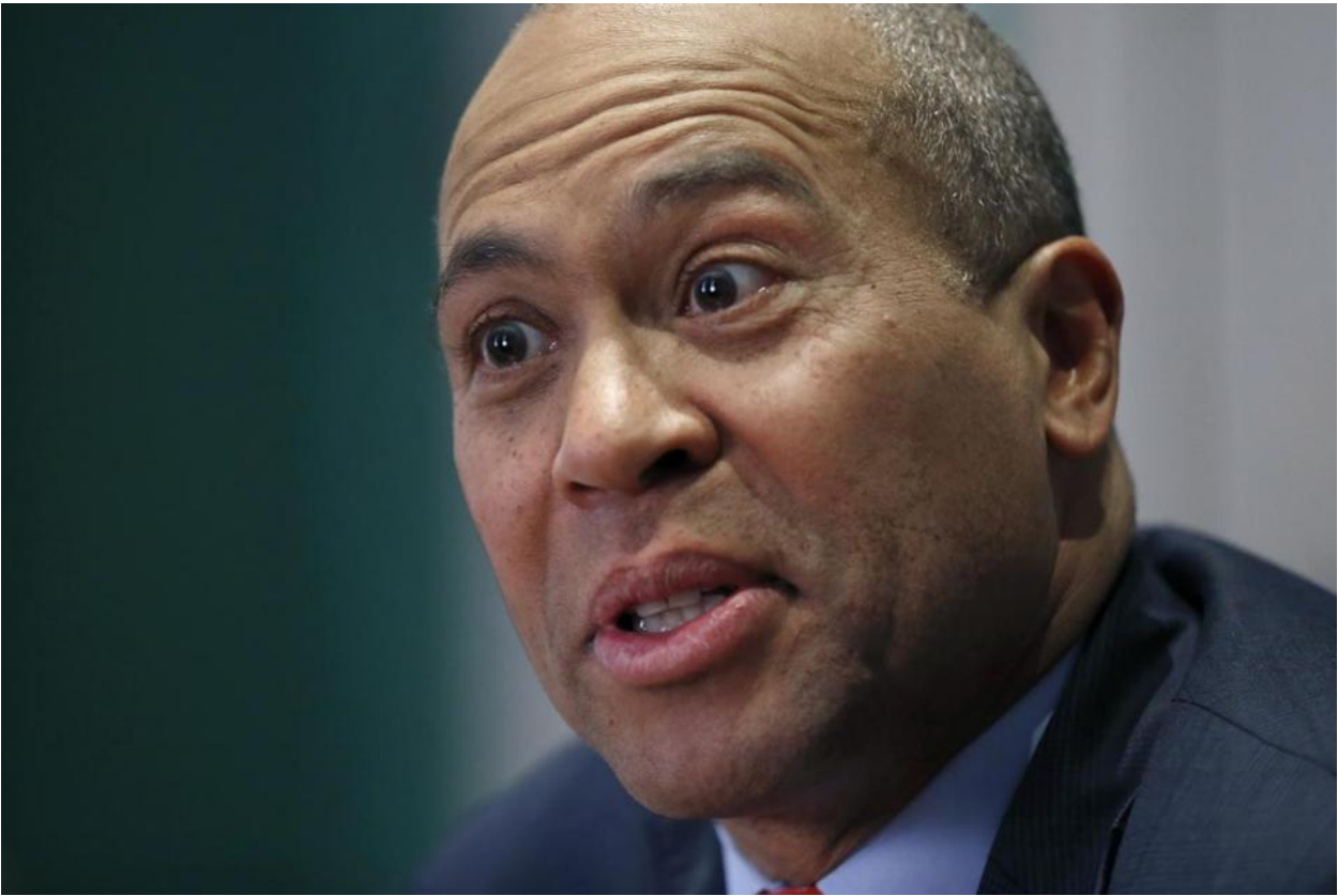
Figure 5: