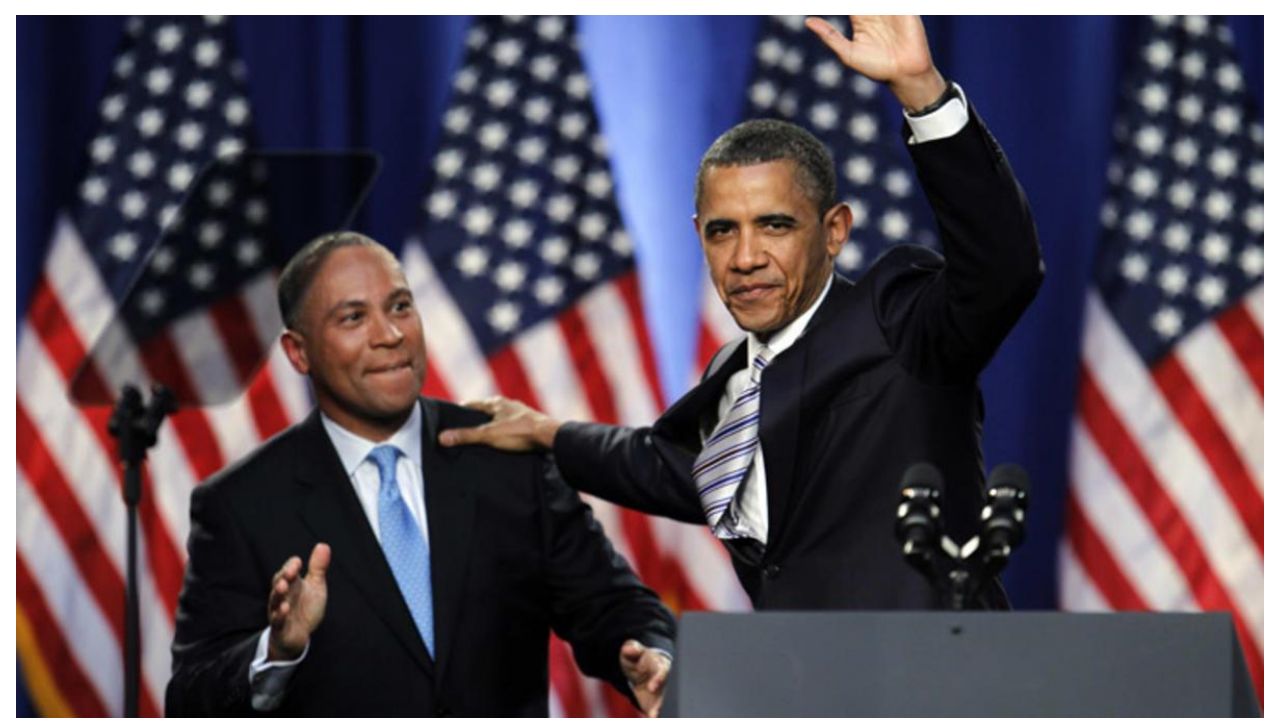
Figure 7: