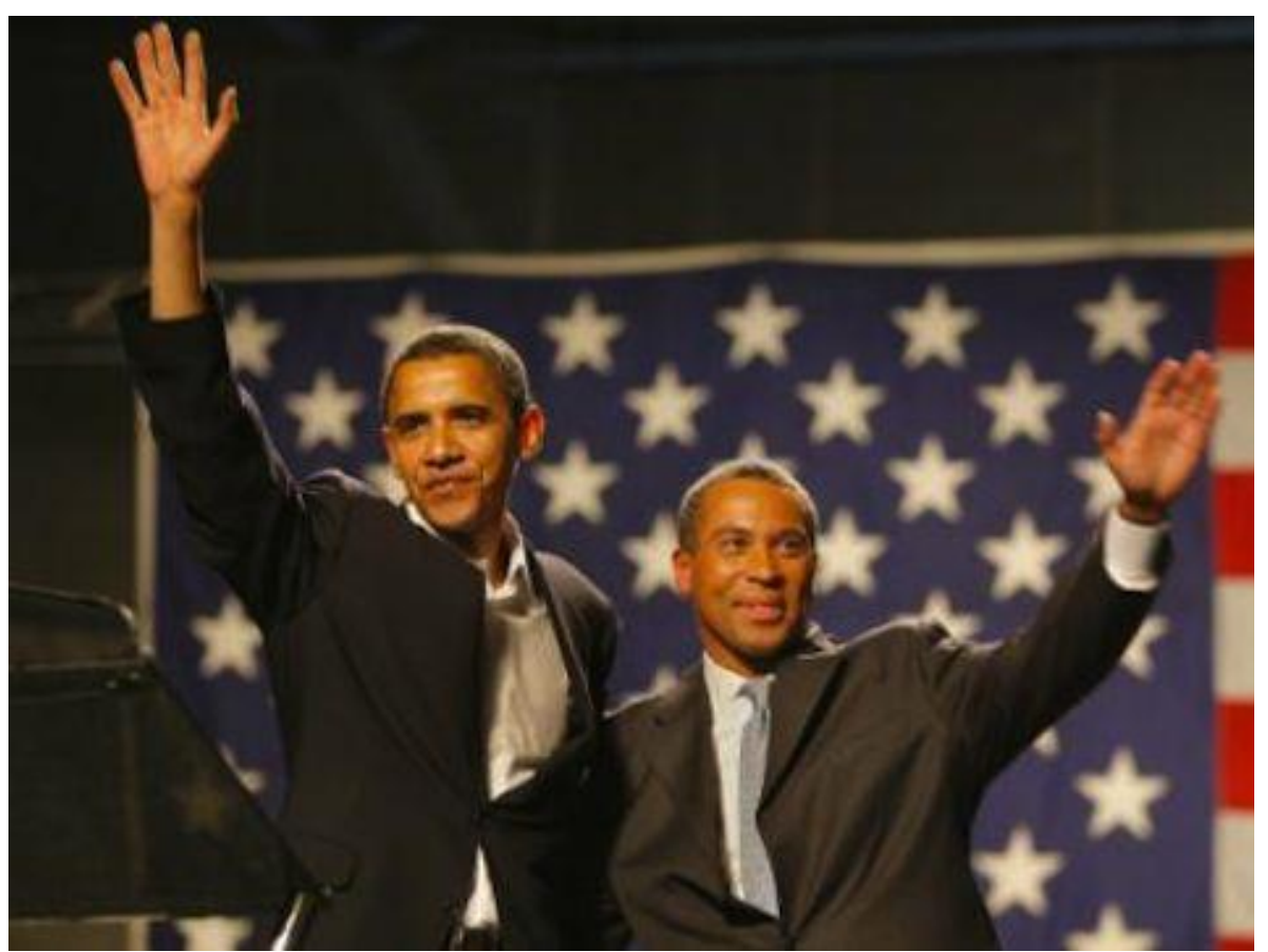
Figure 6: Photo: Pinterest.