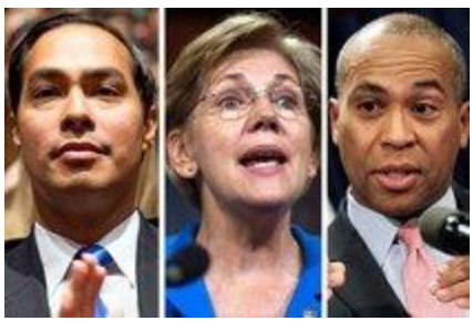
Figure 8: