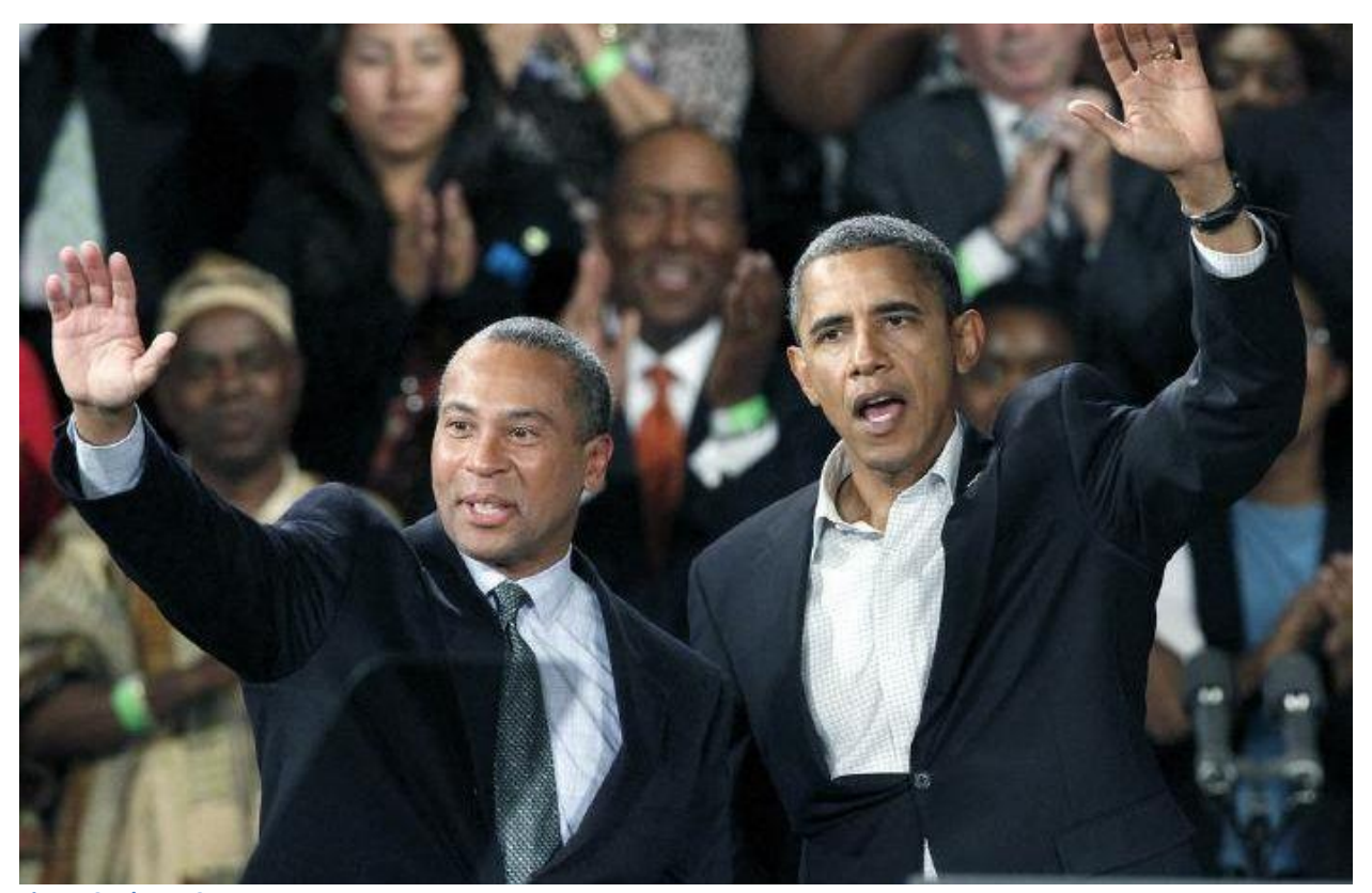
Figure 9: