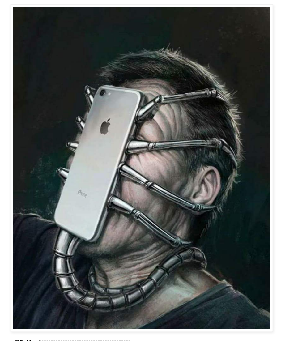
FIG. 11 — Anonymous Patriots. (Oct. 16, 2017). Lock down on prison planet almost complete. American Intelligence Media.

Bookmark: #social-networking-weaponized2 | https://tinyurl.com/y9x4kmox