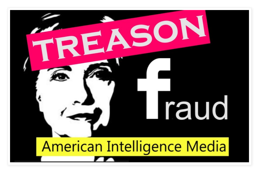
FIG. 10 — Anonymous Patriots. (Oct. 26, 2017). Hillary paid Facebook to rig elections while colluding with Russian Uranium One. American Intelligence Media.

Bookmark: #lockdown-on-prison-planet | https://tinyurl.com/y9w5vaae