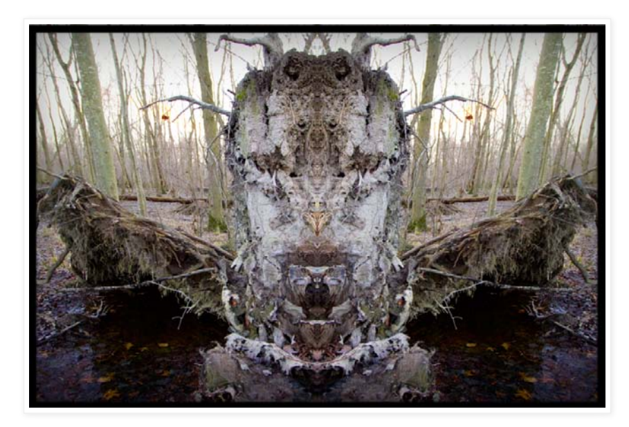
FIG. 13 - Anonymous Patriots. (Mar. 27, 2017). Swamp found. Reveals weapon of mass intelligence. American Intelligence Media.

Notices: This post may contain opinion. As with all opinion, it should not be relied upon without independent verification. Think for yourself. Photos used are for educational purposes only and were obtained from public sources. No claims whatsoever are made to any photo.