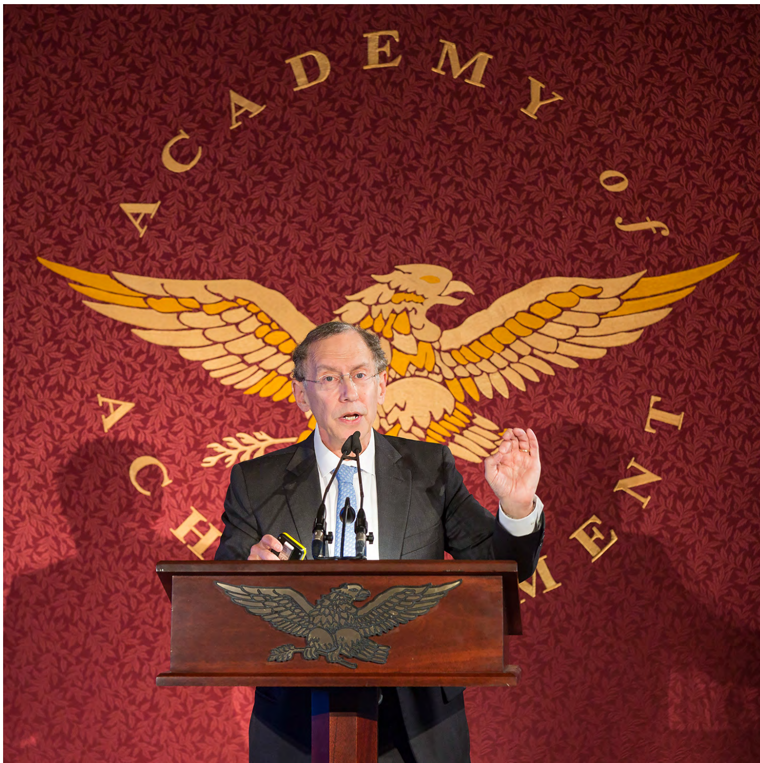
Academy member Dr. Robert S. Langer, David H. Koch Institute Professor at MIT, addresses the Summit delegates.

The Summit program resumed early Wednesday morning at Claridge's with a fascinating audiovisual presentation by a member of the Academy's Class of 2003, Dr. Robert Langer of MIT, the most prolific inventor and entrepreneur in the field of biotechnology. A mentor to many of the most adventurous thinkers in the field today, Dr. Langer's work offers the potential to grow human tissues in the laboratory for the replacement or repair of damaged organs.