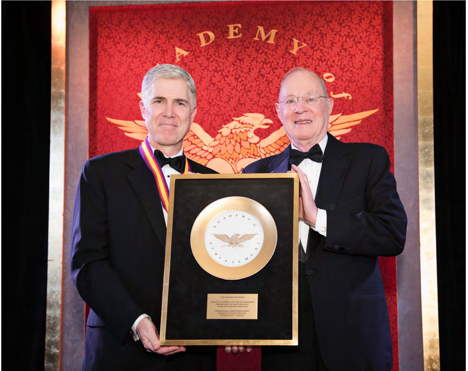
Justices of the Supreme Court of the United States: Anthony M. Kennedy presents the Academy of Achievement's Golden Plate Award to Neil Gorsuch during the 2017 International Achievement Summit at Claridge's in London.

From October 17 to 19, 2017, the 52nd International Achievement Summit brought 75 of the world's outstanding young scholars, scientists, entrepreneurs and public servants to London to meet with the Academy's new honorees and its Awards Council, made up of past recipients of the Academy's Golden Plate Award. These attendees included ten recipients of the Nobel Prize, two Presidents, two Supreme Court Justices, and legendary figures from the worlds of arts and letters, music and motion pictures. Thirty new honorees were inducted into the Academy during two days of fascinating discussions held at the storied hotel Claridge's in the heart of London's elegant Mayfair district.