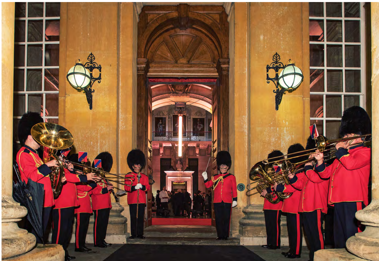
British Imperial Military Band greets Academy members and Marshall Scholars at the entrance of Blenheim Palace. The band is made up of ex-military musicians from the British services; The Army, The RAF and The Royal Marines.