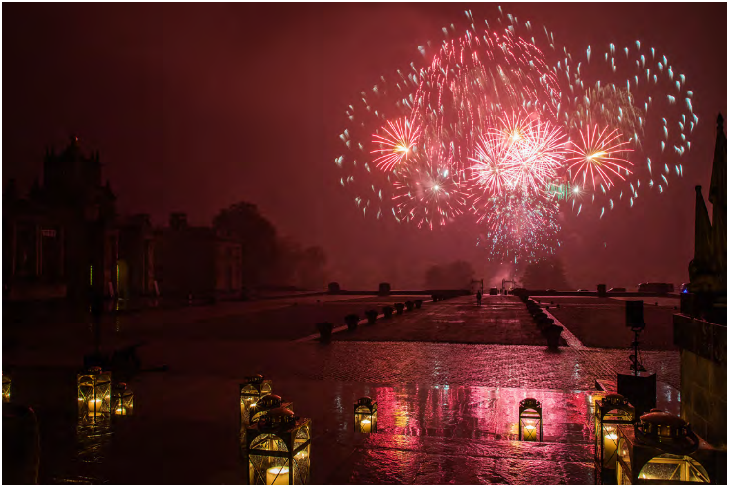
Academy of Achievement guests are treated to a dramatic display of fireworks as they depart Blenheim Palace.

Supreme Court Justice Neil Gorsuch shared with the Marshall Scholars some warm memories of his own experiences as a Marshall Scholar at Oxford. Following dinner, the guests exited by way of the palace's immense courtyard, where they were treated to a spectacular display of fireworks, soaring over the Oxfordshire countryside.