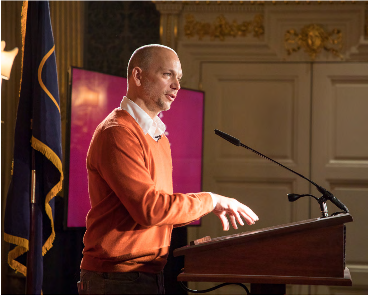
Tony Fadell, Academy member and co-creator of the iPod and Nest Labs, addresses Summit delegates in London.

The youngest member of the United States Supreme Court, Justice Neil Gorsuch, a former Marshall Scholar, shared the impact that his studies in Britain and his experience as a federal judge have had on his understanding of the Constitution, and the importance of tolerance, decency, and respect for the truth.