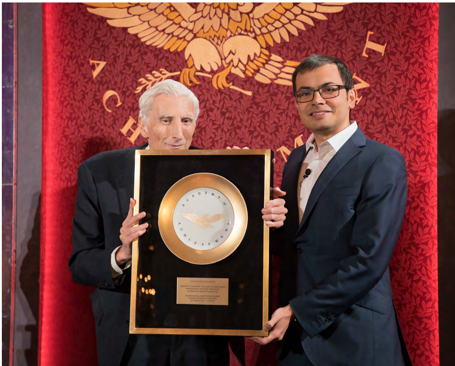
Awards Council member and British cosmologist Lord Martin Rees presents the Golden Plate Award to Demis Hassabis, a British pioneer of artificial intelligence and Founder & CEO of DeepMind, at a ceremony in London.

A member of the Academy's Class of 1999, Britain's Astronomer Royal, Lord Martin Rees , introduced the next honoree, Dr. Demis Hassabis , founder of artificial intelligence company DeepMind. As Hassabis put it, at DeepMind he has set his colleagues the task of "solving intelligence, then solving everything else." A former chess prodigy and international computer games champion, he described his successful effort to build a program that can play the ancient Chinese strategic game Go, and learn from its interaction with human players. The complexity of the game, and its masters' reliance on intangibles such as intuition, make it a perfect challenge for the development of artificial intelligence.