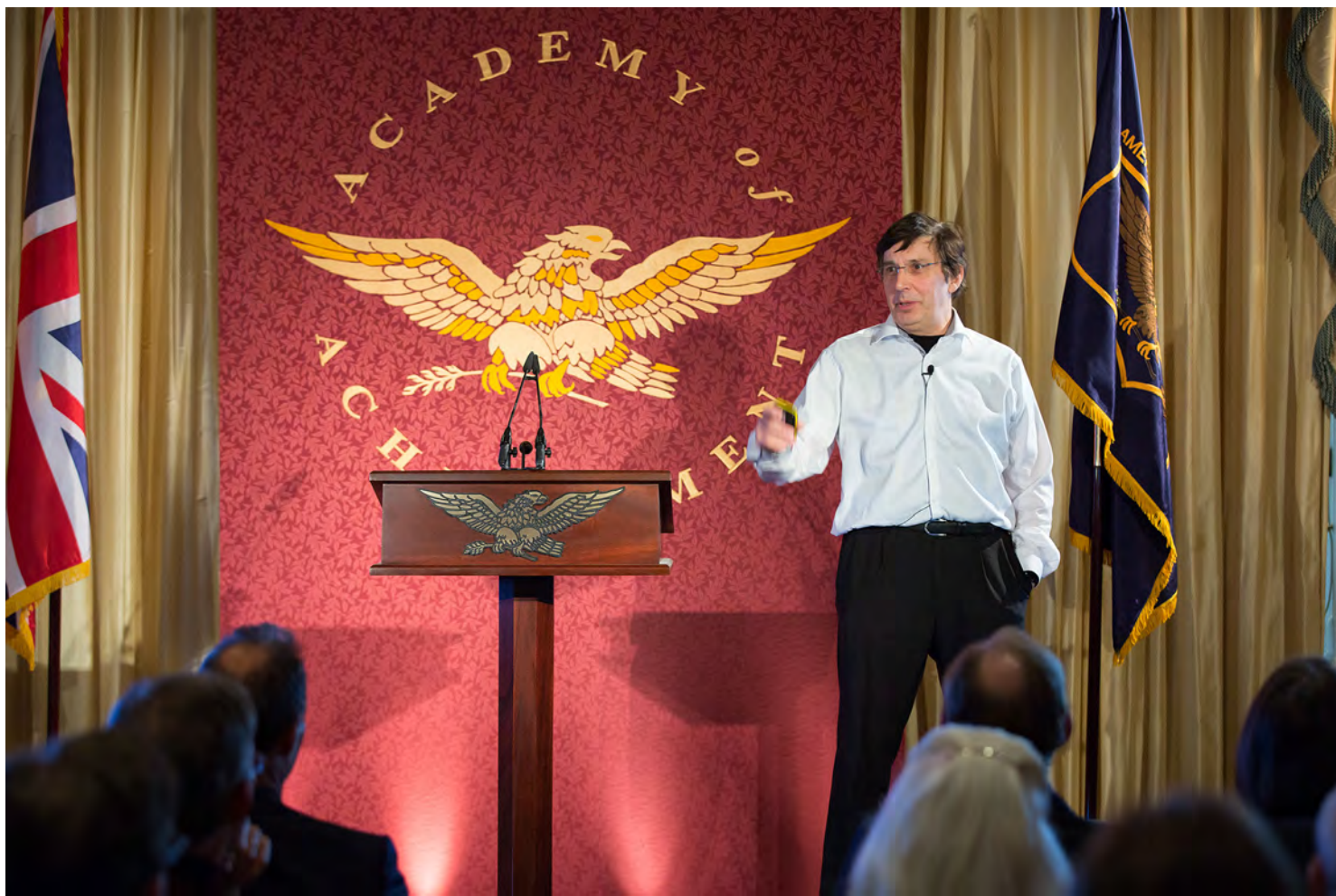
Sir Andre K. Geim, 2017 honoree and recipient of the Nobel Prize in Physics, addresses the Academy delegates.

One of the most gripping presentations of the Summit came from author and documentary filmmaker Sebastian Junger. Author of the bestseller The Perfect Storm , among others, he showed a trailer for his new film, Hell on Earth: The Fall of Syria and the Rise of Isis . Junger looked back at his experiences as a war correspondent and shared the insight that men and women living through horrific circumstances may experience a depth of meaning in their relationships that they cannot easily recapture when they return to everyday life.