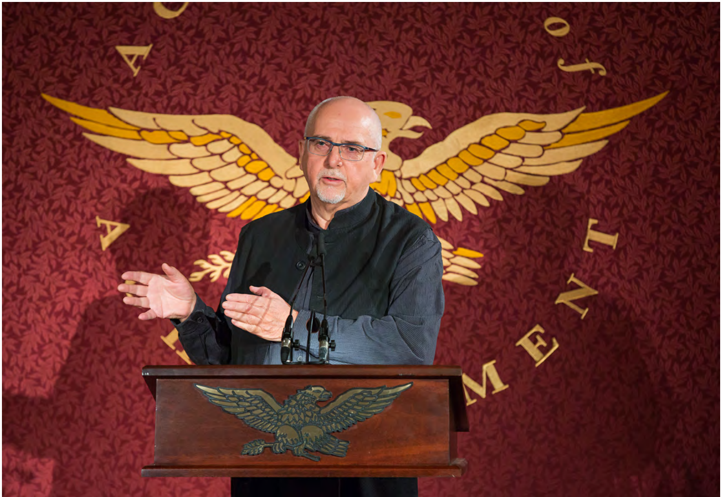
Peter Gabriel, English singer-songwriter and humanitarian, addresses Academy Summit delegates at Claridge's.

Peter Gabriel is a two-time honoree of the Rock and Roll Hall of Fame, as founder and lead singer of the progressive rock band Genesis, and for his stellar career as a solo artist. Looking back at his early struggles as a musician, he urged his listeners to heed their inner voices and leave the criticism to others. He also recalled the experiences that led to his interest in international human rights causes, and his efforts to promote world music through the WOMAD Festival.