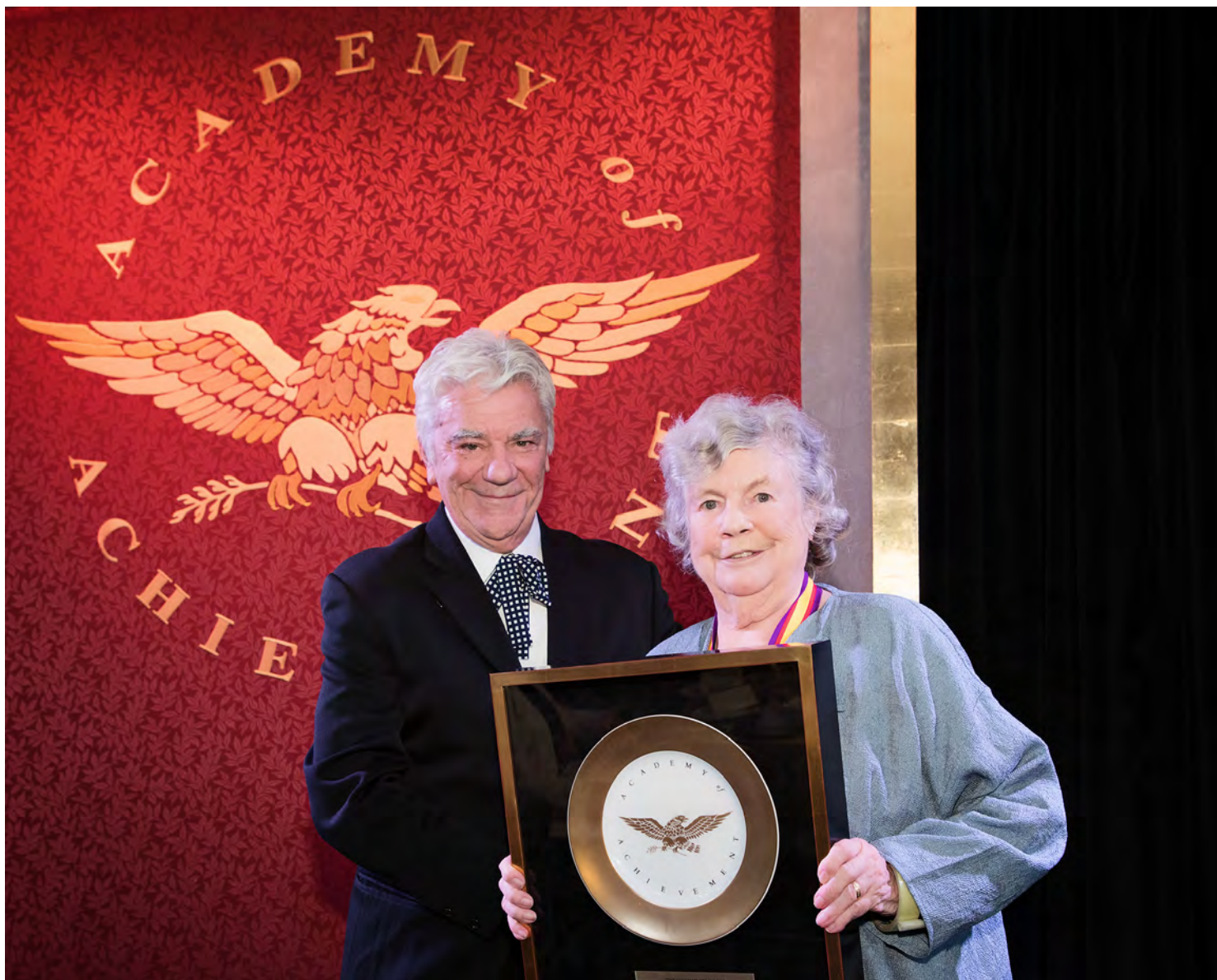
Academy member and award-winning British theater and costume designer John Napier presents the Golden Plate Award to English novelist and essayist Dame Antonia Susan Byatt at the 2017 Summit in Mayfair, London.

Business leaders at the Summit included iPod mastermind Tony Fadell ; McLaren Technology founder Ron Dennis; Boots-Walgreens CEO Stefano Pessina; and Two Sigma founders John Overdeck and Dr. David Siegel. Among the honorees, guests and Awards Council members from the worlds of film and theater were Tony Award-winning director Bartlett Sher, Oscar-winning film director Sir Peter Jackson , and Oscar-winning actors Jeremy Irons and Sir Michael Caine .