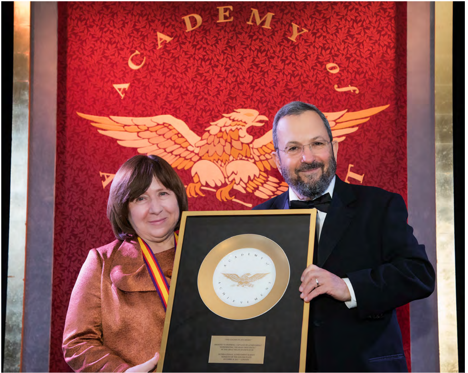
Awards Council member and former Prime Minister of Israel Ehud Barak presents the Golden Plate Award to Nobel Prize recipient Svetlana Alexievich at a ceremony during the 2017 International Achievement Summit in London.

Major literary figures in attendance included recipients of Britain's Man-Booker Prize John Banville and A.S. Byatt, and two Nobel laureates in Literature, Svetlana Alexievich and Kazuo Ishiguro . Other journalists and authors in attendance included Pulitzer Prize recipients Rick Atkinson and photojournalist Lynsey Addario , bestselling author and documentary filmmaker Sebastian Junger, and broadcasters Charlie Rose and Chris Wallace. More domains of art were represented by legendary fashion designer Valentino Garavani and world-renowned architect Lord Norman Foster .