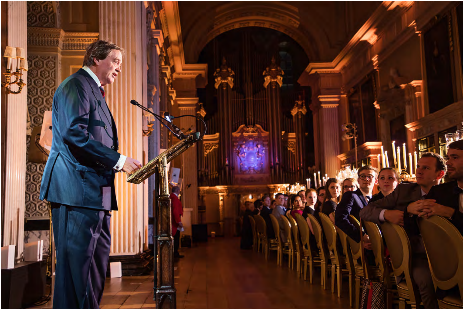
Charles James Spencer-Churchill, 12th Duke of Marlborough, welcomes the Academy guests to Blenheim Palace.

In Cliveden's ornate French Dining Room, Academy members and guests heard Pulitzer Prize-winning journalist and author Rick Atkinson recount the dramatic history of the house. Previously home to the Dukes of Buckinghamshire and Somerset, and the Prince of Wales, in the 20th century it was purchased by William Waldorf Astor, an expatriate American who was ennobled for his services to Britain during the First World War. The first Viscount Astor gave the estate as a wedding present to his son Waldorf Astor and Waldorf's American wife, Nancy, whose likeness can be seen in the house's Great Hall in a radiant portrait by John Singer Sargent. In time, Waldorf became the 2nd Viscount Astor, and his wife the first woman to take a seat in Parliament. Through the decades preceding the Second World War, their house became a favorite gathering place for Britain's literary and political intelligentsia.