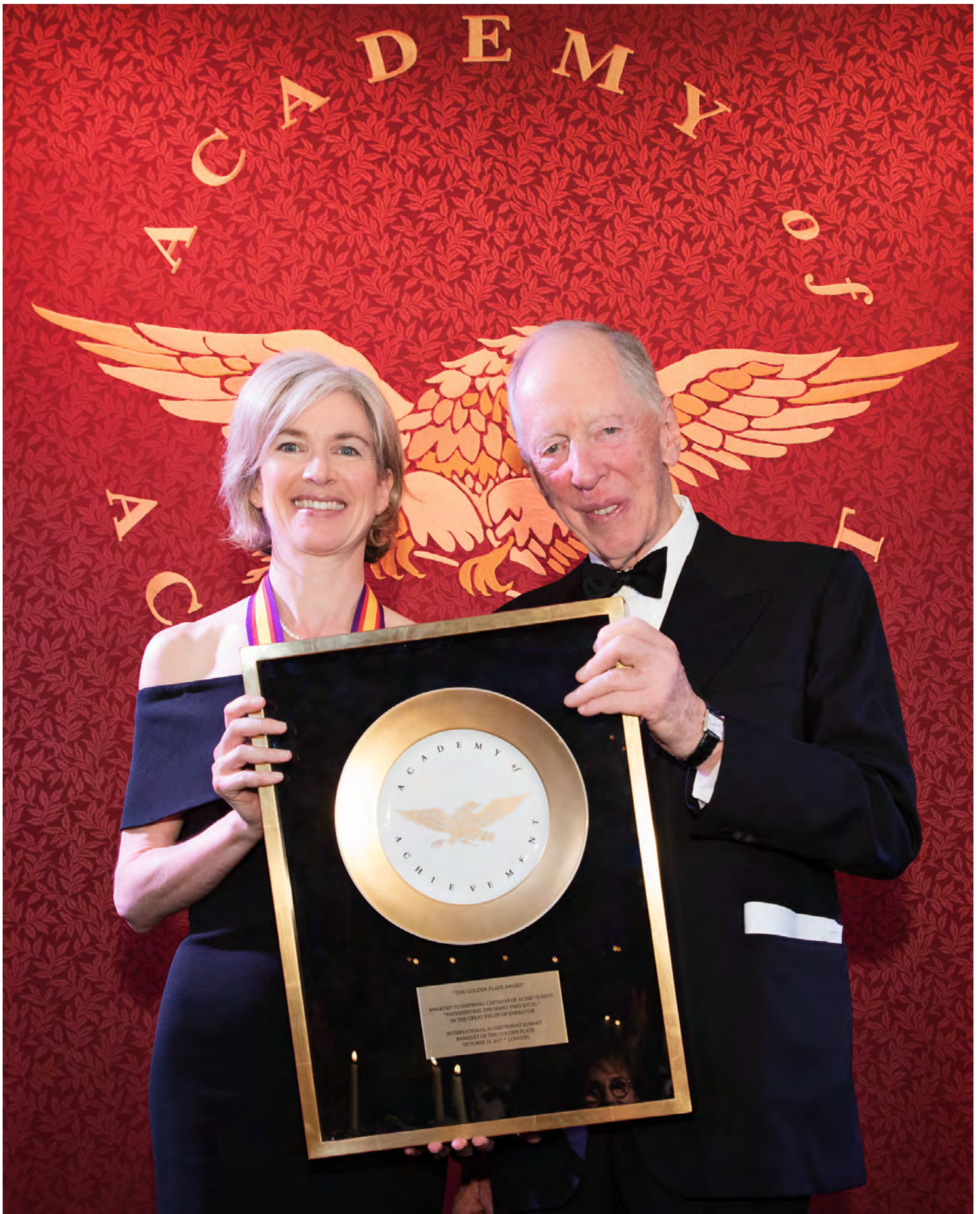
Awards Council member Lord Jacob Rothschild presents the Academy of Achievement's Golden Plate Award to Dr. Jennifer A. Doudna, co-developer of the CRISPR gene editing technology, in a ceremony at Claridge's in London.