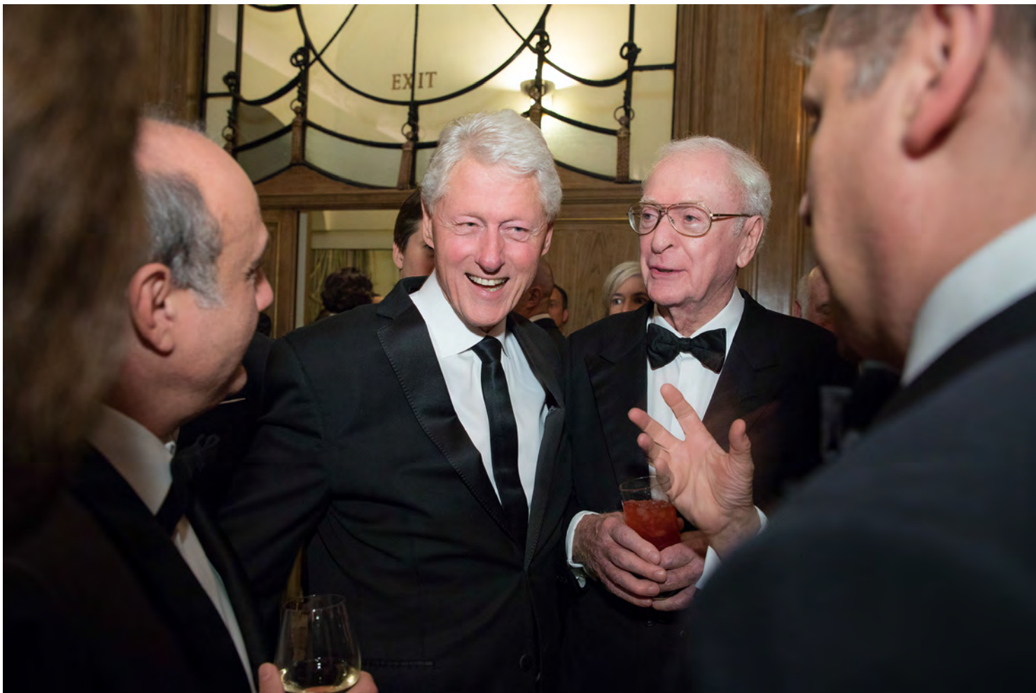
Academy Awards Council member Bill Clinton, 42nd President of the United States, with 2017 honoree English actor Sir Michael Caine and guests at the honoree reception prior to the Banquet of the Golden Plate ceremonies.

The Academy's 2017 delegates included some of the world's most promising young scholars, scientists and entrepreneurs — Marshall Scholars, Soros Fellows, medical students and young physicians of the Howard Hughes Medical Institute and the Harvard-MIT Medical Scientist Training Program — as well as scholars from the United Arab Emirates, Bahrain and Israel. Many have founded their own companies, nonprofits and NGOs. One is the Mayor of Ithaca, New York, and another is a member of Israel's parliament.