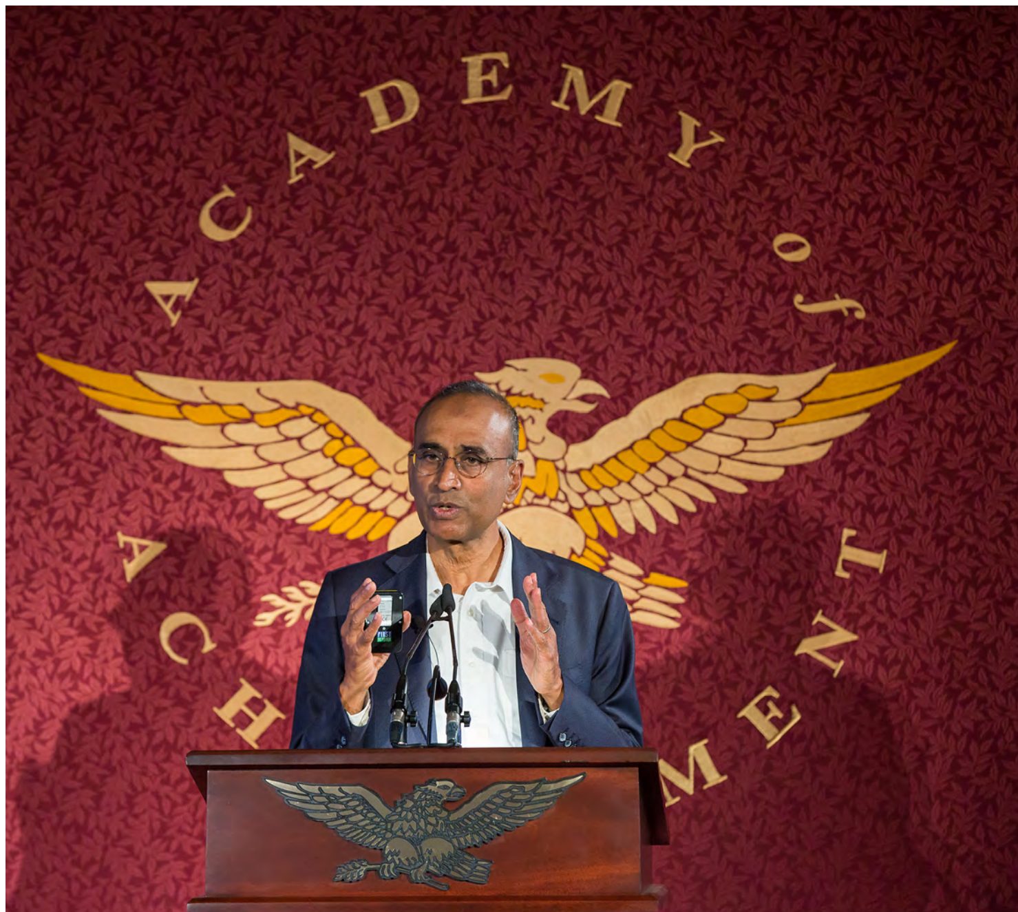
Nobel Prize-winning structural biologist and 2017 honoree Dr. Venki Ramakrishnan addresses Summit delegates.

Another intriguing speaker that morning was Sir Venki Ramakrishnan , the president of the world's oldest scientific association, Britain's Royal Society. Born in India and educated in the United States, he made a crucial decision to take up the study of biology after he had already completed a doctorate in physics. This unusual choice made it difficult for him to pursue an academic career in the United States, but he eventually won a position as chief of the molecular biology lab at Cambridge University. His exploration of the molecular structure of the ribosome, and its implication for protein synthesis and the antibiotic function, earned him the 2009 Nobel Prize in Chemistry.