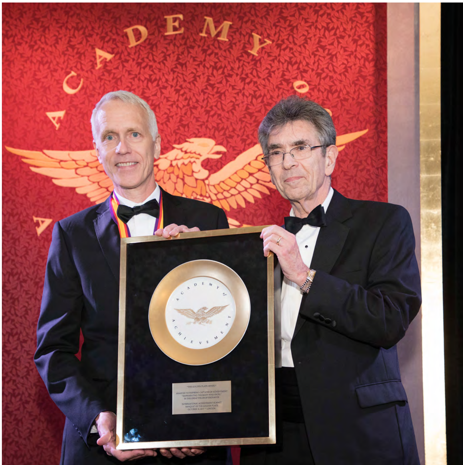
2017: Awards Council member Dr. Robert J. Lefkowitz presents the Academy of Achievement's Golden Plate Award to Dr. Brian K. Kobilka during the Banquet of the Golden Plate ceremonies in London, England. In 2012, the Nobel Prize in Chemistry was awarded jointly to Drs. Lefkowitz and Kobilka "for studies of G-protein-coupled receptors."

Sir John Gurdon, the recipient of the 2012 Nobel Prize in Chemistry, reviewed his work in the fields of cell nucleus transplantation and cloning, breakthroughs that initiated a new era of stem cell research. A former master of Trinity College, Cambridge, and the longtime leader of Wellcome's cancer research arm, now known as the Gurdon Institute, Sir John demonstrated in a few minutes the charm and wisdom that have endeared him to generations of young scientists at Cambridge.