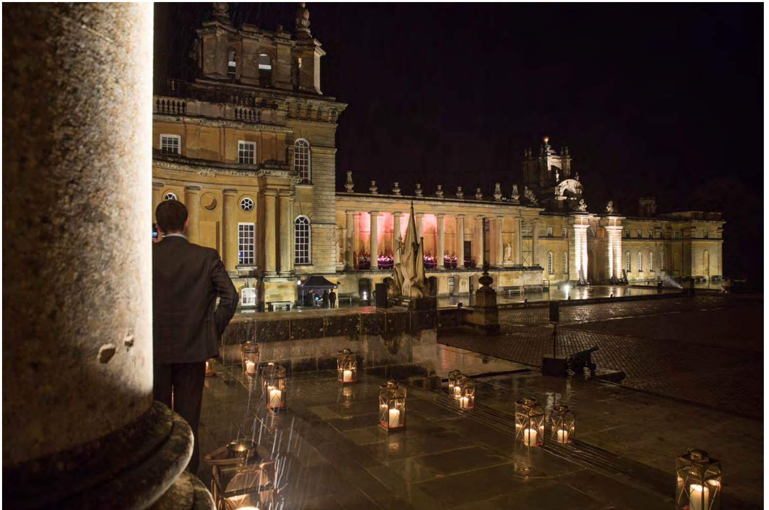
Blenheim Palace, Woodstock, Oxfordshire: Blenheim Palace was built as a gift to John Churchill, 1st Duke of Marlborough, from Queen Anne and a grateful nation in thanks for his victory at the Battle of Blenheim on 13th August 1704. Today, the palace is home to the 12th Duke of Marlborough and his family, and to one of the most important and extensive collections in Europe, which includes portraits, furniture, sculpture and tapestries.

The morning's second speaker, famed broadcaster Charlie Rose, invoked the power of questions as a tool for finding truth in the midst of controversy. The Irish novelist John Banville , winner of the Man-Booker Prize for his 2005 novel, The Sea , gave a witty account of his lifelong passion for literature. Filmmaker Sir Peter Jackson , best known for his Oscar-winning trilogy, The Lord of the Rings , described his youth in a small town in New Zealand, and his early passion for filmmaking. A homemade horror film he created with his friends led him to the Cannes Film Festival and a career as one of the most successful filmmakers of all time. Dr. F. Duncan M. Haldane, a recipient of the Nobel Prize in Physics, described his research into exotic states of matter, such as his discovery of topological quantum matter and his exploration of the physics of light.