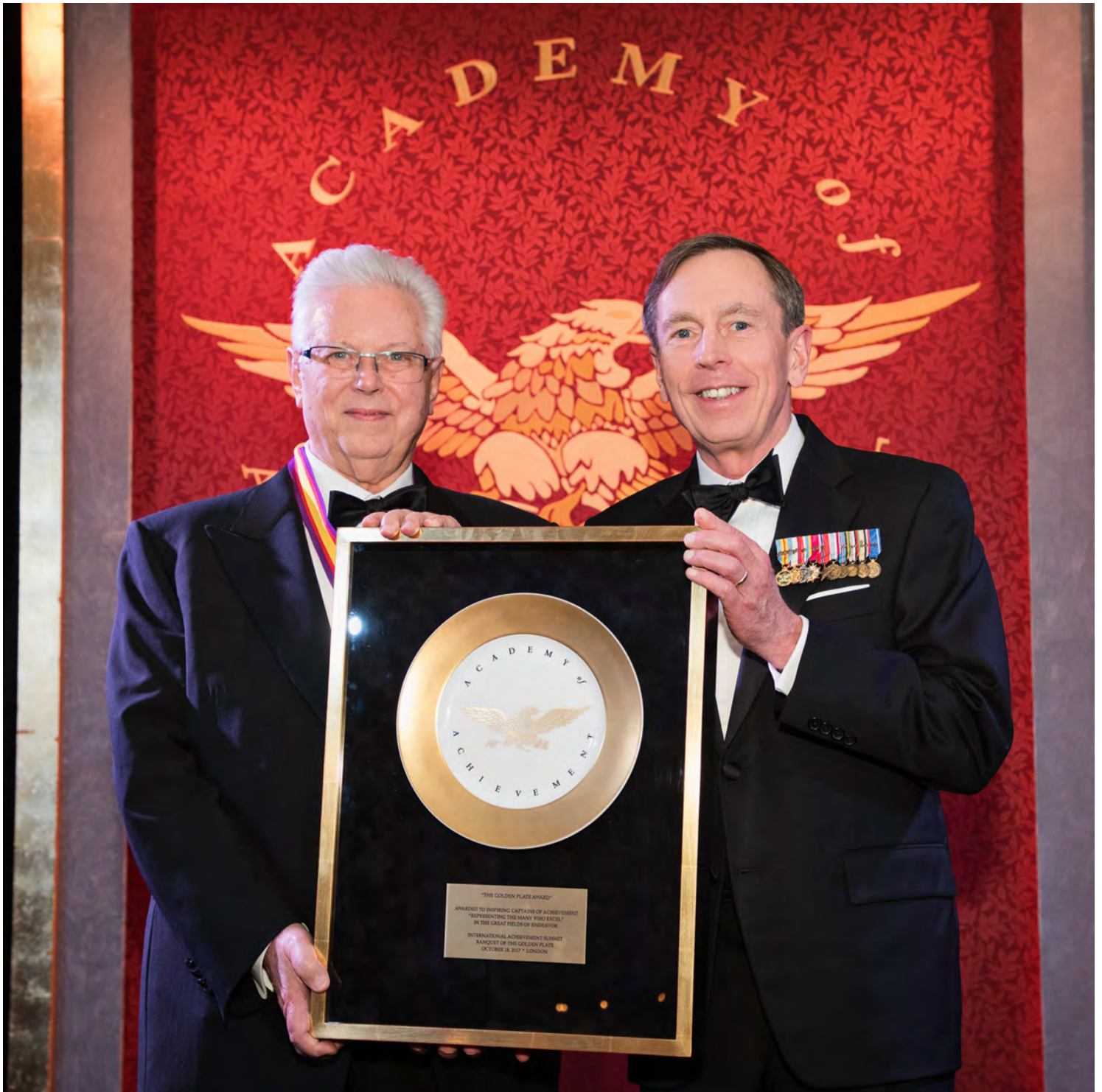
Council member General David H. Petraeus, USA presents the Academy of Achievement's Golden Plate Award to the CEO of Walgreens Boots Alliance, Stefano Pessina, during a ceremony at Claridge's Hotel in Mayfair, London.