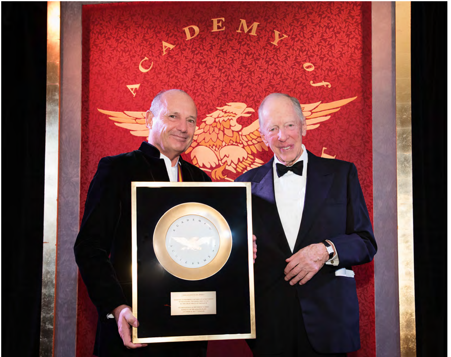
Lord Jacob Rothschild presents the Golden Plate Award to Ron Dennis, the founder of McLaren Technology Group.

John Overdeck is a founder and Co-CEO of the revolutionary investment firm Two Sigma, which deploys cutting-edge data mining to uncover hidden value in the world's markets. He shared the story of his evolution from teenage math prodigy to executive at Amazon and founder of Two Sigma.