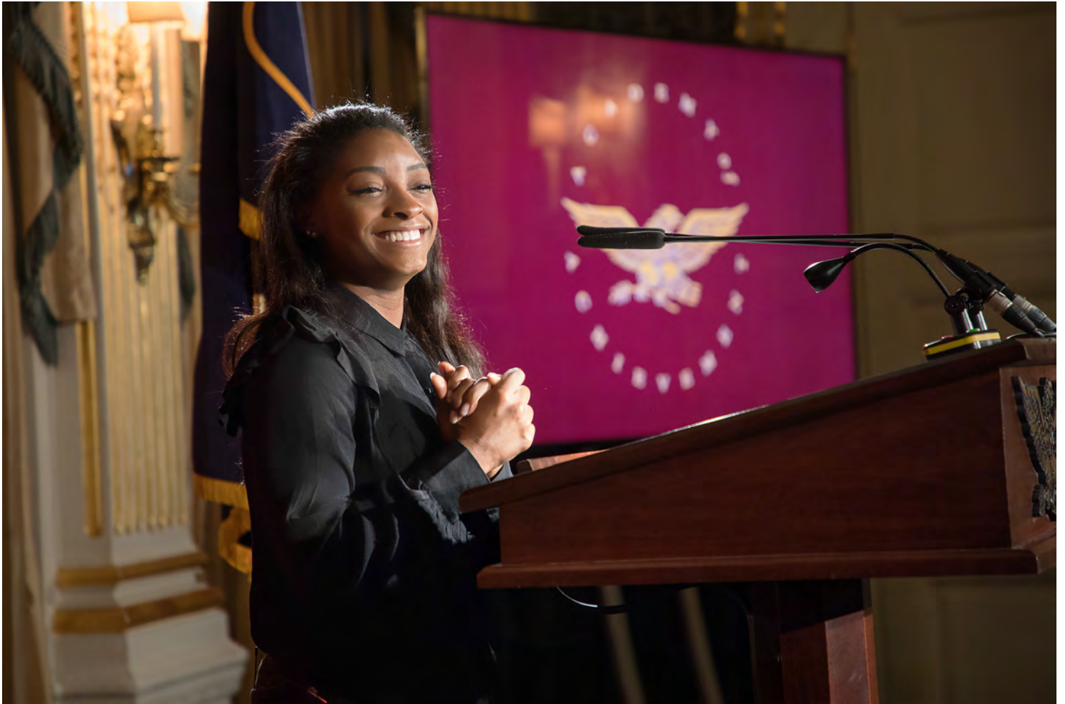
Simone Biles, 2017 honoree and first U.S. gymnast to win four Olympic gold medals, addresses Summit delegates.

Four-time Olympic gold medalist Simone Biles , a 2017 honoree, gave a graceful and articulate account of her progress from an impoverished childhood, abandoned by her drug-addicted mother, to her reign as America's most decorated gymnast.