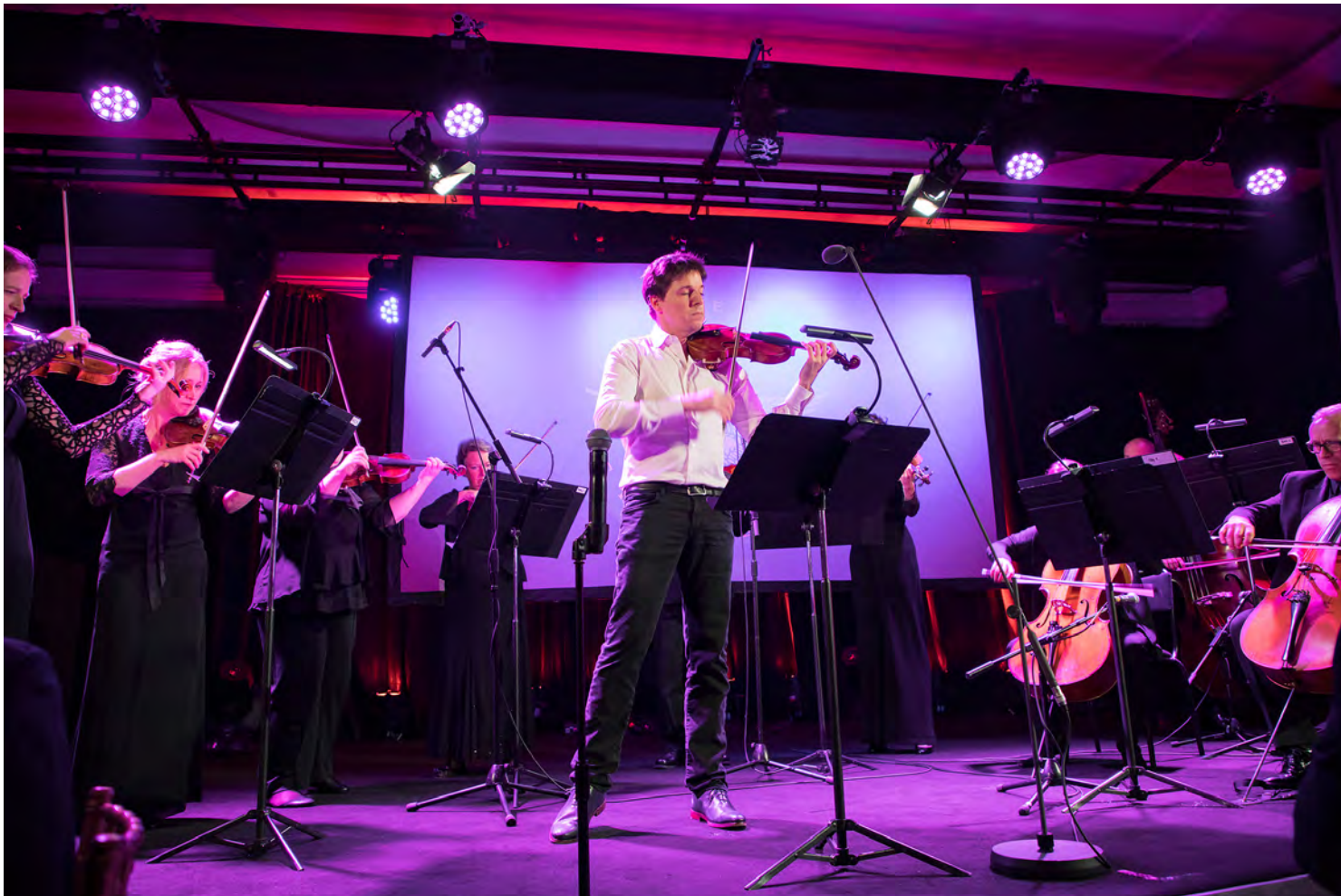
Joshua Bell, Academy member and celebrated virtuoso violinist, performs with the renowned chamber orchestra The Academy of St. Martin in the Fields during the opening dinner of the 2017 International Achievement Summit.

From the electric rock of Led Zeppelin, the evening turned to musical excellence of another kind with a visit from Academy member Joshua Bell, a world-renowned violinist and now director of the venerable Academy of St. Martin in the Fields. Along with ten members of his orchestra, Bell presented a fascinating study in musical contrasts. They opened with a spirited performance of the “Summer” movement from Vivaldi’s “The Four Seasons,” followed by another musical depiction of summer from “The Four Seasons of Buenos Aires” by the 20th-century Argentine composer Astor Piazzolla. Joshua Bell and his ensemble brought the same breathtaking energy and near-telepathic precision to Vivaldi’s shimmering Baroque cadences as they did to Piazzolla’s propulsive tango rhythms. After the stimulating discussion and dazzling performances of the evening, conversation among delegates and honorees continued into the small hours at a sumptuous reception in the elegant French Salon at Claridge’s.