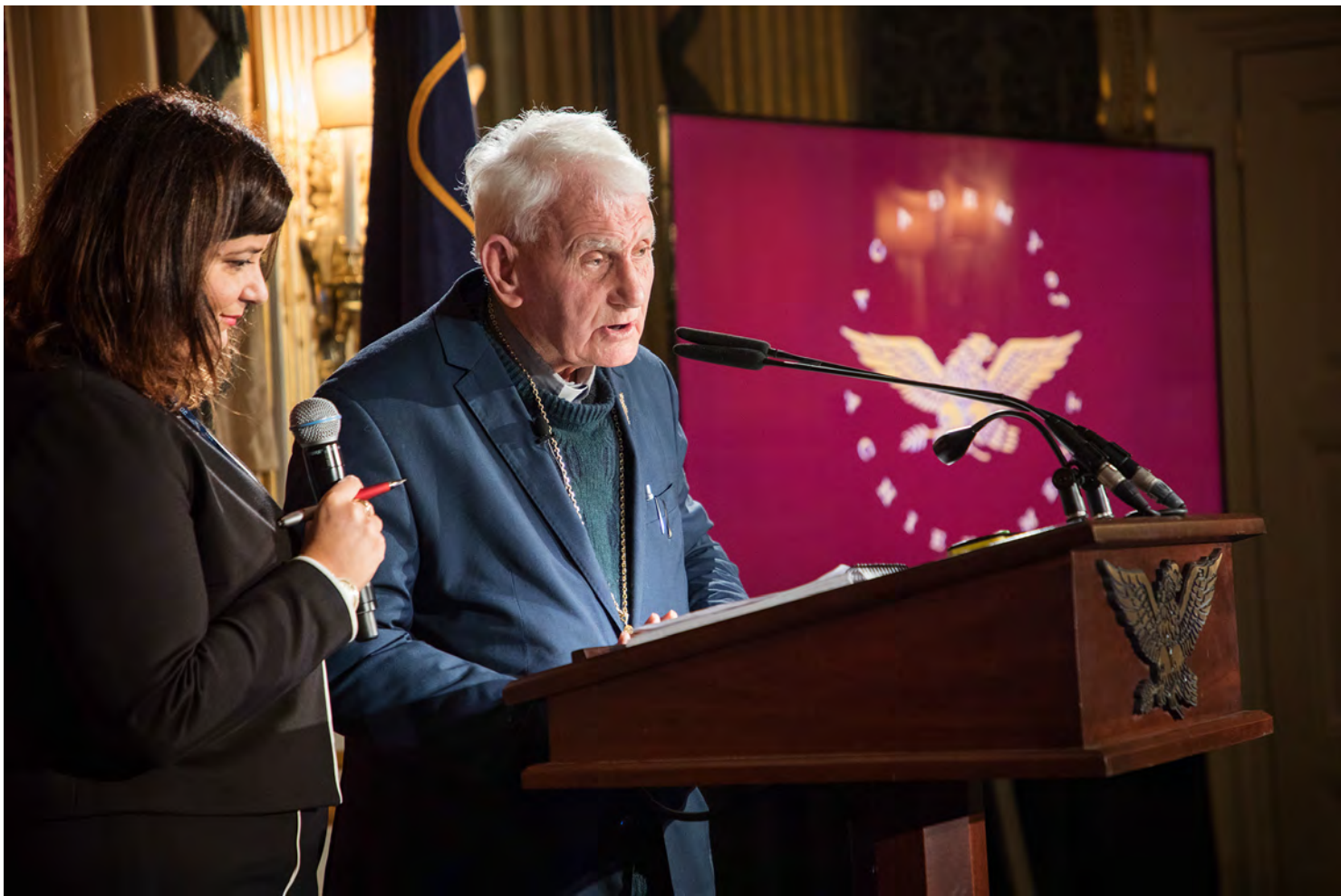
Cardinal Ernest Simoni addresses Academy Summit delegates and members in London. Cardinal Simoni endured 28 years of dire imprisonment and forced labor under Albania communist rulers for refusing to renounce his faith.

A member of the Academy's Class of 1998, Dr. Andrew Weil is a pioneer of integrative medicine, the synthesis of Western medicine with medical knowledge derived from other sources and traditions. A trained botanist, his study has embraced a vast variety of medicinal herbs and organic substances. On this occasion, he spoke about the history, chemistry, and biology of cannabis. As a fourth-year student at Harvard Medical School, Dr. Weil conducted the first double-blind placebo study of cannabis. In a briskly erudite survey, Dr. Weil moved from the culinary and industrial uses of hemp products to the medicinal potential of cannabis and the legal and political obstacles to its thorough study and exploitation.