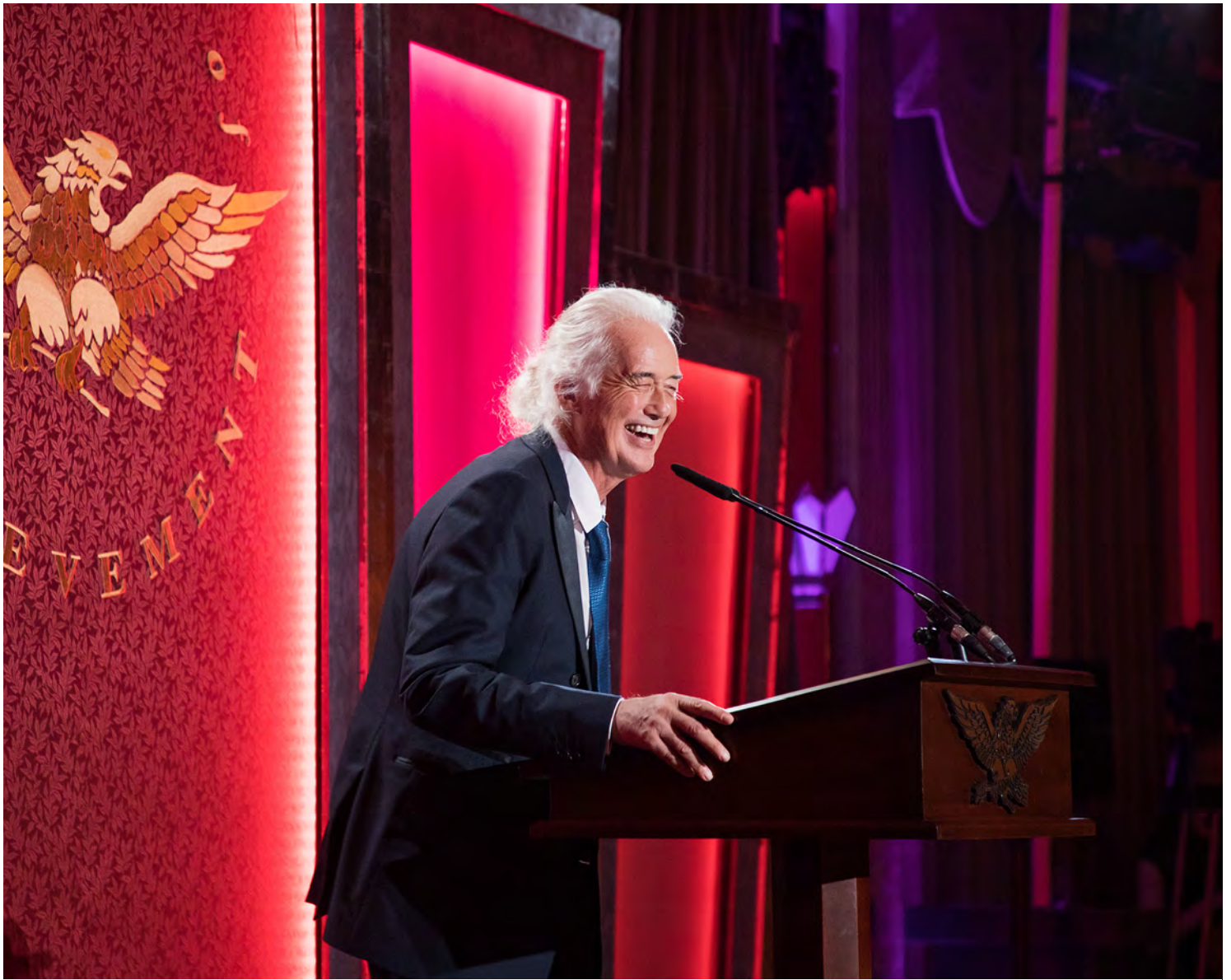
Jimmy Page, 2017 honoree, English guitarist, and founder of the rock band Led Zeppelin, addresses the delegates.

The evening's contemplation of the problems of artificial intelligence and the nature of mind was broken by a blast of electric guitar pyrotechnics — a film clip of fretboard wizard Jimmy Page of Led Zeppelin performing his rock classic “Stairway to Heaven.” Following the film clip, Jimmy Page himself took the stage to give a disarmingly humble and self-effacing account of his rise in the world of music. He credits his success to his passion for the music and his persistence in mastering his craft. He shared a sincere pride in the lasting popularity of the music he created, a popularity he attributes to the absolute conviction he and his Led Zeppelin bandmates brought to their work.