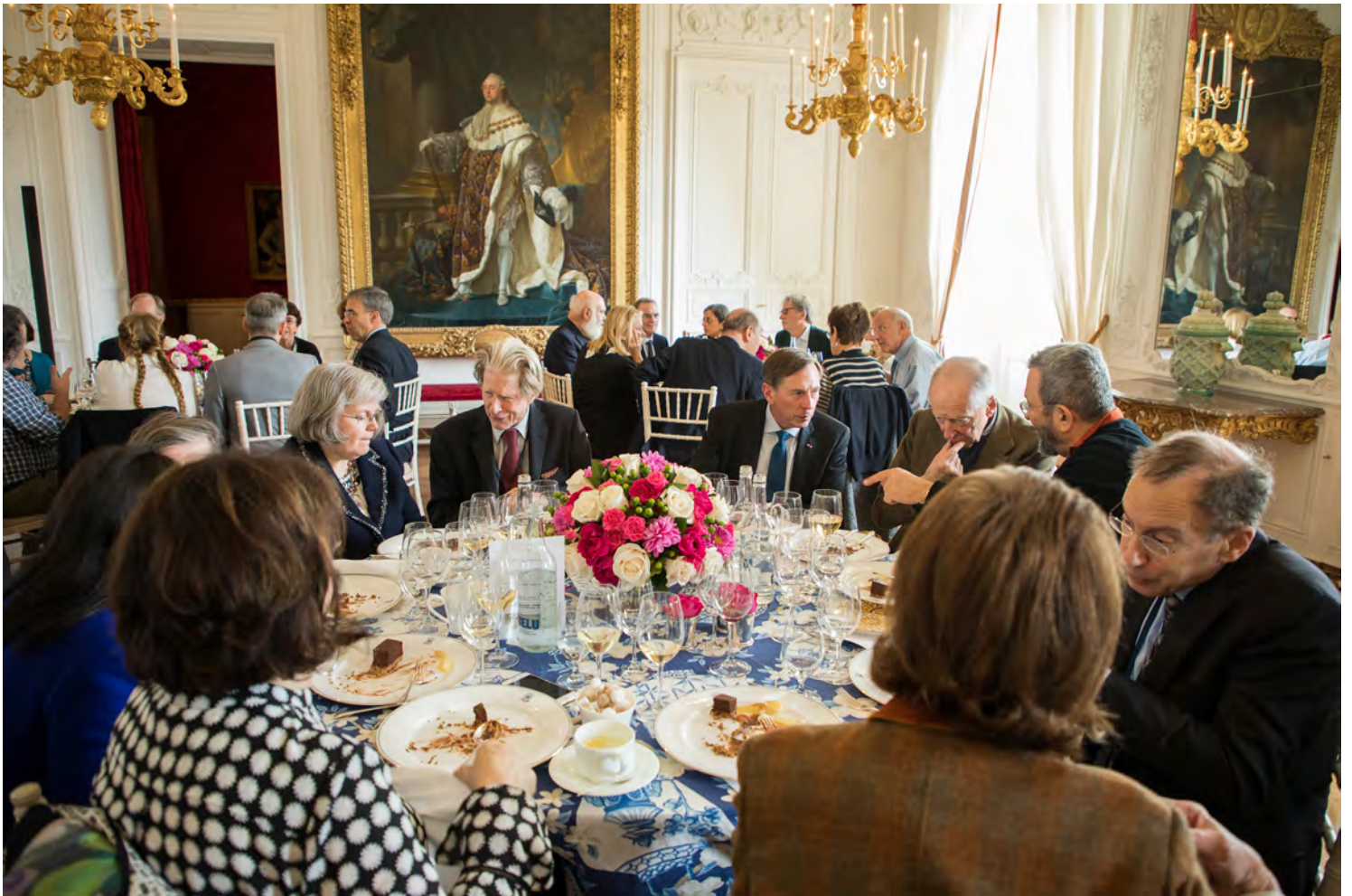
Academy members and spouses enjoy an intimate luncheon in the White Drawing Room at Waddesdon Manor.

On their return to Cliveden that afternoon, the Academy members heard from the Academy's last new honoree of 2017. The courageous photojournalist Lynsey Addario was awarded the Pulitzer Prize for The New York Times Magazine photo essay "Talibanistan." While her stunning photographs were projected on a large video screen, she recounted the extraordinary dangers and ordeals she had endured to cover her stories, including capture and imprisonment during Libya's civil war. General David Petraeus and Rick Atkinson presented the Academy's Golden Plate Award to Addario following her presentation. The last speaker of the afternoon was Lord Martin Rees , the Astronomer Royal, who shared his witty and imaginative speculations about the future of such phenomena as the independent evolution of intelligent machines in outer space.