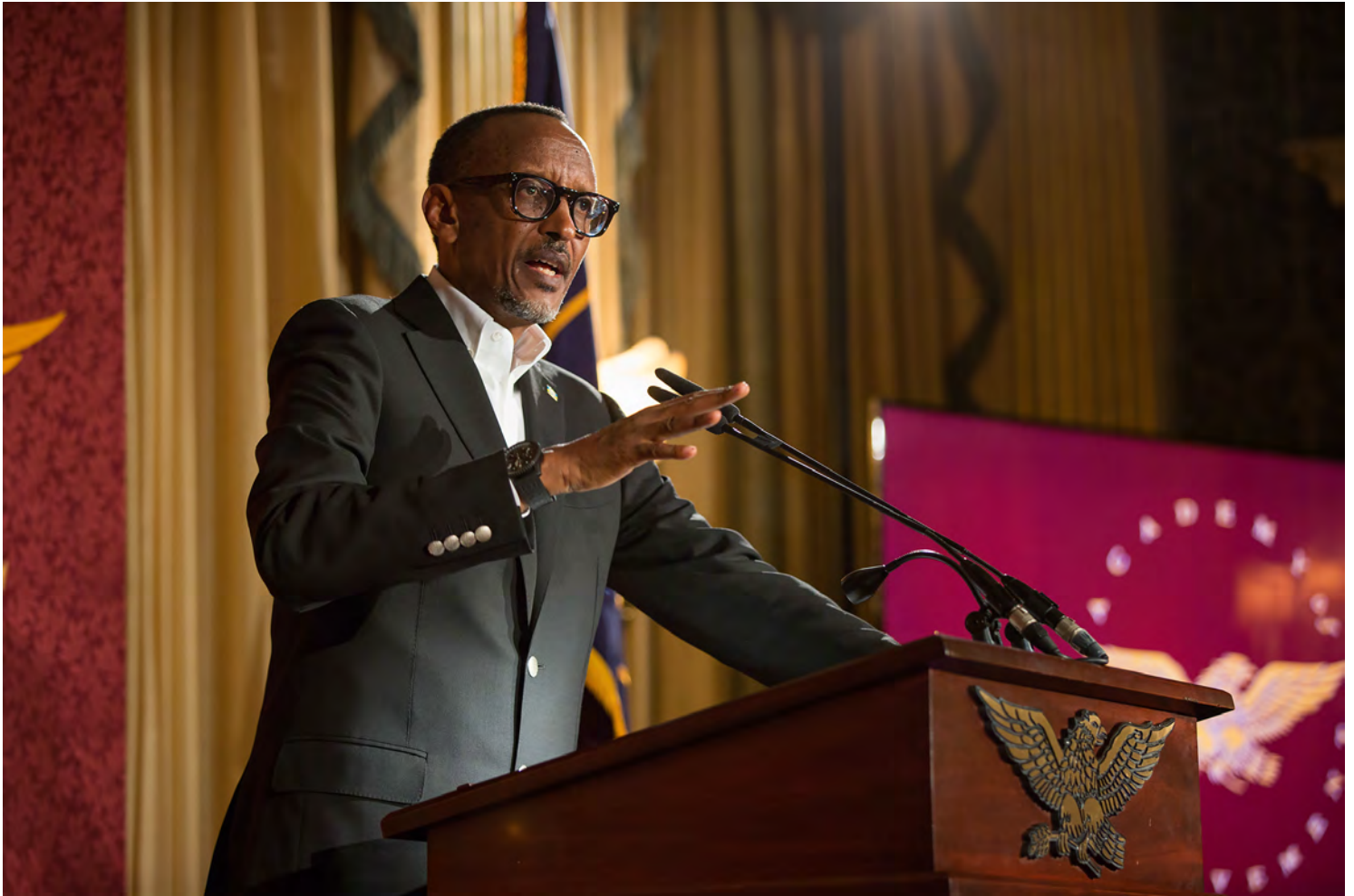
2017 honoree Paul Kagame, President of the Republic of Rwanda, addresses Summit delegates in Mayfair, London.

Cardinal Ernest Simoni, who survived a lifetime of persecution for his faith under a Communist dictatorship in Albania, recalled the circumstances that led to his arrest and imprisonment. Twice sentenced to death, his sentence was commuted to hard labor. Cardinal Simoni, who speaks both Albanian and Italian, delivered his remarks through an Italian interpreter. He affirmed his belief that God's power is love and noted that he forgave his oppressors at every turn, prayed for them and said mass for them.