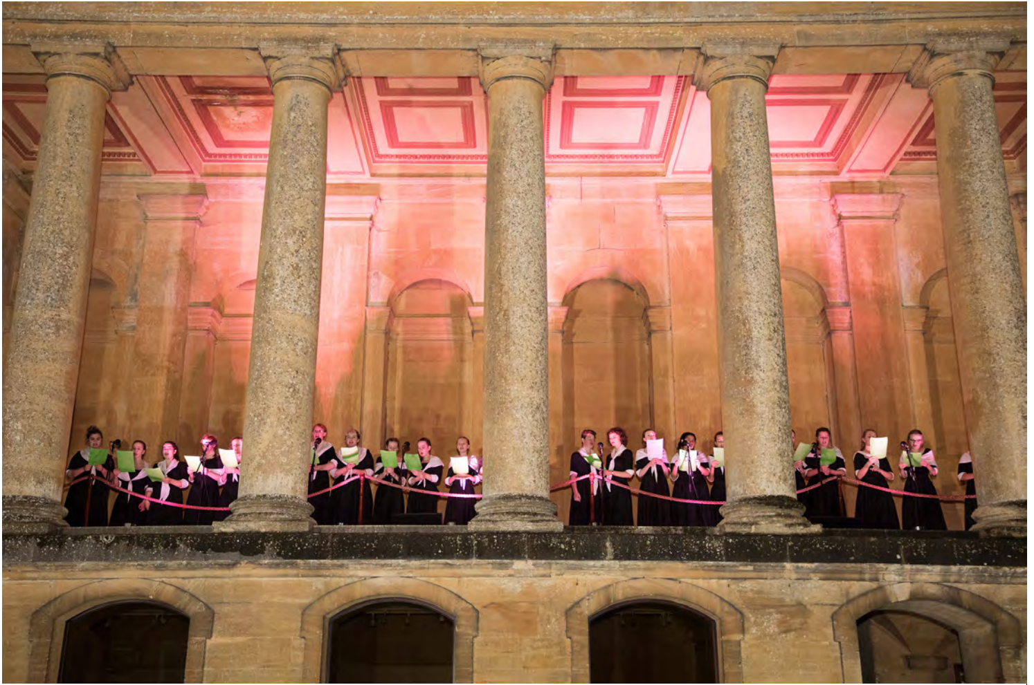
At the conclusion of dinner, guests move to the Palace's courtyard and enjoy a final song by the Oxford Choir.

Over dinner, guests were serenaded by the Oxford Girls' Choir. Retired General David Petraeus , former director of the CIA, discussed the special relationship between the United States and Britain. He focused on the role played by Winston Churchill, the son of an American mother, in forging a wartime alliance, through his close collaboration with President Franklin Roosevelt and General Dwight Eisenhower.