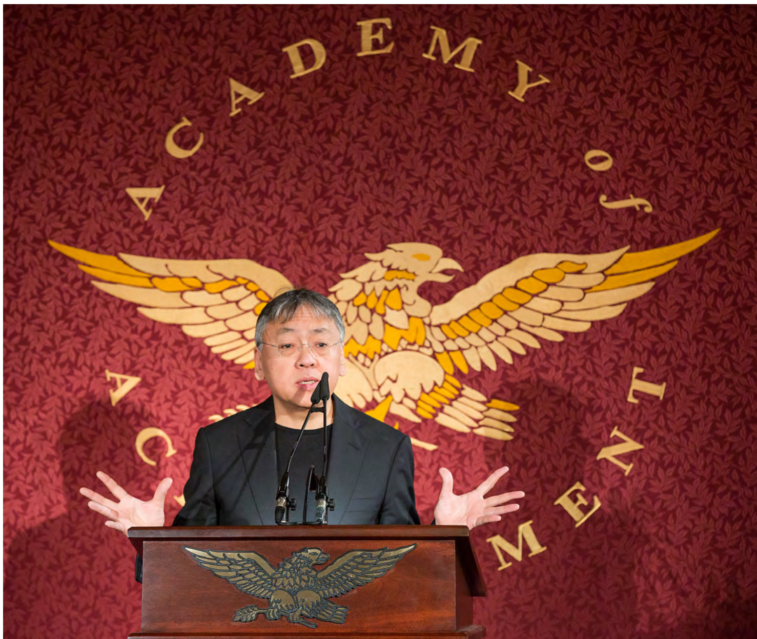
Nobel Prize-winning British author and 2017 honoree Kazuo Ishiguro addresses the Academy Summit delegates.

Kazuo Ishiguro, author of the international bestsellers The Remains of the Day and Never Let Me Go , was already one of Britain's most honored novelists when he was invited to attend the International Achievement Summit as an honoree. Less than two weeks before the Summit, he was awarded the world of letters' highest honor, the Nobel Prize in Literature. The Japanese-born, British-educated author described the small moments of discovery that enabled him to find himself as a writer, in terms of both technique and subject matter.