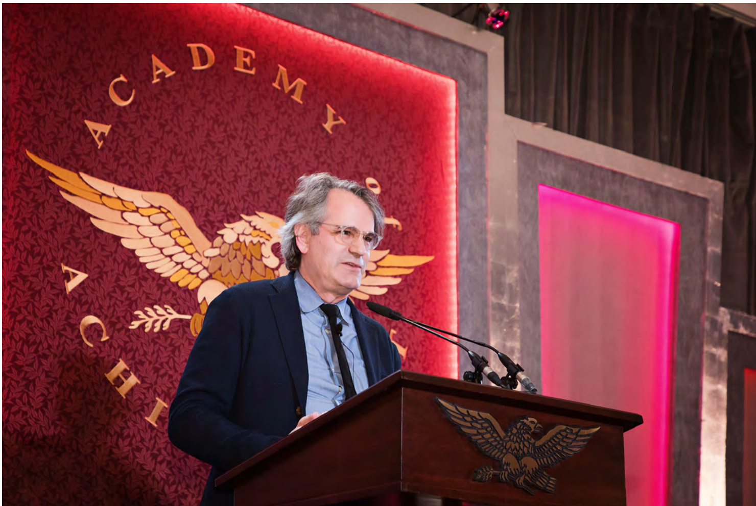
Bartlett Sher, Tony Award-winning theater director and member of the Class of 2017, addresses Summit delegates.

A member of the Academy's Class of 2000, Oscar-winning actor Jeremy Irons , took the stage to introduce Tony Award-winning Broadway director Bartlett Sher and present him with the Academy's Golden Plate Award as the first inductee of the Academy's Class of 2017. Bartlett Sher spoke passionately of his life in the theater, and the ways in which a play such as Oslo , which deals with the Middle East peace process, took on completely different significance, in the light of current events, when he staged it in different cities over a period of less than two years.