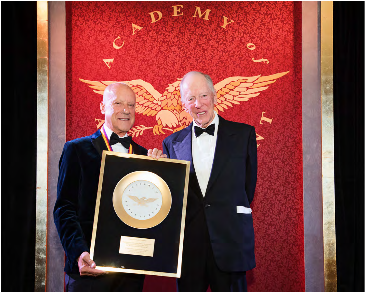
Council member Lord Jacob Rothschild presents the Golden Plate Award to British architect Lord Norman Foster.

Leading scientists participating in the Summit included the pioneer of CRISPR technology, Dr. Jennifer Doudna ; integrative medicine pioneer Dr. Andrew Weil ; biomedical engineer Dr. Robert Langer ; the Astronomer Royal, Lord Martin Rees ; Chief of Surgery at the National Cancer Institute Dr. Steven Rosenberg ; and the following recipients of the Nobel Prize: Sir Andre Geim , Sir John Gurdon , Dr. F. Duncan M. Haldane , Dr. Brian Kobilka , Dr. Robert Lefkowitz , Dr. Randy Schekman , Dr. Joseph Stiglitz and Sir Venki Ramakrishnan , President of the Royal Society.