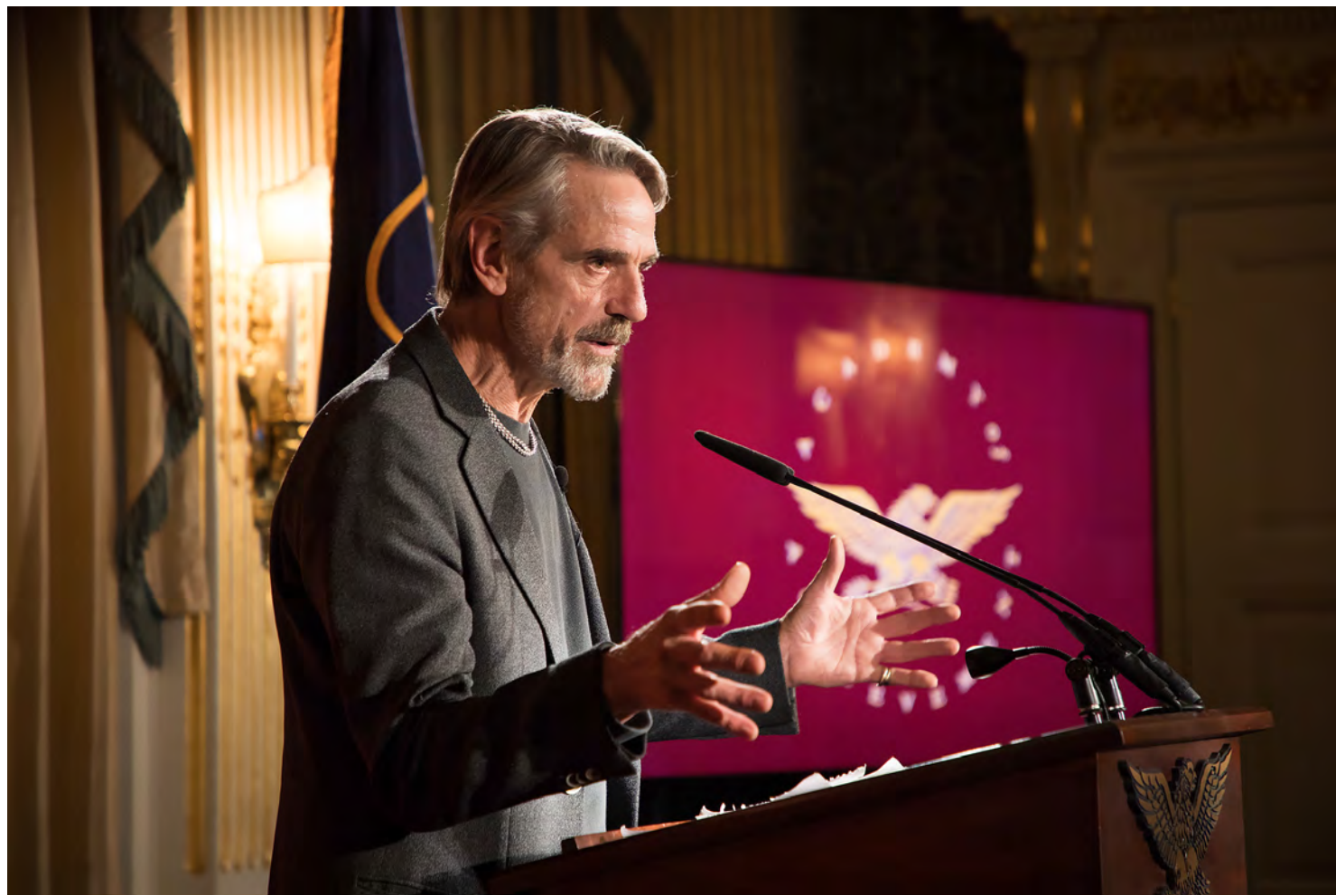
Jeremy Irons, Academy Awards Council member and English stage and screen actor, addresses Summit delegates.