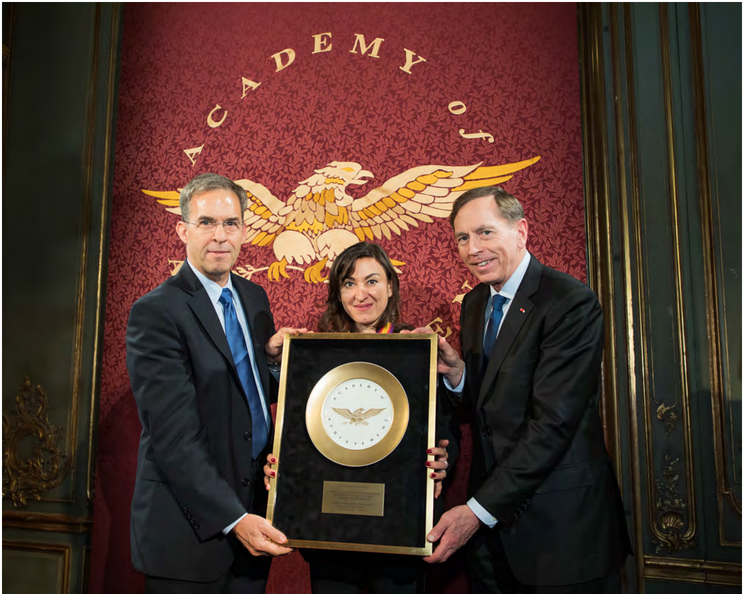
Awards Council members Rick Atkinson, Pulitzer Prize-winning historian and journalist, and General David H. Petraeus, USA, former Director of the CIA, present the Academy of Achievement's Golden Plate Award to Pulitzer Prize-winning photojournalist Lynsey Addario following her presentation at iconic Cliveden House in Berkshire.