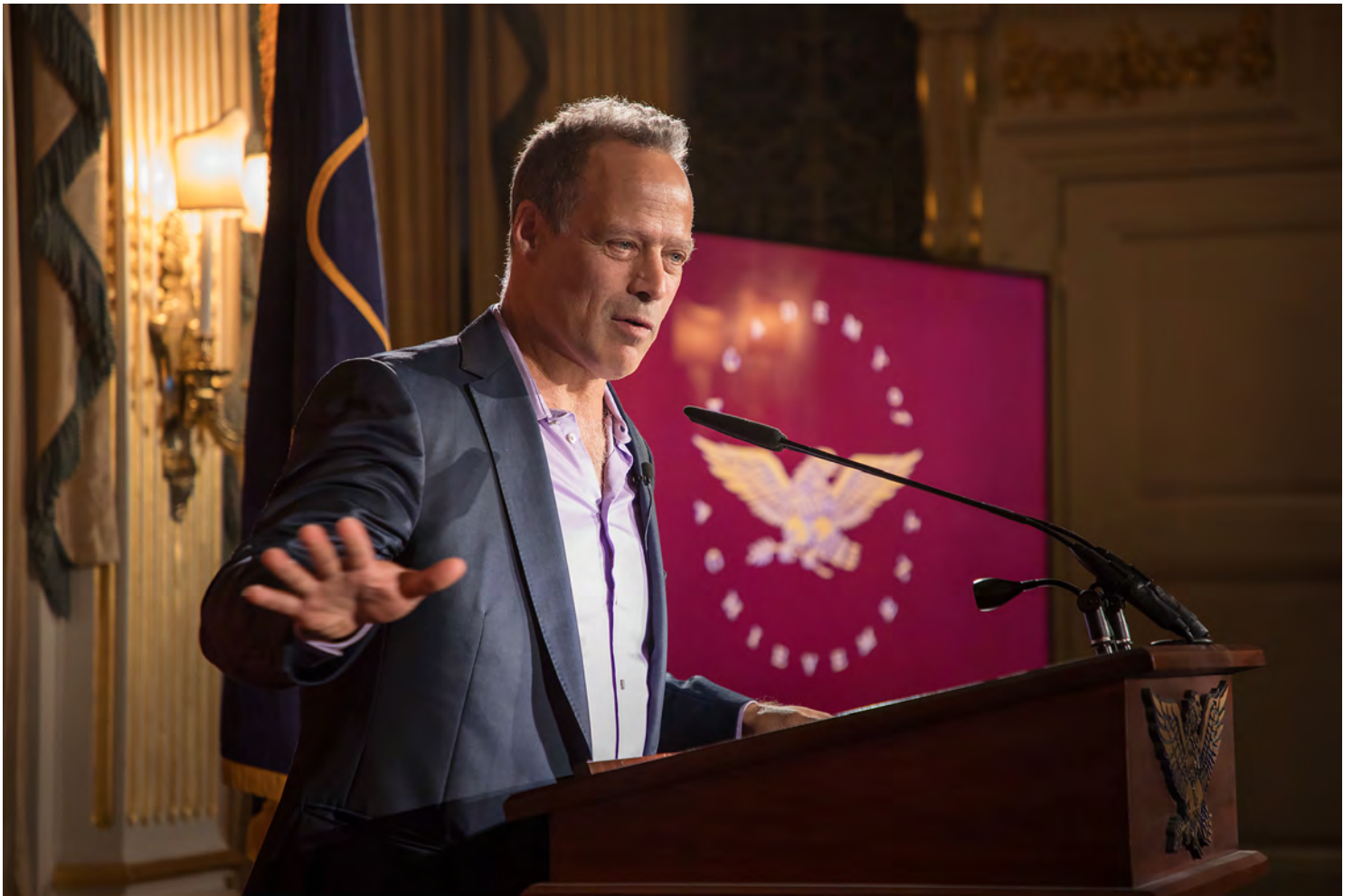
2017 honoree Sebastian Junger, journalist and filmmaker, addresses Academy delegates at Claridge's in London.

Academy members and delegates had enjoyed hearing briefly from acclaimed stage and motion picture actor Jeremy Irons on the first evening of the Summit. On Wednesday afternoon Irons gave a charming impromptu talk, discussing the path that led him to discover his life's passion, along with the challenges and rewards of an actor's life.