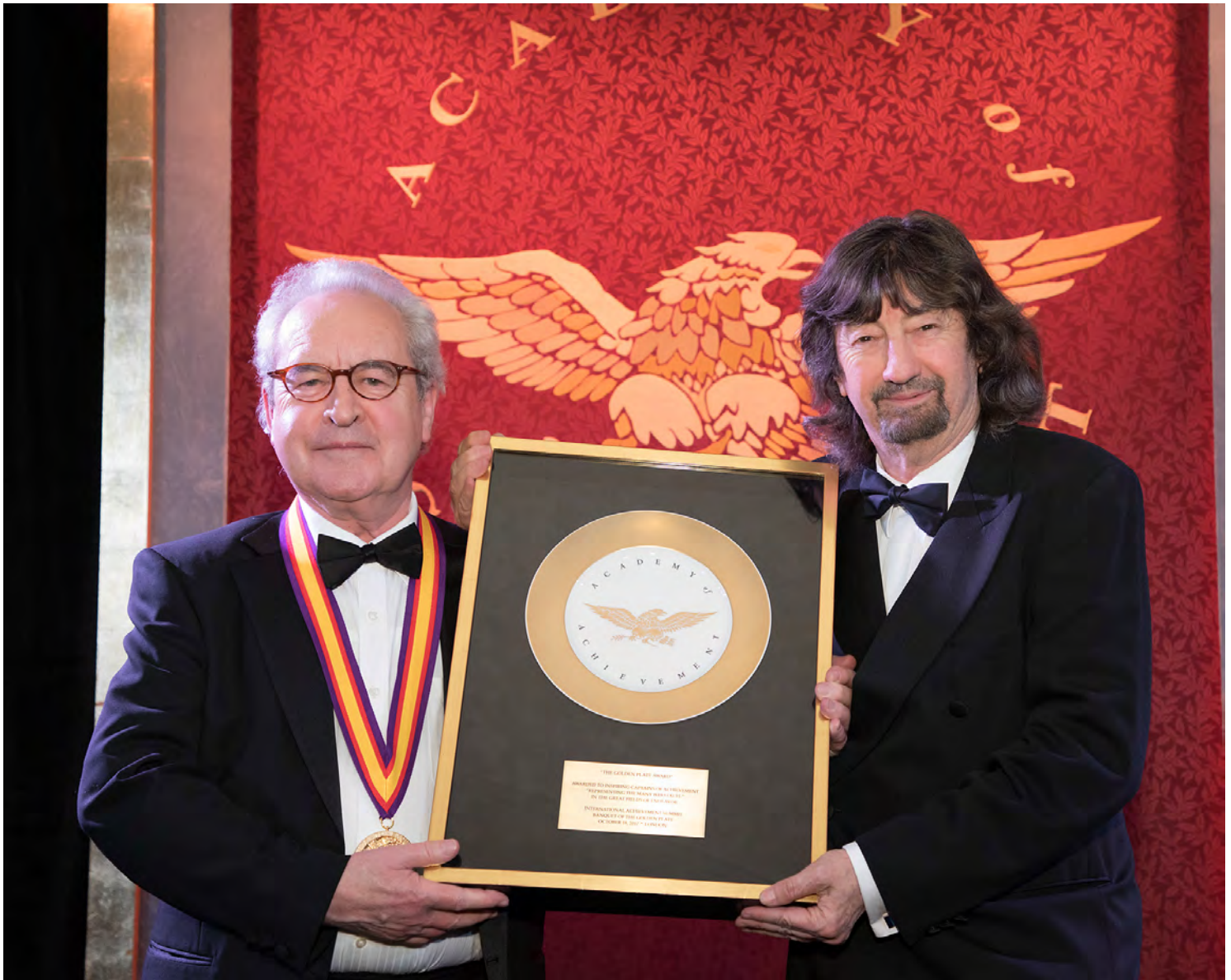
Academy Awards Council member and Artistic Director of the Royal Shakespeare Company, Sir Trevor Nunn, presents the Academy of Achievement's Golden Plate Award to critically-acclaimed Irish novelist John Banville.

The world of sport was represented by Sir Roger Bannister — whose breaking of the four-minute mile was ranked by Sports Illustrated as the greatest sporting achievement of the 20th century — and by America's most decorated gymnast, four-time Olympic gold medalist Simone Biles .