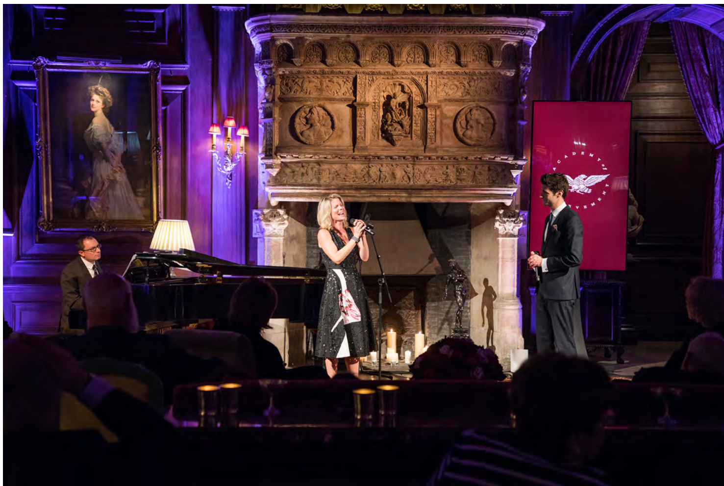
Tony Award-winning soprano Kelli O'Hara performs songs from the Rodgers and Hammerstein Broadway musicals The King and I and South Pacific by the portrait of Nancy Astor by John Singer Sargent in the Great Hall at Cliveden.

For four days in London and the English countryside, exceptional men and women of many backgrounds, different nations, different generations, diverse philosophies and divergent strains of belief had celebrated our common humanity by exchanging ideas in a civilized atmosphere, without competition, envy or rancor. As Academy members return to their vocations, and the Academy's young delegates discover their own, we hope they will carry the same generous, open-minded spirit wherever they go.