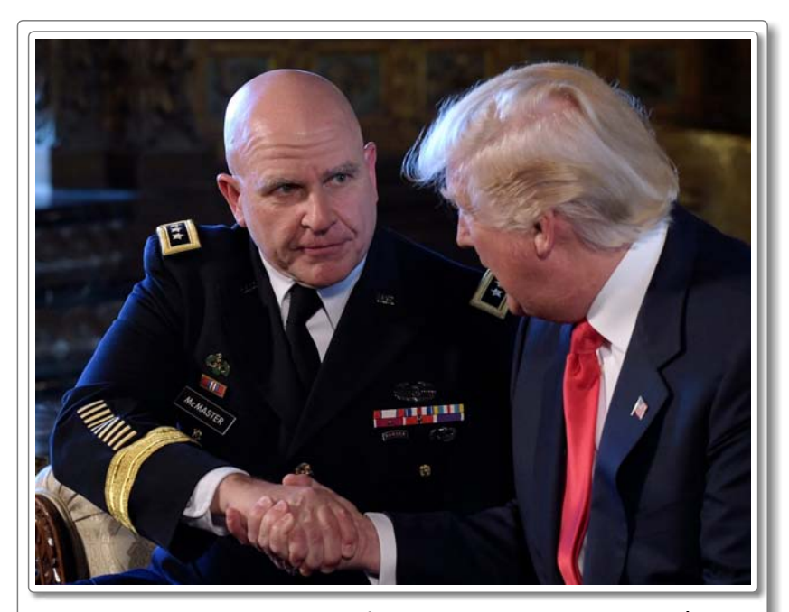
FIG. 1 — GLOBALIST GENERAL H.R. MCMASTER & PRESIDENT DONALD TRUMP AT MCMASTER'S APPOINTMENT AS NATIONAL SECURITY ADVISOR. McMaster is a disciple of George Soros and the Deep State shadow government. He despises President Trump's America First priority. The Deep State shadow government has a hard stop requirement for the President to renew Executive Order No. 13708 by Sep. 30, 2017. This executive order perpetuates a string of executive orders that have authorized the warrantless surveillance of Americans since 9/11 and the passage of the Patriot Act. These orders have sacrificed fundamental civil liberties and established the NSA / C.I.A. surveillance state.

CONTRIBUTING WRITERS | OPINION | AMERICANS FOR INNOVATION | SEP. 14, 2017, UPDATED OCT. 03, 2017 | PDF | https://tinyurl.com/yeurv294