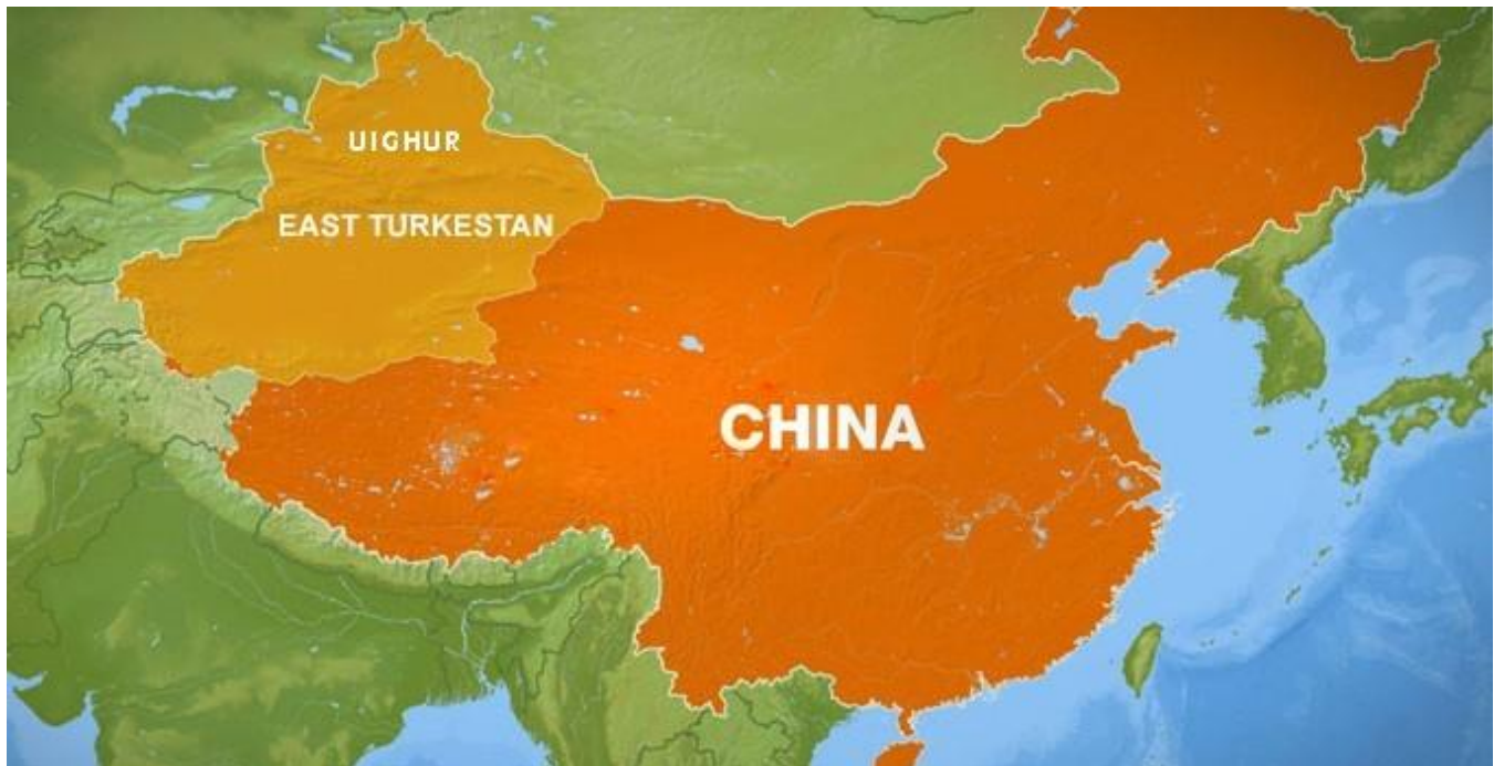
Location of East Turkistan

Although much of the aspects of Uyghur language and culture is moderately Turkic in origin, there are elements of Persian culture and language that coincide making up the unique hybrid Uyghur culture. The language of the Uyghurs is also called Uyghur, deriving from Eastern Turkic or Chagatai Turkic . It is one of the oldest Turkic languages in use today. The Uyghurs in East Turkistan use the Arabic script for writing, whereas the majority of the Uyghurs in Central Asia use the Cyrillic alphabet system of writing, and Uyghur diaspora communities use both the Arabic script and Latin script interchangeably. It should also be noted that the traditional Uyghur script was adopted by Genghis Khan in the 13th Century and has been used by Mongols since then.