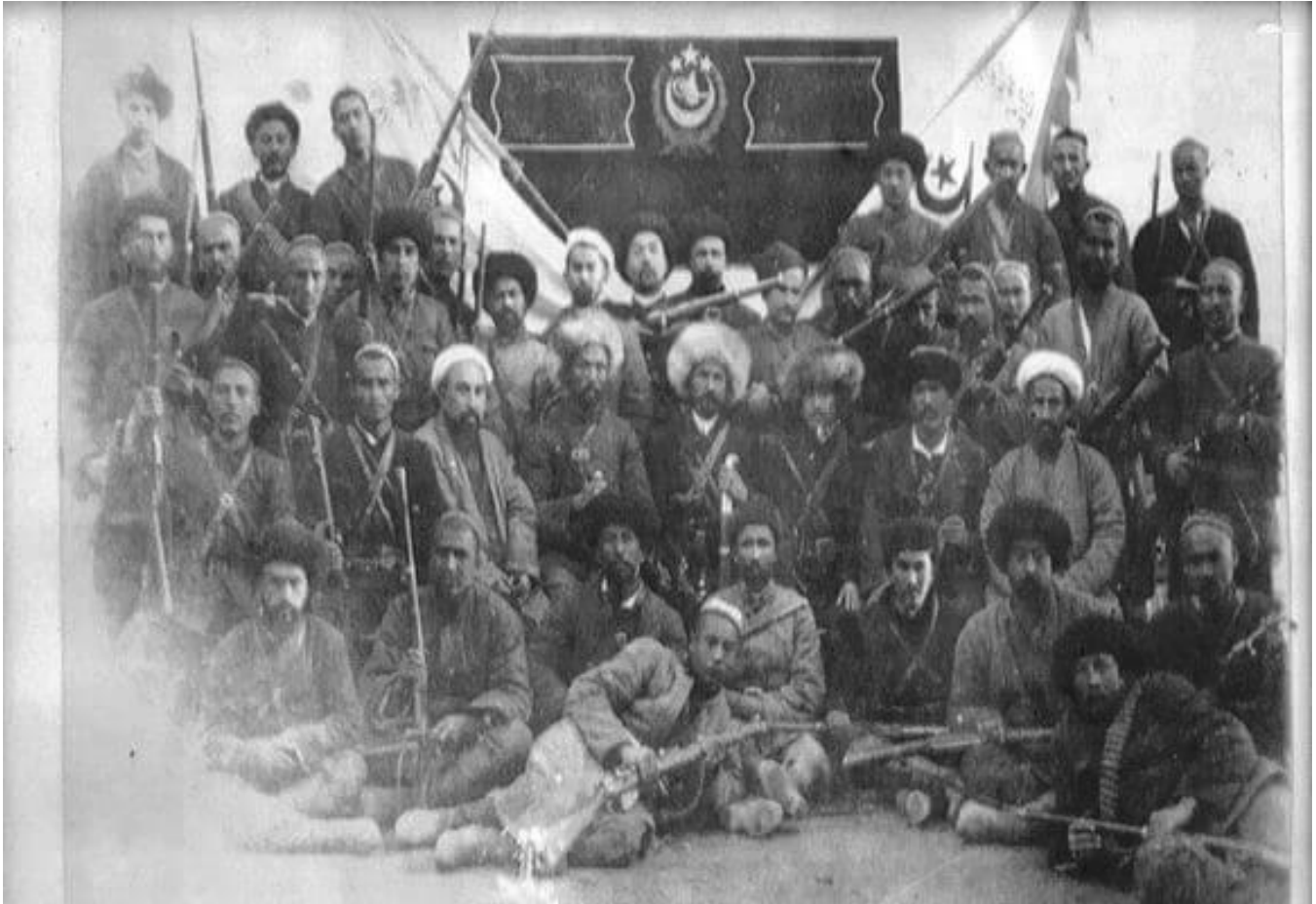
Uyghur freedom fighters (Revolutionaries), 1933 – upon establishing the Turkish Islamic Republic of East Turkistan

Although the ETR received some international recognition, it became the victim of secret negotiations between the US and the Soviet Union and was betrayed at the Yalta Conference of 1945. Stalin would use the KGB to infiltrate the ETR leadership and, in August 1949, the senior leaders of the ETR including the President, Defense Minister, and Foreign Secretary were executed on the orders of Stalin for refusing to sign away the independence of the Uyghur nation. By September, 1949 Stalin would be airlifting Mao's troops into East Turkistan and dismantling the ETR, leaving the Uyghurs under Chinese Communist occupation. The ETR was officially dismantled on November 20, 1949 ending Uyghur independence and officially making their homeland a Chinese colony, leading to the subjugation of the Uyghur people that continues to this day.