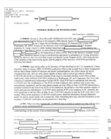
Hillary R. Clinton Part 02 of 03