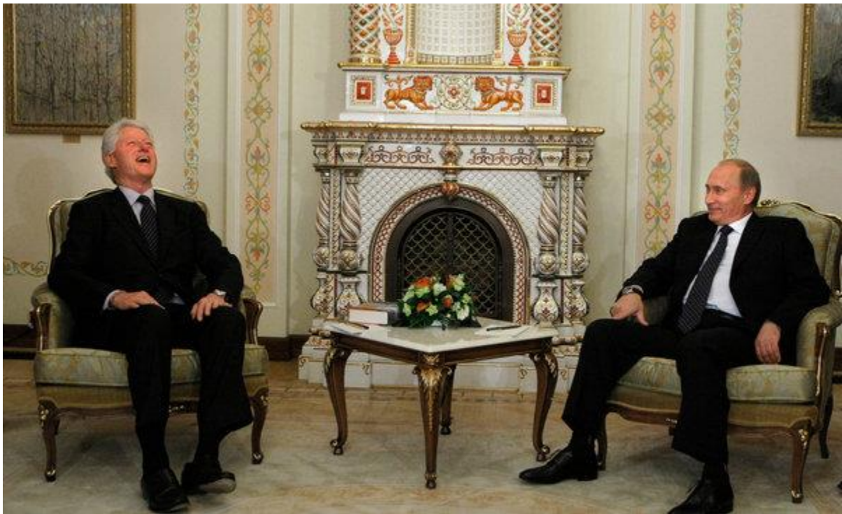
Bill Clinton met with Vladimir V. Putin in Moscow in 2010.