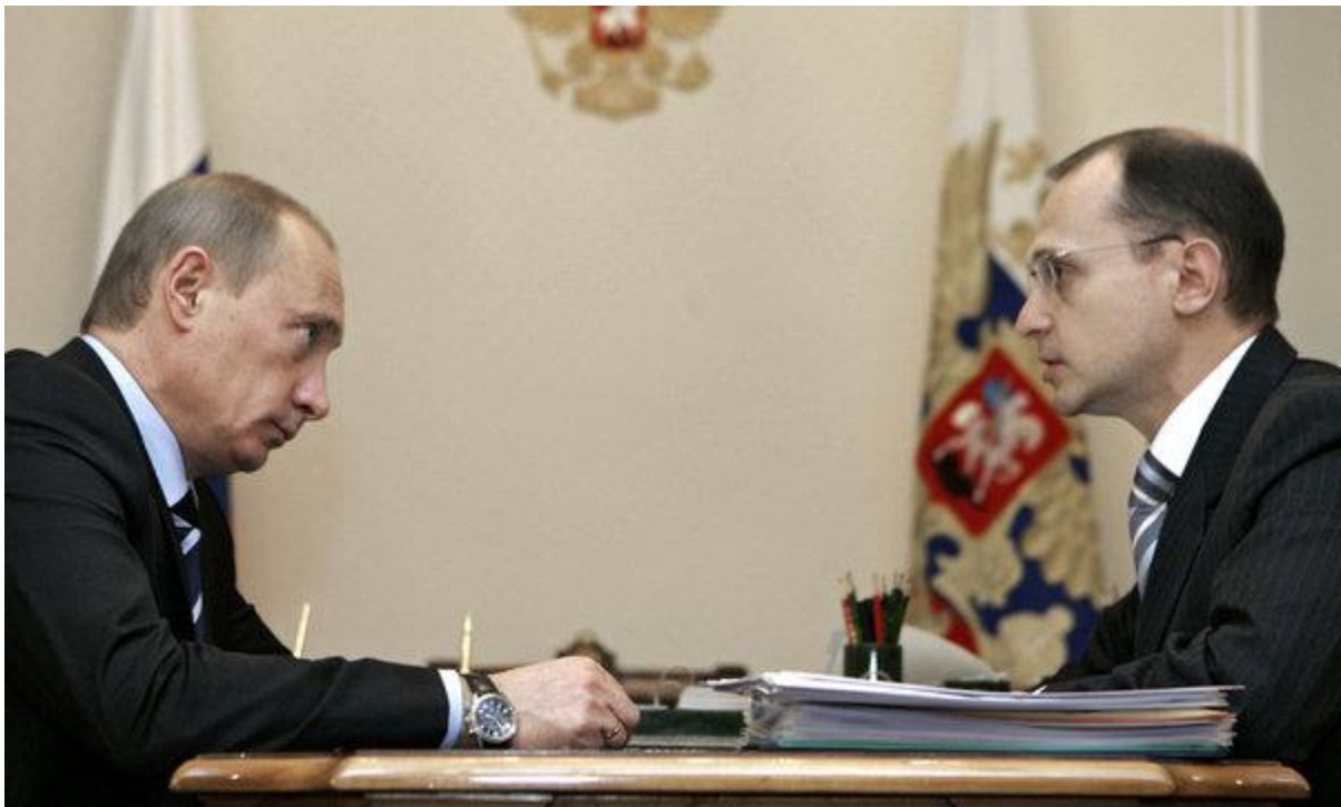
President Putin during a meeting with Rosatom's chief executive, Sergei Kiriyenko, in December 2007.

When ARMZ, an arm of Rosatom, took its first 17 percent stake in Uranium One in 2009, the two parties signed an agreement, found in securities filings, to seek the foreign investment committee's review. But it was the 2010 deal, giving the Russians a controlling 51 percent stake, that set off alarm bells. Four members of the House of Representatives signed a letter expressing concern. Two more began pushing legislation to kill the deal.