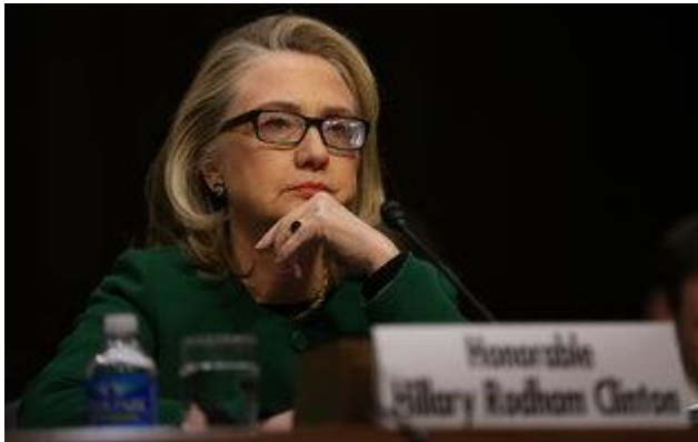
Uranium One's Russian takeover was approved by the United States while Hillary Rodham Clinton was secretary of state.

Before Mrs. Clinton could assume her post as secretary of state, the White House demanded that she sign a memorandum of understanding placing limits on the activities of her husband's foundation. To avoid the perception of