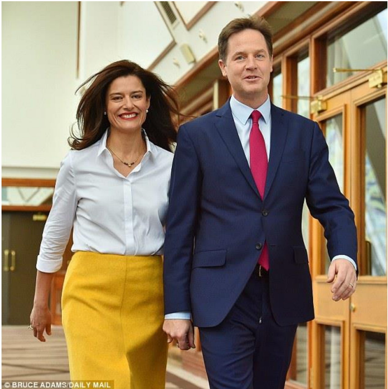
Ms Budberg was great, great grand aunt of Deputy Prime Minister Nick Clegg, right

https://www.dailymail.co.uk/news/article-2908987/Was-Nick-Clegg-s-aunt-Soviet-Spy-enigmatic-Russian-baroness-cut-swathe-London-s-best-connected-men-secret-MI5-files-pose-question.html