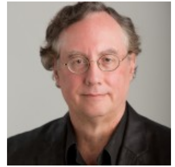
Reactions: Juan Cole on the Vulnerability of the Network

All of that is necessary, but not sufficient. The Snowden revelations (the impact of which have been surprisingly strong), the derailed drive for military intervention in Syria and a fractious Congress, whose dysfunction has begun to be a serious inconvenience to the Deep State, show that there is now a deep but as yet inchoate hunger for change. What America lacks is a figure with the serene self-confidence to tell us that the twin idols of national security and corporate power are outworn dogmas that have nothing more to offer us. Thus disenthralled, the people themselves will unravel the Deep State with surprising speed.