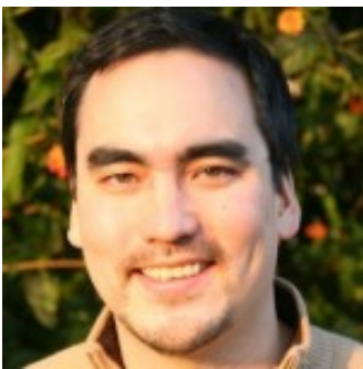
Reactions: Tim Wu on Silicon Valley

The House vote to defund the NSA's illegal surveillance programs was equally illustrative of the disruptive nature of the tea party insurgency. Civil liberties Democrats alone would never have come so close to victory; tea party stalwart Justin Amash (R-MI), who has also upset the business community for his debt-limit fundamentalism, was the lead Republican sponsor of the NSA amendment, and most of the Republicans who voted with him were aligned with the tea party.