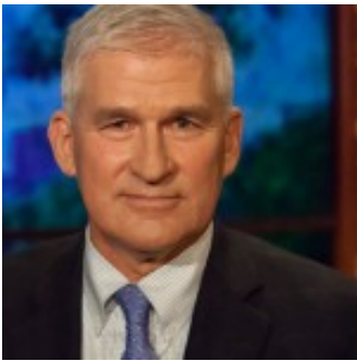
Reactions: Andrew Bacevich on Washington's Tacit Consensus

How did I come to write an analysis of the Deep State, and why am I equipped to write it? As a congressional staff member for 28 years specializing in national security and possessing a top secret security clearance, I was at least on the fringes of the world I am describing, if neither totally in it by virtue of full membership nor of it by psychological disposition. But, like virtually every employed person, I became, to some extent, assimilated into the culture of the institution I worked for, and only by slow degrees, starting before the invasion of Iraq, did I begin fundamentally to question the reasons of state that motivate the people who are, to quote George W. Bush, "the deciders."