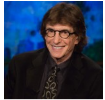
Reactions: Henry Giroux on Resisting the Neoliberal Revolution

But, there are signs of resistance to the Deep State and its demands. In the aftermath of the Snowden revelations, the House narrowly failed to pass an amendment that would have defunded the NSA's warrantless collection of data from US persons. Shortly thereafter, the president, advocating yet another military intervention in the Middle East, this time in Syria, met with such overwhelming congressional skepticism that he changed the subject by grasping at a diplomatic lifeline thrown to him by Vladimir Putin. [7]