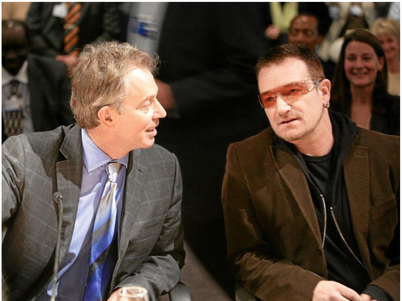
Wanted war criminal Tony Blair.