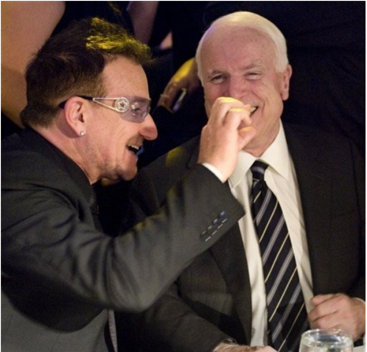
War mongering senator John McCain.