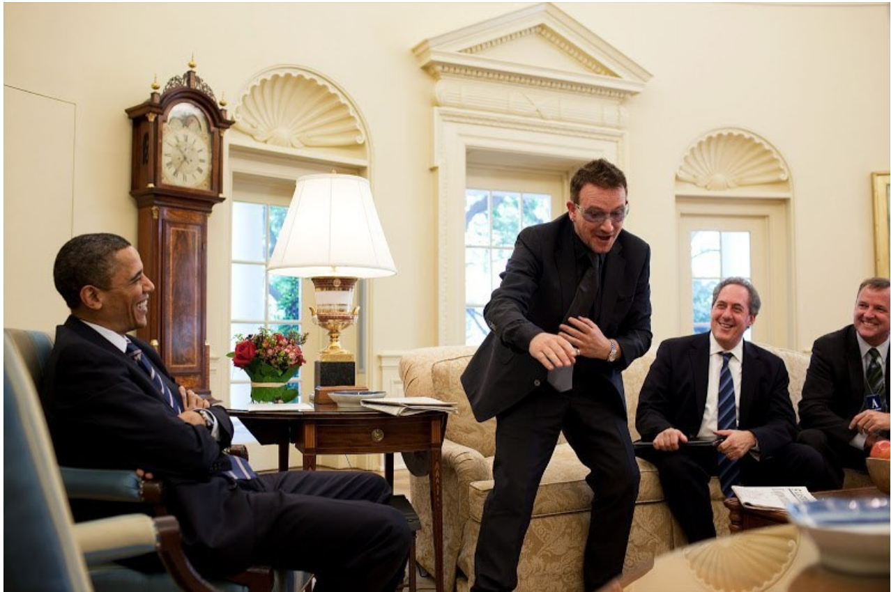
Obama...the teleprompter reading president who bombs kids for a living and gets a peace prize.