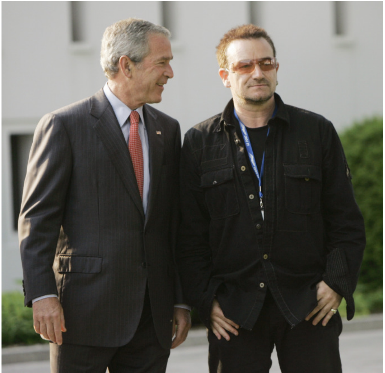
Wanted war criminal George W. Bush Jnr.