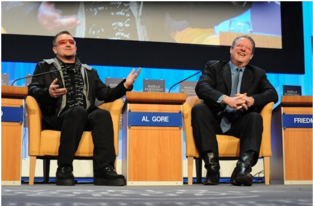
The inconvenient lie that is Al Gore.