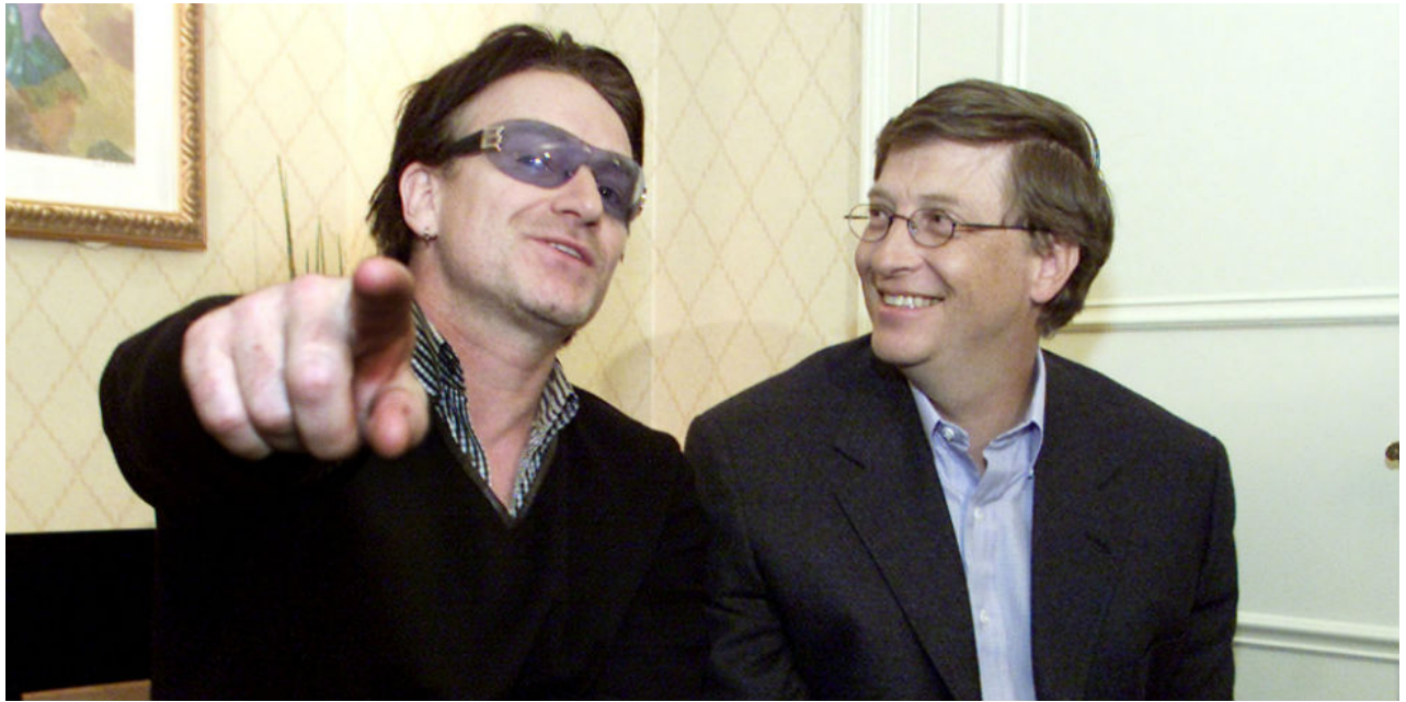
Mr Eugenics himself Bill Gates.