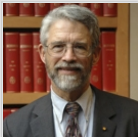
John P. Holdren

Director of the Office of Science and Technology Policy