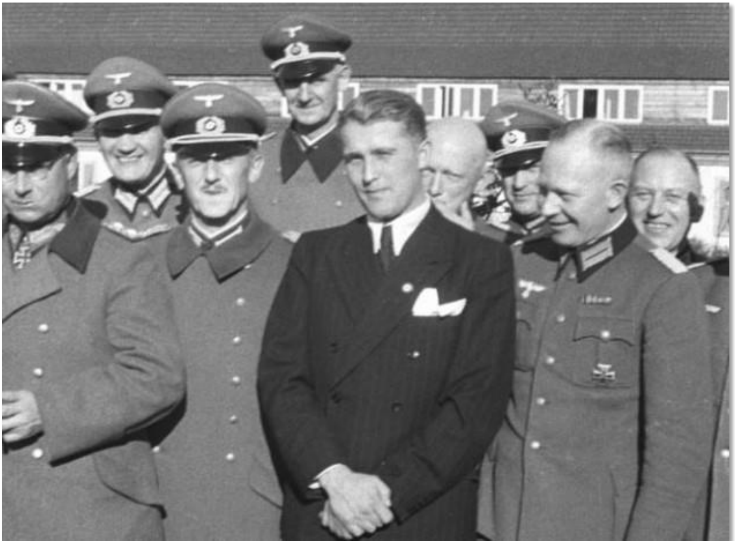
Fig. 1: Nazi rocket scientist Wernher von Braun (center, dressed in civilian clothes) with other Nazi scientists recruited by the C.I.A. ca. 1945 in Operation Paperclip.