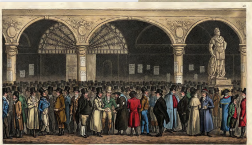
Tom & Jerry visitant la Bourse.

THE PLAN shows the Order of the several Halls usually frequented by the diffe- rent Merchants their Factors from all Parts and is about 100 feet long & 60 feet broad in which more Business is transacted than in any other Place of its Company in the known World. The Advantages to Trade with the Ameri- cans which benefit this Royal Office are too numerous to be dis- cuss'd in this Place. Traffic is carried on here from a little every Day in the Year except Sundays and some few Holidays.