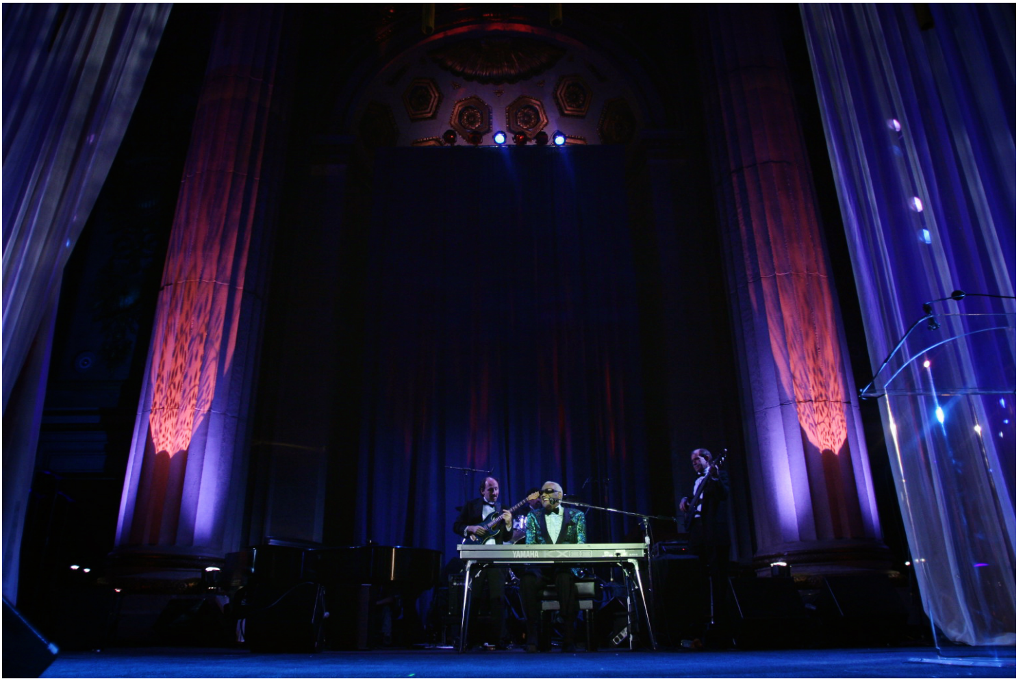
Ray Charles performs “Georgia on My Mind” during the Banquet of the Golden Plate gala at the Mellon Auditorium.

Mr. Clinton spoke of the responsibility the students must now assume as the next generation of world leaders. He cautioned them against being discouraged by the daily tumult of history in the making. “Never mind the headlines,” he told them, “watch the trend lines.” The trend lines are good, he said, in a world where more people live in freedom than at any time in history. After his brief message, he introduced an old hero of his, one of America’s master musicians, Ray Charles. Mr. Charles gave a performance of remarkable depth, giving new life to classics such as “Route 66” and “Georgia on My Mind.”