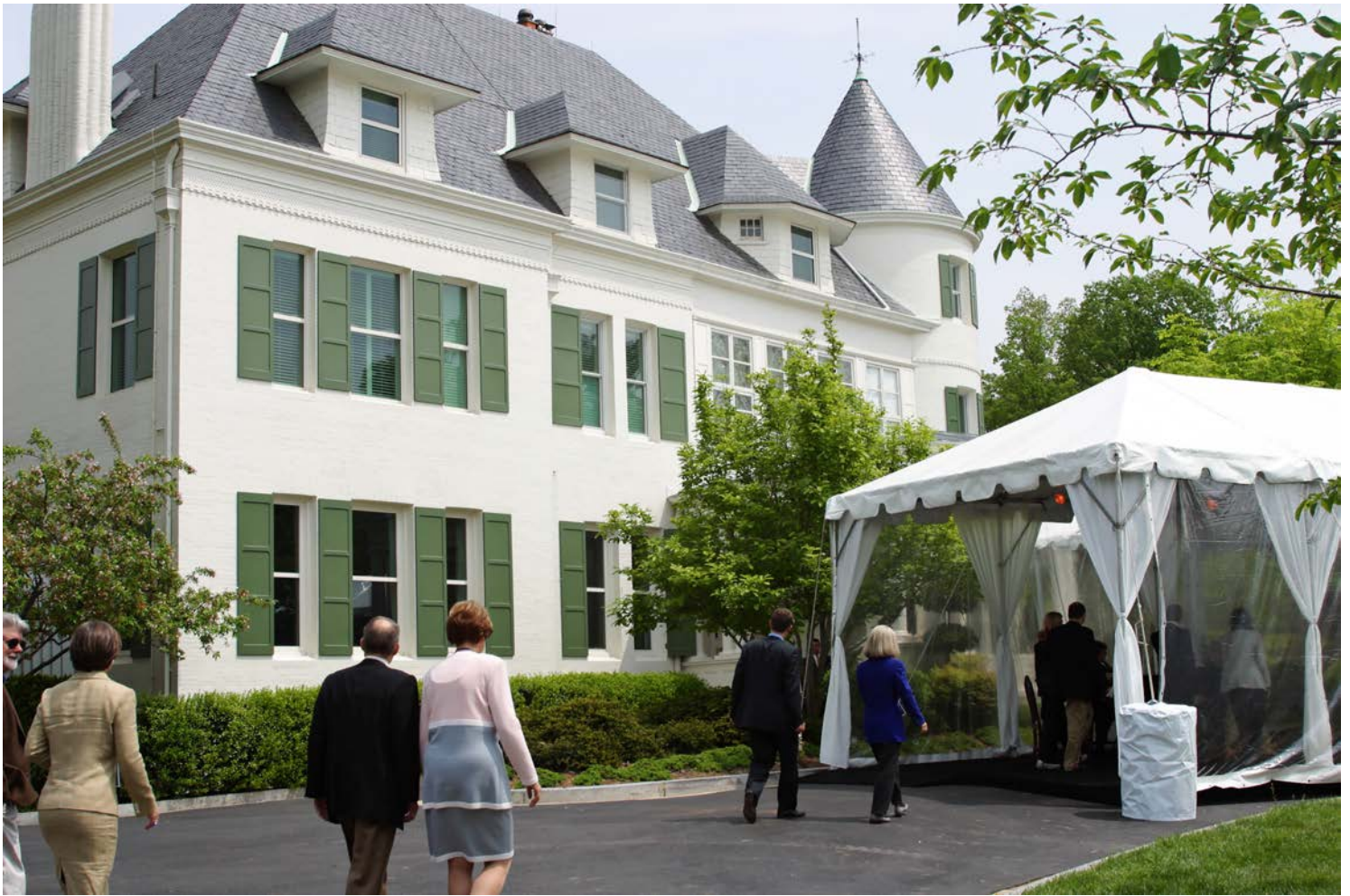
Academy members and delegates gather for a luncheon and symposium hosted by Dr. Lynne V. Cheney, wife of Vice President Dick Cheney, at Number One Observatory Circle, the official residence of the U.S. Vice President.

The entire assembly then traveled by motorcade for the rare privilege of luncheon at the historic Naval Observatory, the official residence of the Vice President of the United States. The gracious hostess of this luncheon was the wife of Vice President Richard Cheney, the distinguished author and commentator Lynne V. Cheney. The hospitality of the Vice President and Mrs. Cheney to the Academy was especially remarkable given the heightened security environment of Washington in wartime.