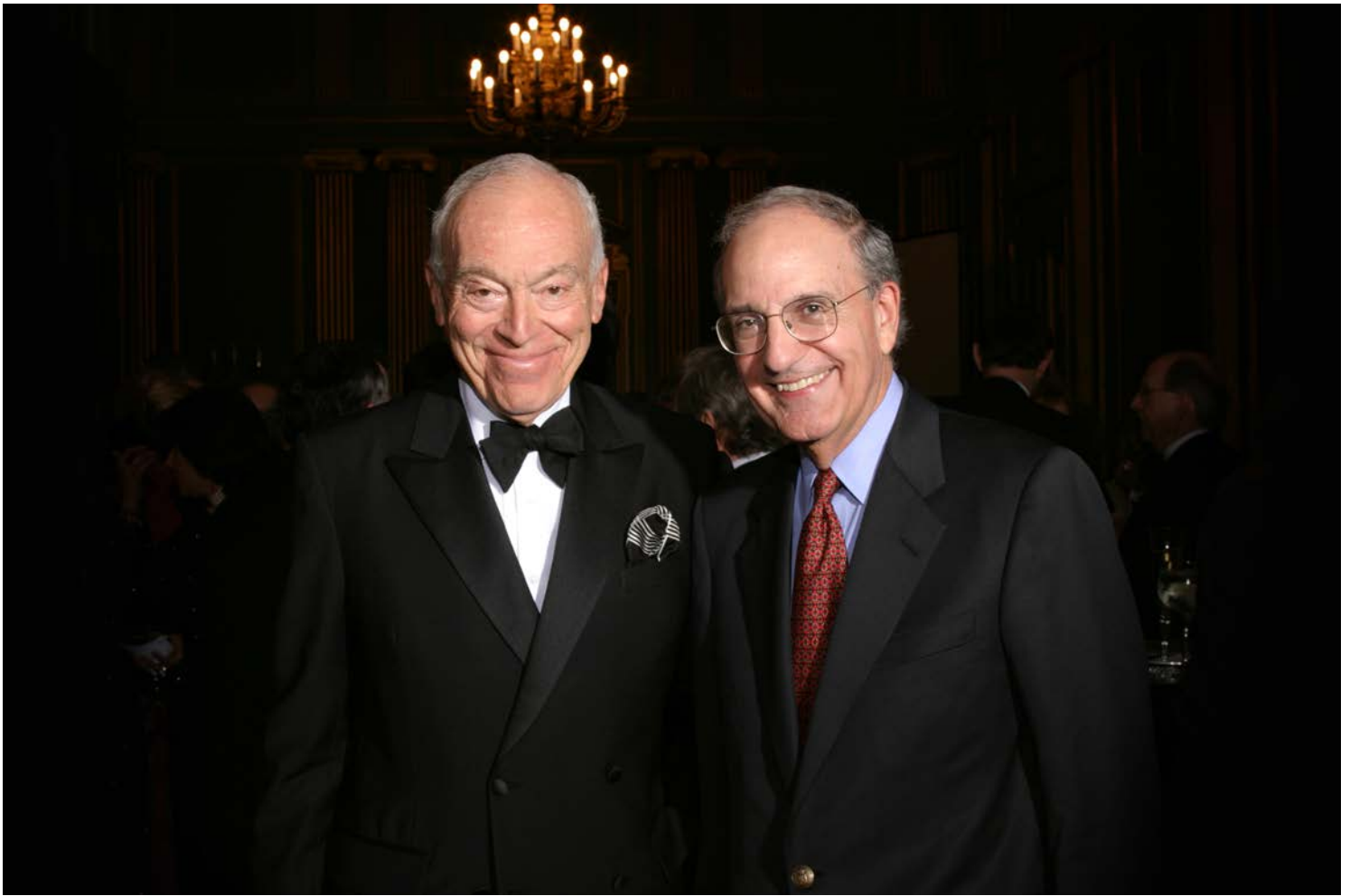
Members of the American Academy of Achievement, philanthropist and entrepreneur Leonard A. Lauder, and the former Majority Leader of the U.S. Senate, the Honorable George J. Mitchell, at the Banquet of the Golden Plate.