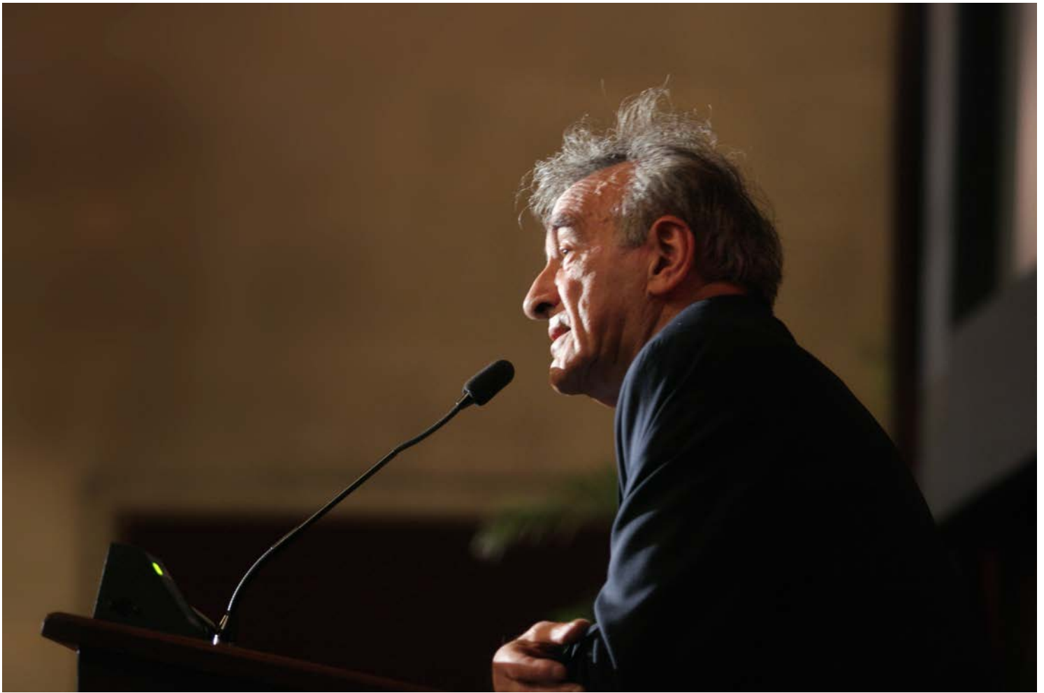
Elie Wiesel, the recipient of the Nobel Prize for Peace, addressing the delegates and members at the 2003 Summit.