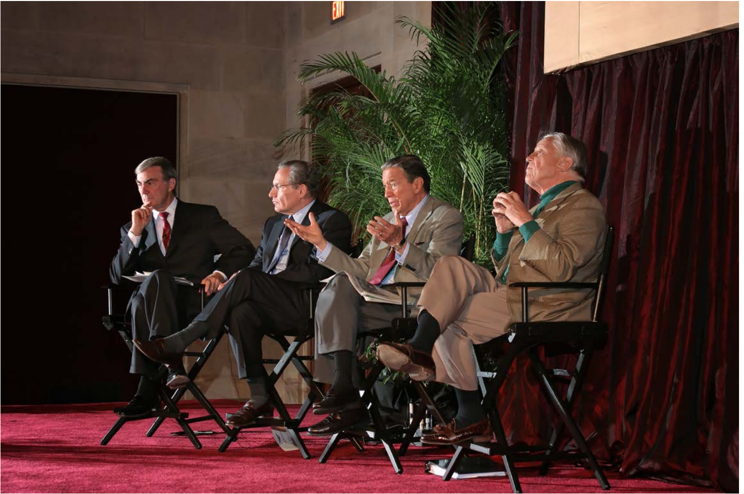
ABC News correspondent Sam Donaldson, investigative reporter Bob Woodward, CBS News correspondent Mike Wallace and longtime Washington Post editor Ben Bradlee in a panel discussing the influence of the news media.

After this presentation, students were treated to an elegant dinner in the Great Hall of the Supreme Court and a captivating performance by the acclaimed American soprano Kathleen Battle. On their way back to their hotel, students stopped for a moonlight visit to the Lincoln Memorial. There they gathered to hear the Pulitzer Prize-winning novelist Herman Wouk, who urged them to look past the marble colossus seated above them and see Lincoln the man. “This was a guy,” Wouk said, “one man, born with no advantages, who rose to lead his country and saved it from dissolution.” After these moving words from a great author of the World War II generation, students took the few short steps to the hallowed ground where Americans honor the fallen of another war, at the Vietnam Veterans’ Memorial Wall. At the entrance to the memorial, they heard a passionate address by Neil Sheehan, the Pulitzer Prize-winning chronicler of that conflict.