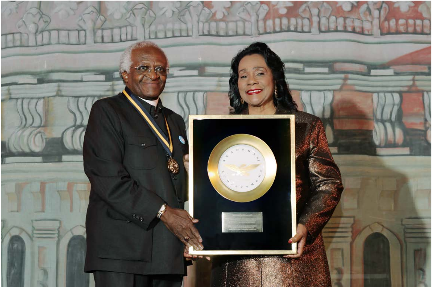
South Africa's Archbishop Desmond Tutu receives the Academy of Achievement's Golden Plate Award from Coretta Scott King at the Banquet gala ceremonies during the 2003 International Achievement Summit in Washington, D.C.