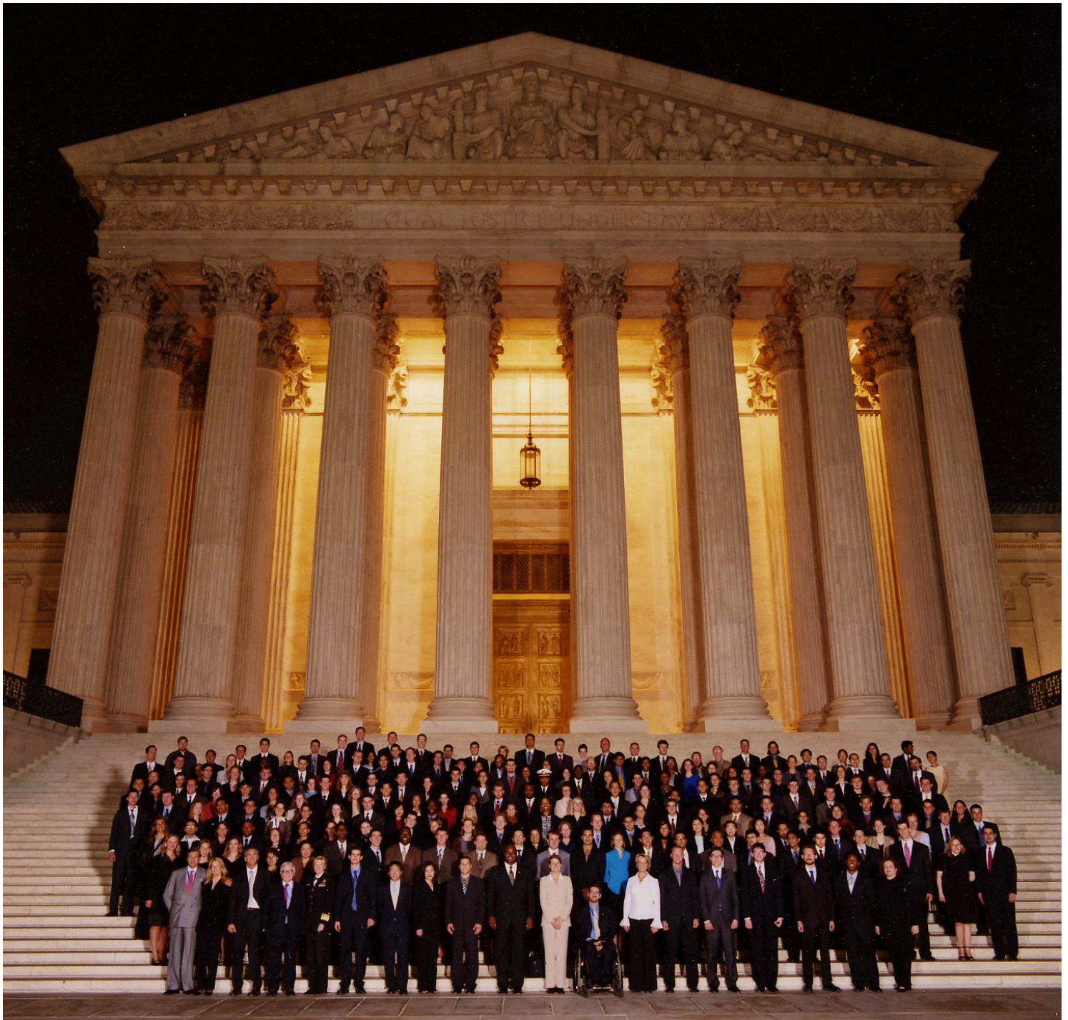
International student delegates of the American Academy of Achievement at the United States Supreme Court after a dinner hosted by Awards Council members Justice Sandra Day O'Connor and Justice Ruth Bader Ginsburg.

From April 30 to May 4, 2003, more than 220 outstanding graduate students from 44 countries gathered in Washington, D.C. to join the world's leaders in public affairs, business, science and the arts at the 42nd annual International Achievement Summit.