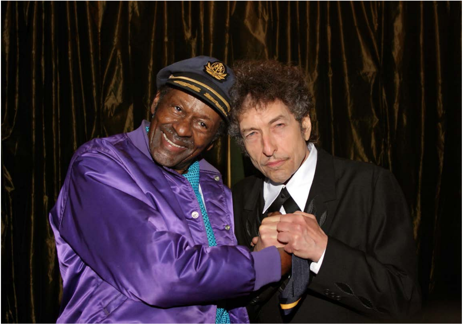
Chuck Berry and 2003 guest of honor Bob Dylan at the Banquet of the Golden Plate Award at Mellon Auditorium.

On that extraordinary tableau, and with the sounds of classic American rhythm and blues ringing in their ears, Academy members, guests, and international honor students departed, carrying unforgettable memories of their visit to Washington. Many will return before long as leaders in public service and representatives of their respective countries, but all will proceed with renewed inspiration, having seen and heard firsthand that in every walk of life, one individual can make a difference.