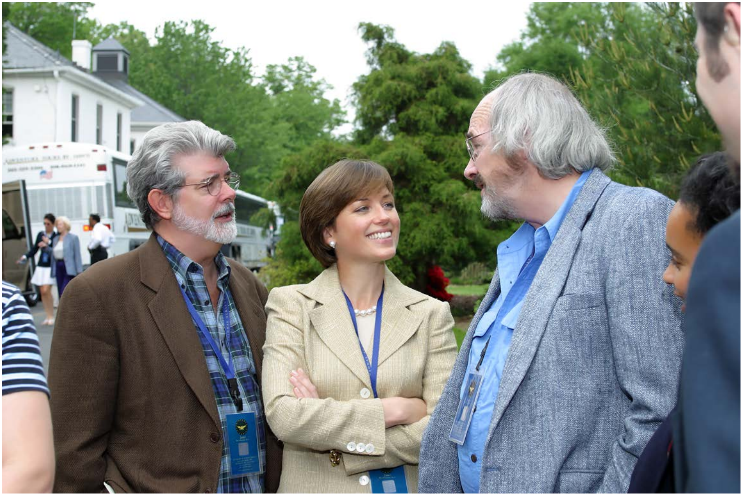
Filmmaker George Lucas, Olympic figure skater Dorothy Hamill, and paleontologist Jack Horner outside the Vice President's Residence in Washington, D.C. for a luncheon and symposium during the 2003 Achievement Summit.

They were joined in a discussion of “The New World Order” with the former President of Lithuania, Valdas Adamkus, and the New York Times foreign affairs columnist Thomas Friedman, recipient of three Pulitzer Prizes. The afternoon's proceedings ended with the induction of President Uribe into the Academy of Achievement.