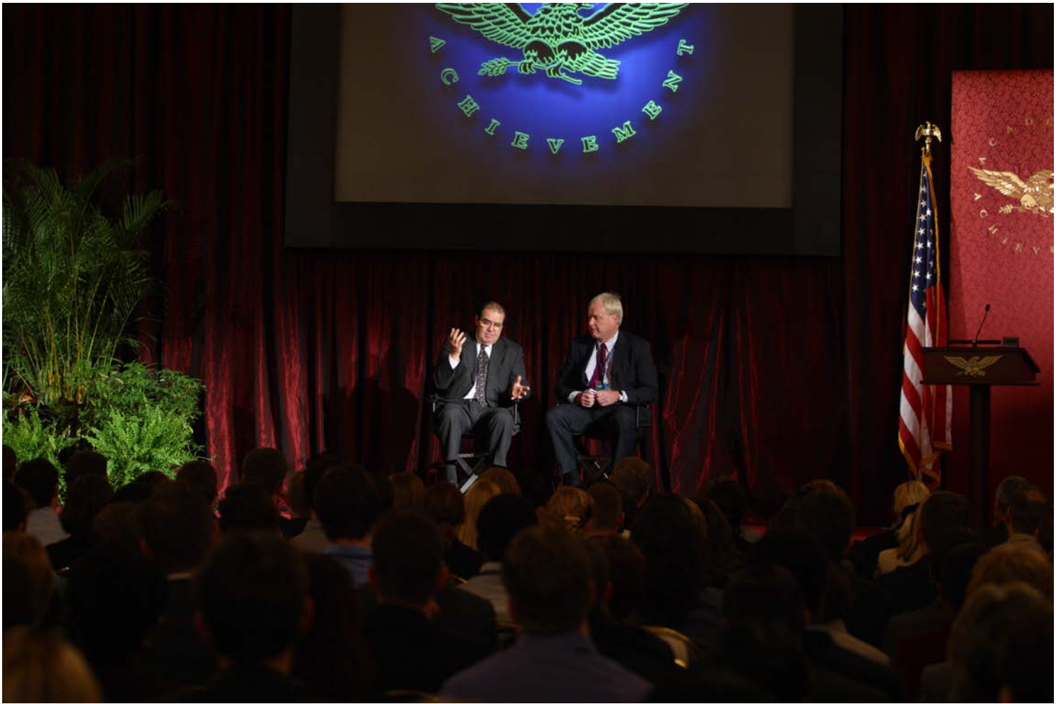
Associate Justice of the Supreme Court of the United States and Academy of Achievement honoree Antonin Scalia in a discussion with the delegates and members, moderated by political commentator and author Chris Matthews.

The assembly heard from award-winning documentary filmmaker Ken Burns, conservation scientist Thomas Lovejoy (creator of the television series Nature ), and from the former Prime Minister of Israel, His Excellency Ehud Barak.