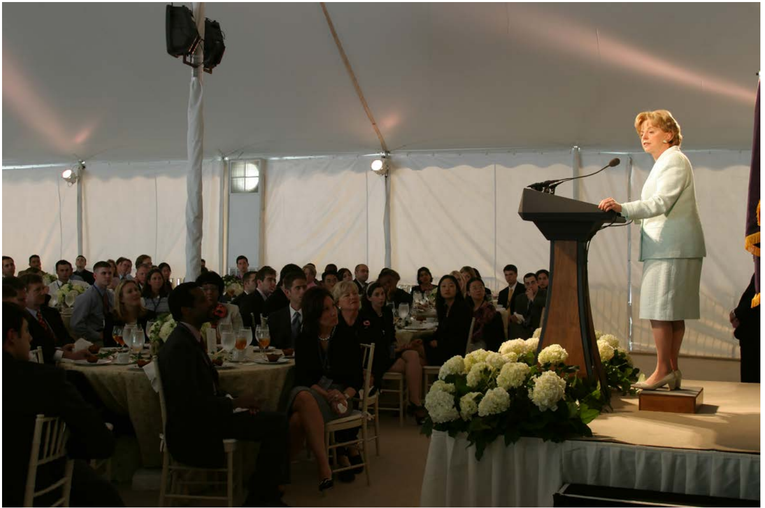
Dr. Lynne V. Cheney, second lady of the United States, welcomed the Academy assemblage to the official residence of the Vice President of the United States, Number One Observatory Circle, during the 2003 Achievement Summit.

The afternoon's session resumed with individual presentations by the President of Colombia, His Excellency Alvaro Uribe Velez, and by two recipients of the Nobel Prize for Peace, author and human rights activist Elie Wiesel, and His Excellency Shimon Peres, the former Prime Minister of Israel.