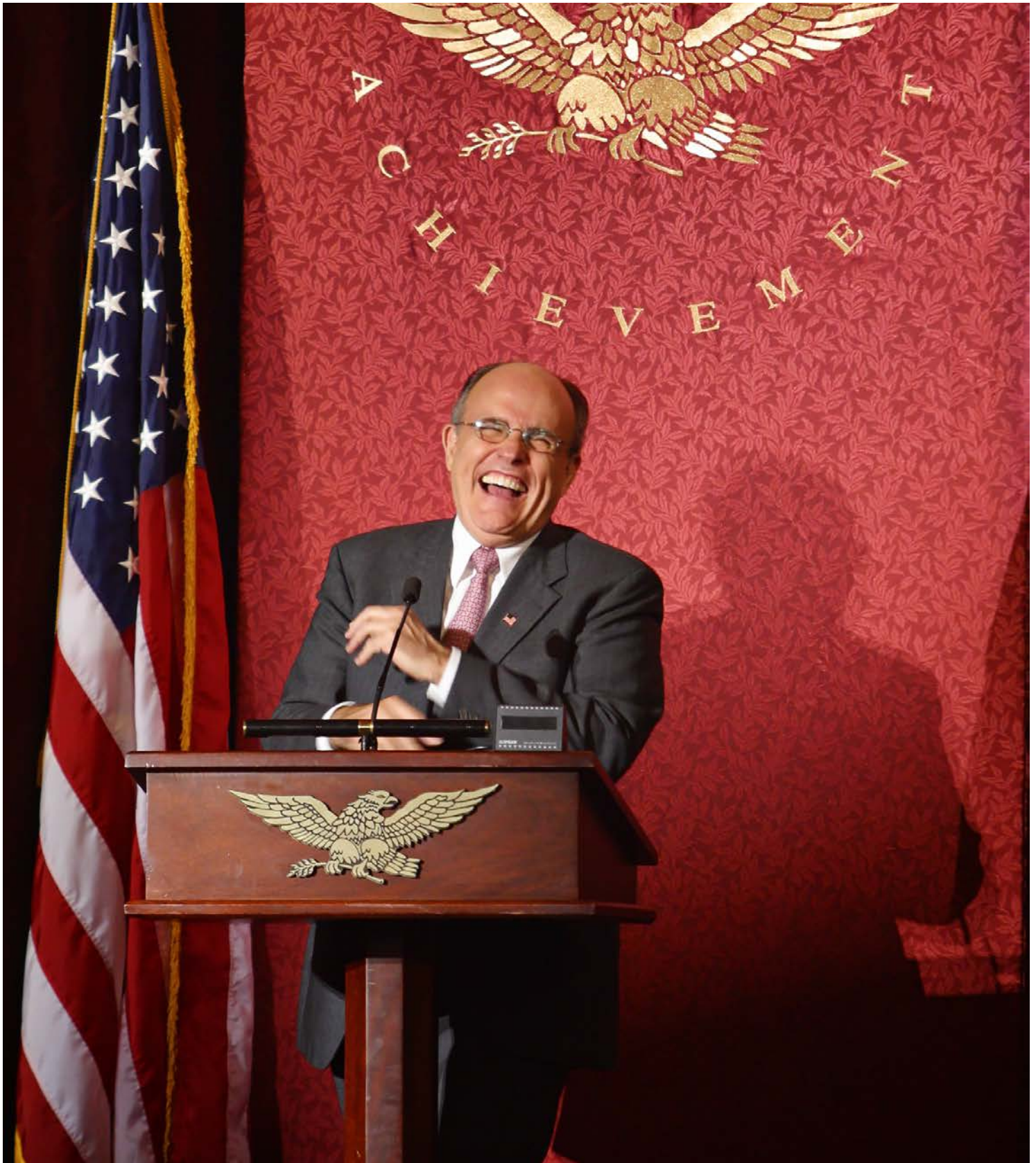
The Honorable Rudolph Giuliani enjoys his discussion with students at the International Achievement Summit.

In the last afternoon session of the Summit, students, Academy members and guests heard from the renowned author and pioneer of integrative medicine, Dr. Andrew Weil; from the Chairman of Fannie Mae, America's largest provider of home financing, the Honorable Franklin Raines; and from the former Mayor of New York City,