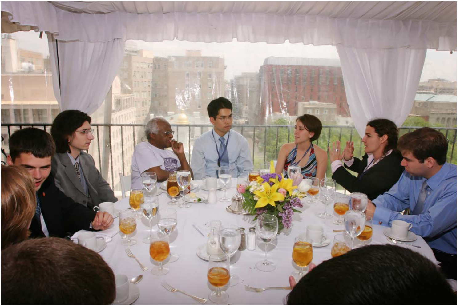
Academy of Achievement honoree Archbishop Desmond Tutu, the recipient of the Nobel Prize for Peace, joins Academy student delegates for an informal lunch at the International Achievement Summit in Washington, D.C.

Chris Matthews returned to moderate a discussion, “Prospects for Peace,” with former Prime Minister Barak, joined by former U.S. Senator George J. Mitchell. The morning session concluded with a question-and-answer session with the Chairman of the Joint Chiefs of Staff, General Richard B. Myers.