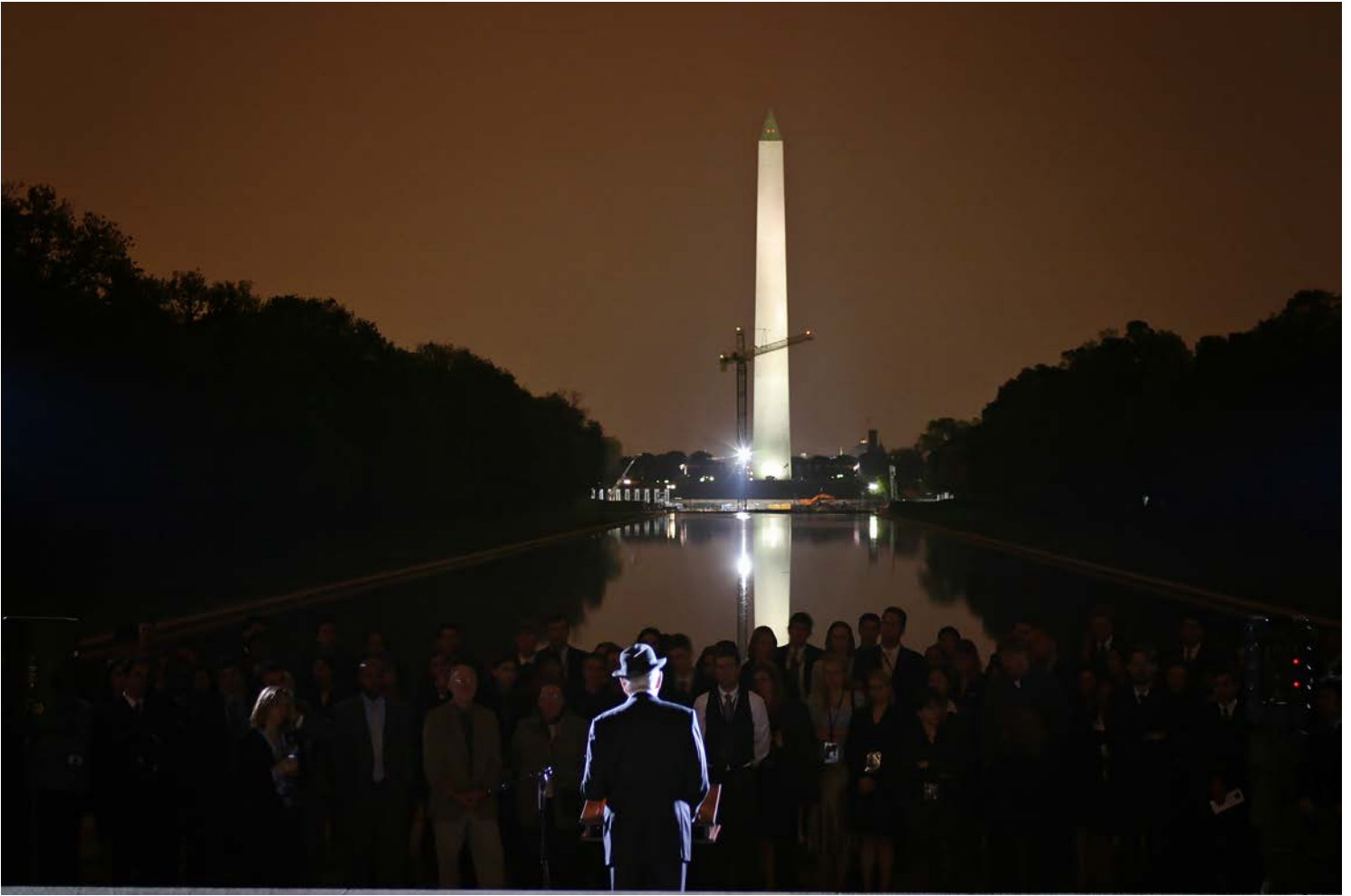
Herman Wouk, the Pulitzer Prize-winning author of the bestselling novels The Caine Mutiny and The Winds of War , addressing the delegates and members at the Lincoln Memorial, with the Washington Monument in the distance.

Within hours of arriving in Washington, the Academy's international honor students gathered in the United States Supreme Court for a special evening program. No sooner had they been welcomed to the Court by Justices Ruth Bader Ginsburg and Sandra Day O'Connor than they were introduced to Secretary of State Colin Powell. Speaking extemporaneously, the Secretary shared his inspiring personal vision of American democracy and took questions from the international students, engaging in a forthright and respectful exchange of views on the recent war in Iraq, before departing on an urgent diplomatic mission in the Middle East. Few who were there will ever forget the Secretary's generosity in taking the time to meet with the young Academy scholars in the midst of the most momentous current events. In the following discussion with Justices Ginsburg and O'Connor, American students were deeply impressed by the warm and respectful relationship of two jurists who have often disagreed sharply over matters of law. The European students were equally struck by the Justices' familiarity with European legal systems.