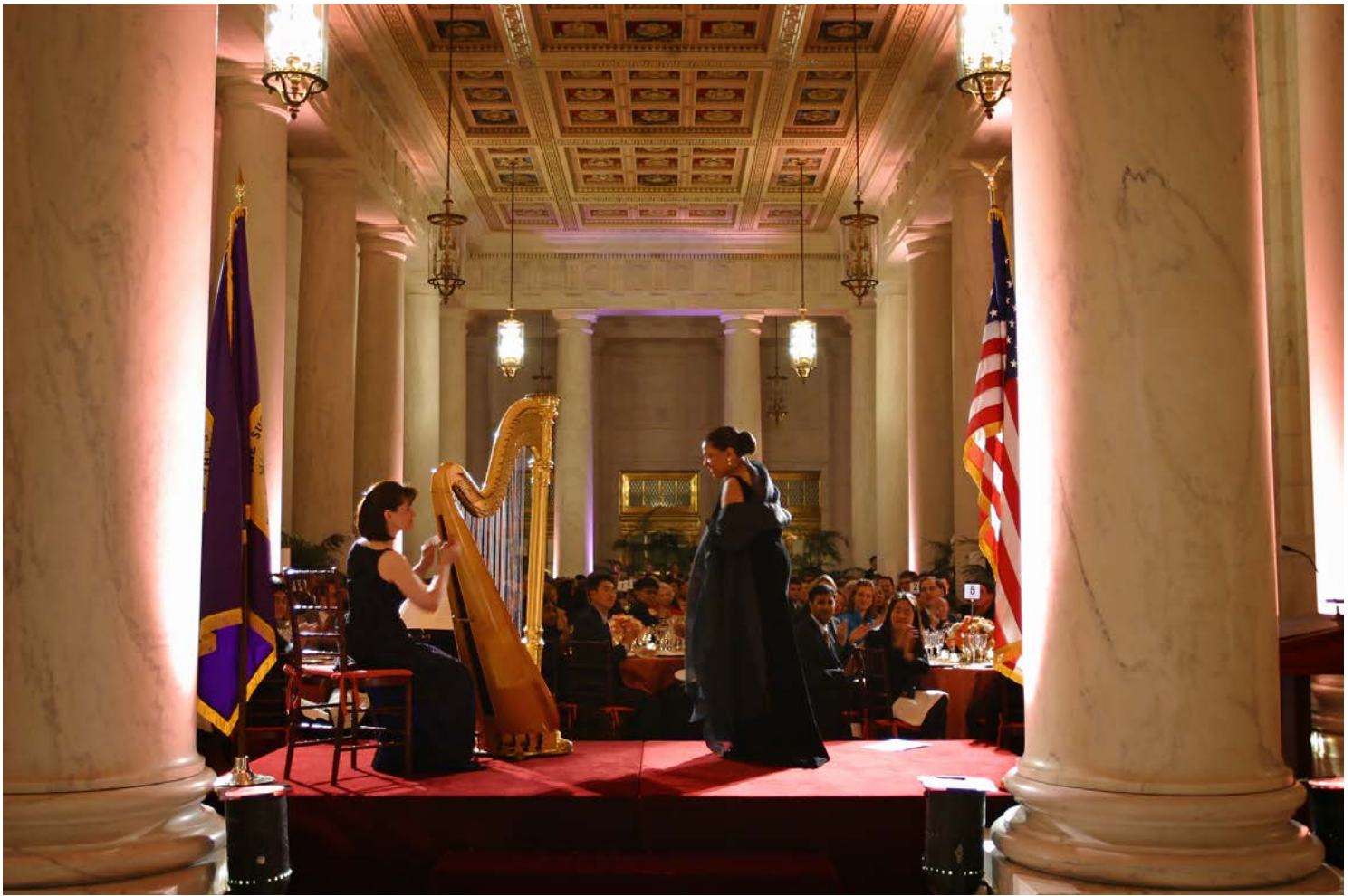
Internationally acclaimed soprano and Academy of Achievement member Kathleen Battle sings spirituals in the Great Hall of the U.S. Supreme Court at the Introductory Dinner of the 42nd International Achievement Summit.

Academy members and guests stayed at the elegant Hay-Adams Hotel, just across Lafayette Park from the White House. Along with the Academy's international honor students, Academy members and guests took many of their meals in the hotel's handsome John Hay Room and in the breathtaking Roof Garden, with its incomparable view of the White House, Washington Monument and Jefferson Memorial.