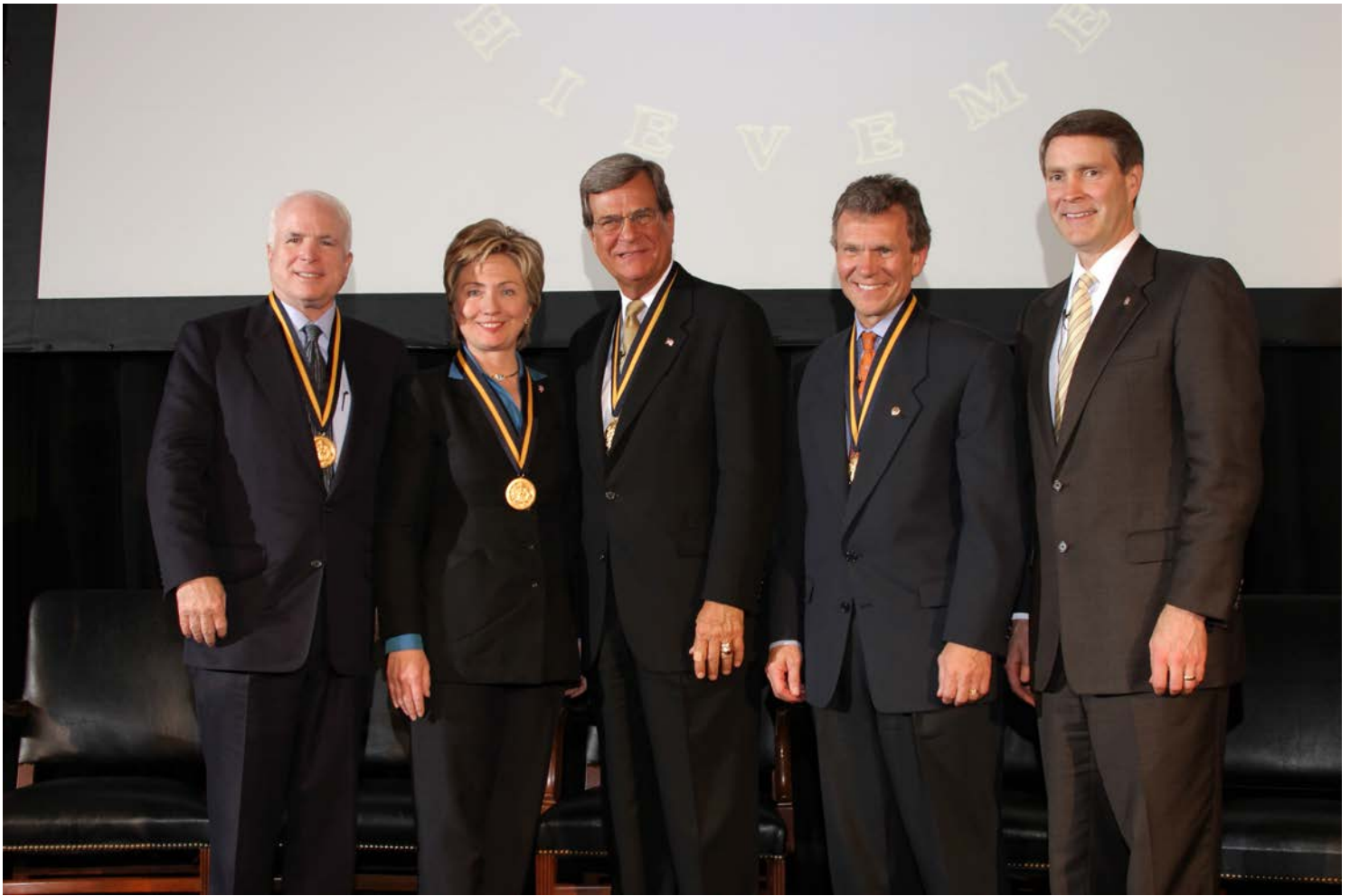
United States Senators John McCain, Hillary Rodham Clinton, Trent Lott, and Senate Minority Leader Tom Daschle were presented with the Academy's Gold Medal by Senate Majority Leader Bill Frist in the historic Caucus Room.

After a visit to the National Air and Space Museum, where students heard a presentation by Pulitzer Prize-winning author A. Scott Berg, all were taken for a private tour of the U.S. Capitol. Academy members and guests attended a reception in the offices of the President Pro Tempore of the United States Senate, the Honorable Ted Stevens. All joined later for the first full session of the Summit, held in the historic Caucus Room of the Russell Senate Office Building. This imposing venue has been the scene of some of the most dramatic episodes in American history, from the Senate hearings investigating the Titanic disaster to the Watergate and Iran-Contra hearings. On this night, it was the scene of an extraordinarily candid and collegial discussion with Senate Majority Leader Bill Frist and the first honorees of this year's Summit, Senate Minority Leader Tom Daschle and Senators Trent Lott, John McCain and Hillary Clinton. The senators took question after question from the Academy honor students and lingered long after the scheduled program to meet with students and exchange views informally.