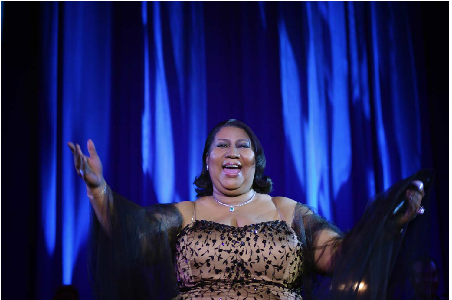
Queen of Soul, Aretha Franklin, rocks the house at the Banquet of the Golden Plate gala at the Mellon Auditorium.

After a break, the audience was brought to its feet by a pulse-pounding session with America's Queen of Soul, Miss Aretha Franklin. Franklin had the audience of students and dignitaries rocking the dance floor with her spine-tingling renditions of "Respect," "Chain of Fools," and "Think." She ended by bringing a touch of soul to a dramatic aria from the opera Turandot , with her heart-stopping performance of Puccini's "Nessun Dorma."