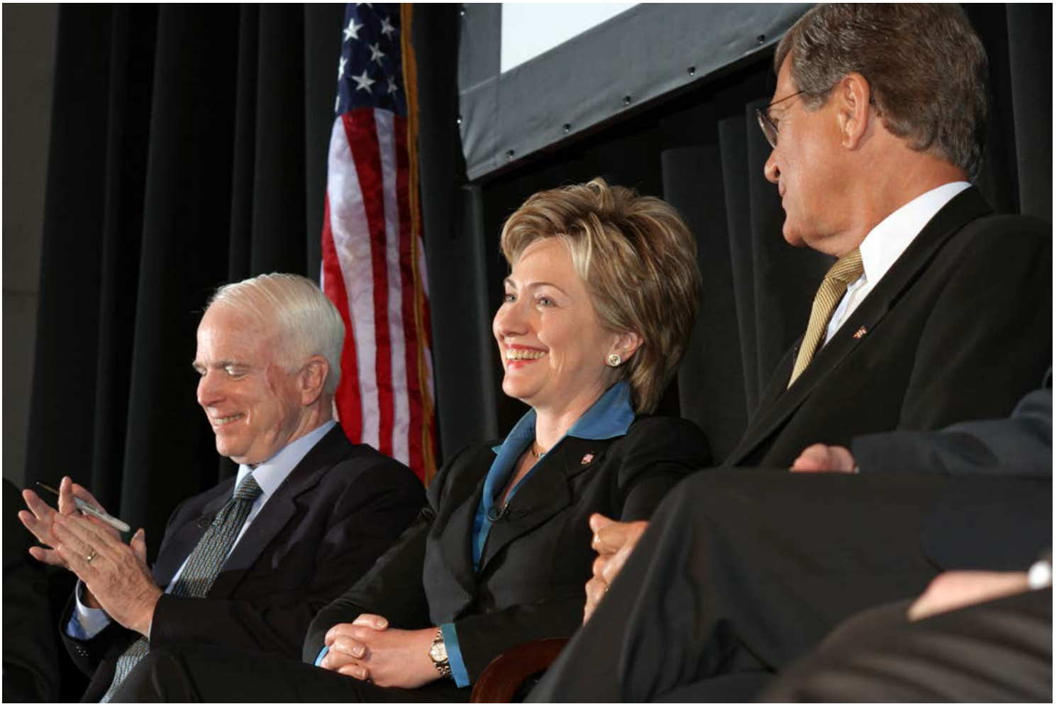
Senators John McCain, Hillary Rodham Clinton and Trent Lott engage in a free-spirited discussion in the historic Caucus Room of the Russell Senate Office Building during the 42nd annual International Achievement Summit.

Thursday afternoon's program began with two provocative panel discussions in the stately Hall of Flags at the U.S. Chamber of Commerce. One featured CBS 60 Minutes correspondent Mike Wallace, former Washington Post editor Ben Bradlee, and famed investigative reporter Bob Woodward discussing the responsibilities of the media in a free society, in an uninhibited discussion led by ABC News correspondent Sam Donaldson. For the second panel, Sam Donaldson welcomed actor George Clooney, Oscar-winning film director Stephen Soderbergh, screenwriter Henry Bean and former White House adviser Michael Deaver, who discussed their new project, K Street , a television series set in the world of Washington political consultants.