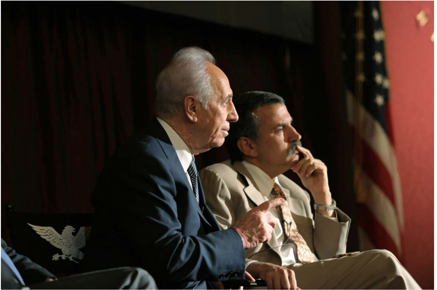
Former Prime Minister of Israel, His Excellency Shimon Peres, a recipient of the Nobel Prize for Peace, and New York Times foreign affairs columnist Thomas Friedman, three-time recipient of the Pulitzer Prize, address the delegates.