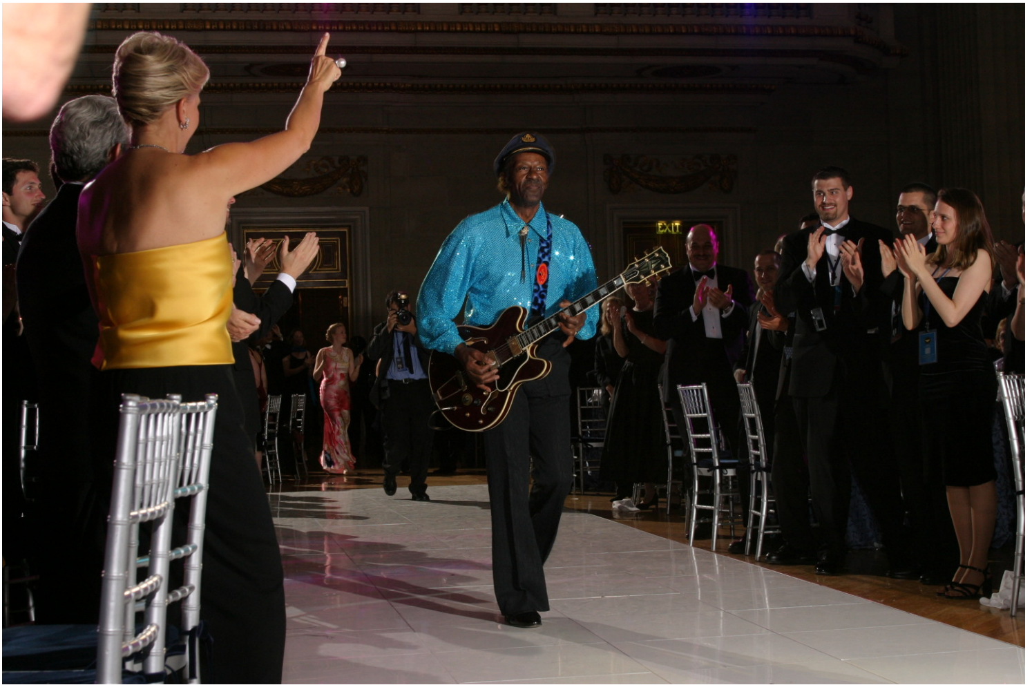
Academy member Chuck Berry, a pioneer of rock and roll music, performs at the Banquet of the Golden Plate gala.

At the end of the evening, Academy members, guests and student delegates rose to their feet again as rock and roll pioneer Chuck Berry entered from the back of the auditorium, firing stinging guitar riffs as he strode the length of the dance floor and mounted the stage. Fierce workouts of his classic songs had the crowd back on the dance floor. The evening held one more surprise, as a final guest of honor arrived. America's master songwriter, Bob Dylan, took the stage to be presented with the Golden Plate by one of his own youthful heroes, Chuck Berry.