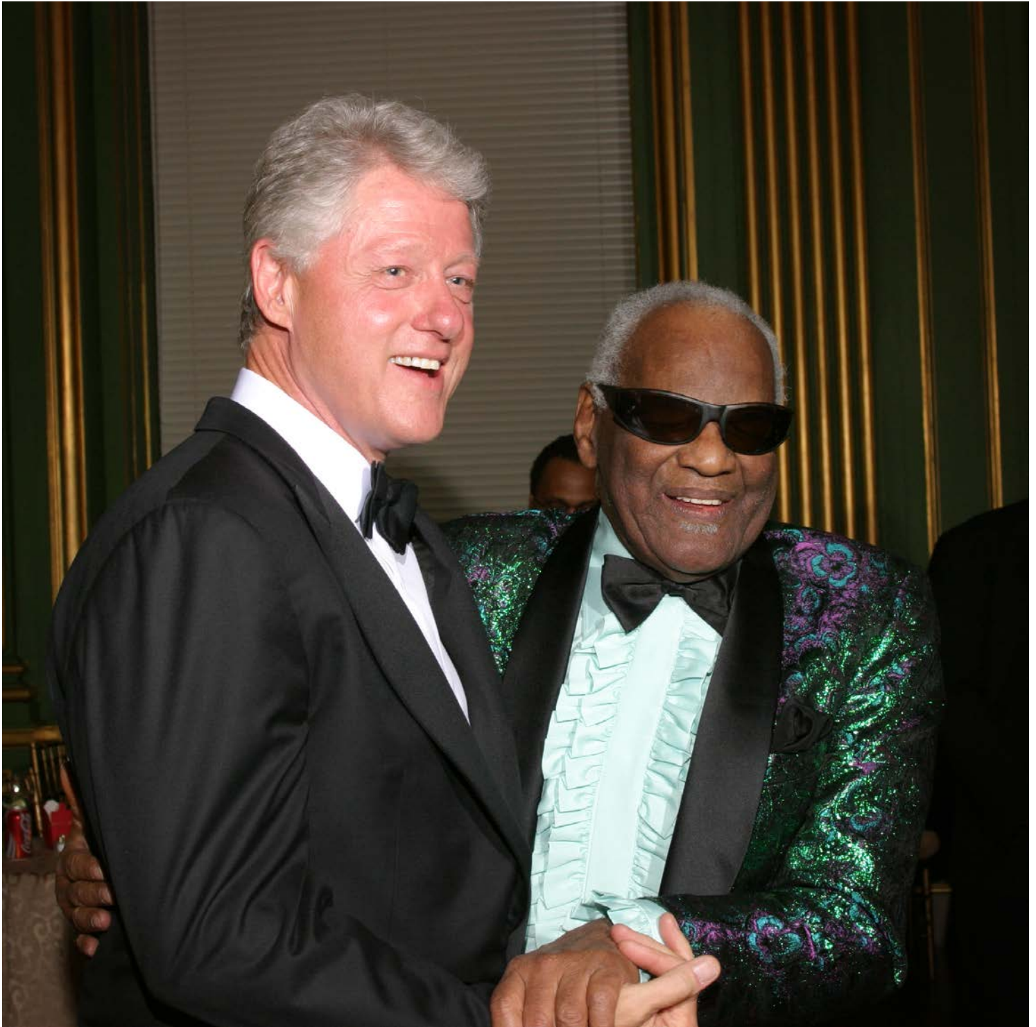
Two Academy members, William J. Clinton, 42nd President of the United States, and the legendary musician who pioneered soul music during the 1950s, Ray Charles, at the Banquet of the Golden Plate Award gala ceremonies.