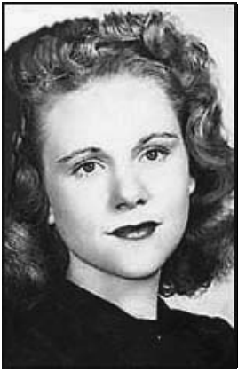
Mrs. Viola Liuzzo

Federal Bar Association - Eastern District of Michigan Chapter - 40 years of service to our Federal Bench and Bar