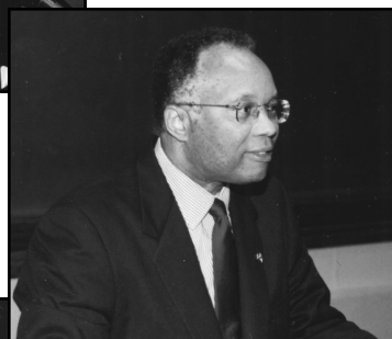
Larry Thompson, Deputy Attorney General