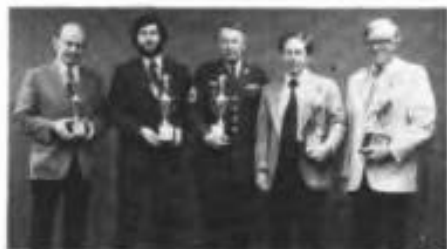
The R&D golf tournament winners look forward to their promised upcoming tournament. A little research may help them win again.