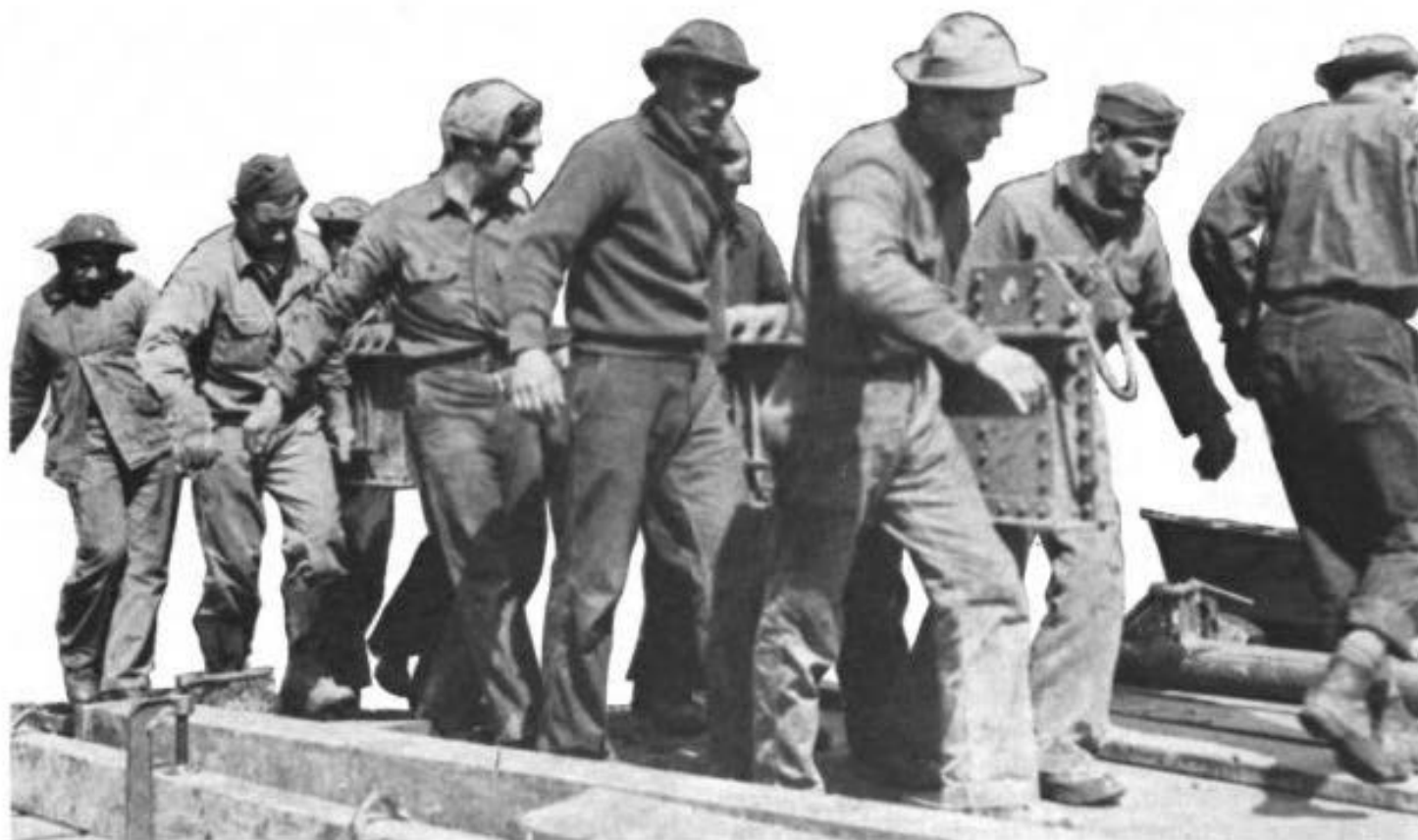
Providing a critical overland route to Alaska (May 1942)—Army engineers carry part of a trestle onto a landing at the Peace River in Alaska. The Army was able to build, within a single working season, 1500 miles of rough but passable road, to link Alaska with the 48 states which at that time comprised the nation.