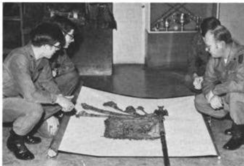
"For the capture of the enemy battle standard at the battle of Krasnoe Selo and distinction in the defeat and expulsion of the enemy from the boundaries of Russia, 1812."