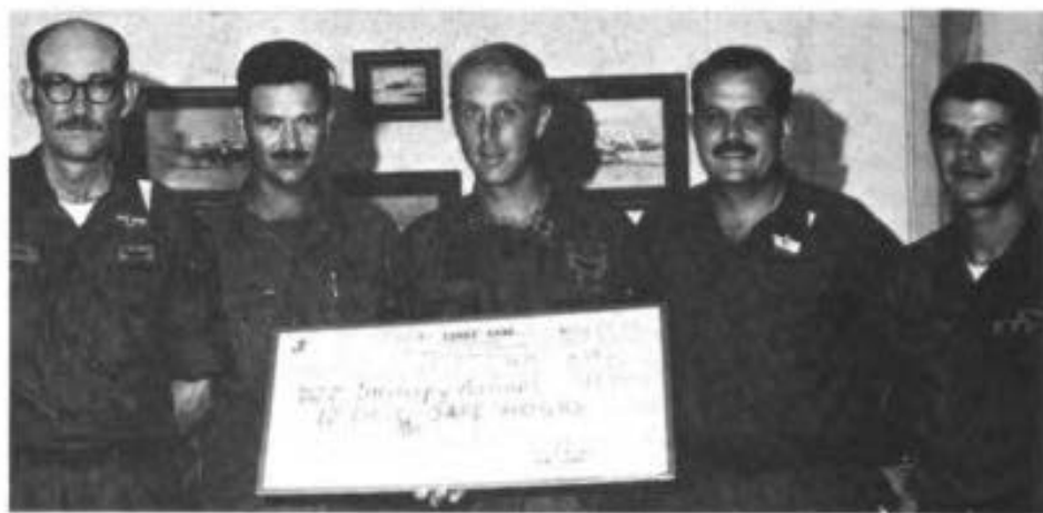
It's no accident that the "Snoopy Airlines" flyers are tops in their jobs.