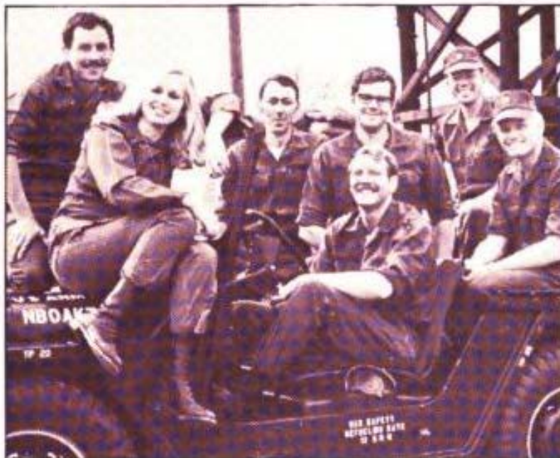
Members of the 43d MASH recreate poster sent to the hospital by producers of the M*A*S*H television series.

The 43d Surgical Hospital, located at Camp Mosier, Korea, was deactivated February 28th. Formerly the 8055th MASH, the unit became world-famous when Richard Hooker wrote a novel depicting the zany exploits of two Army doctors during the Korean War and titled the book M*A*S*H for Mobile Army Surgical Hospital."