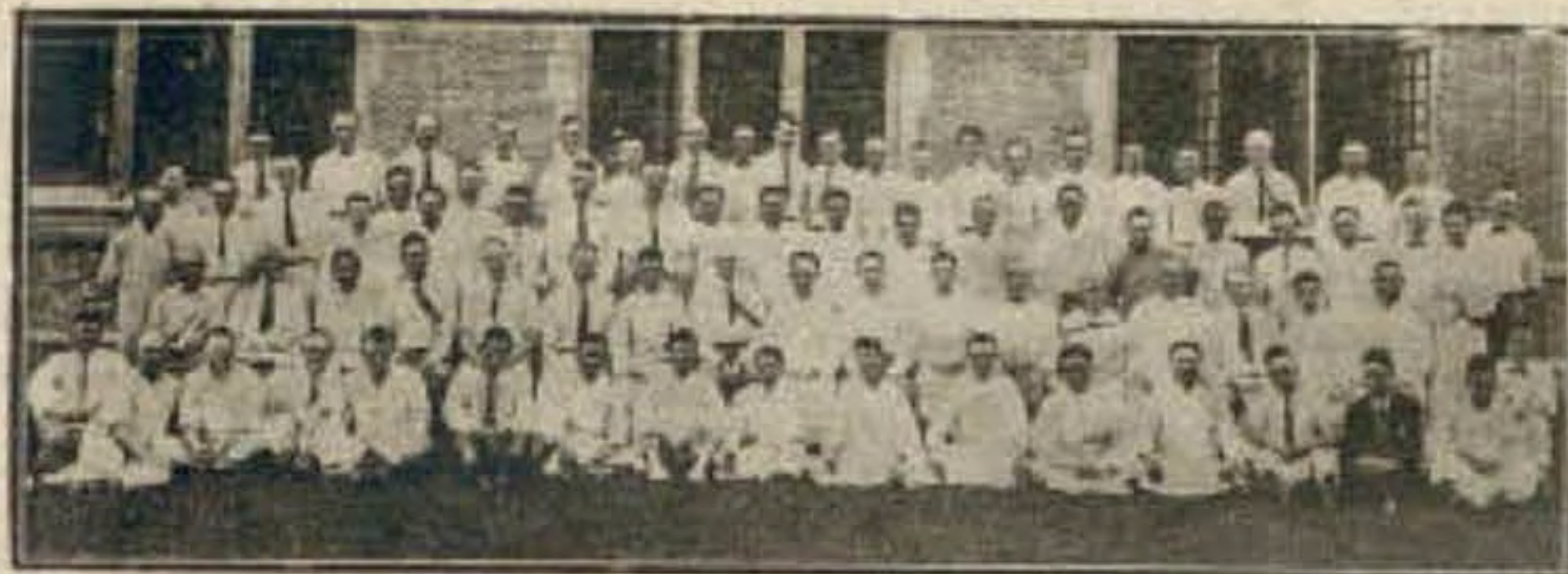
Gathering of General Secretaries, Shanghai, August 1925

A Chinese From its beginnings thirty years ago the Chinese Christian Young Men's Christian Association has been a self- Movement propagating, self-supporting, self-governing body