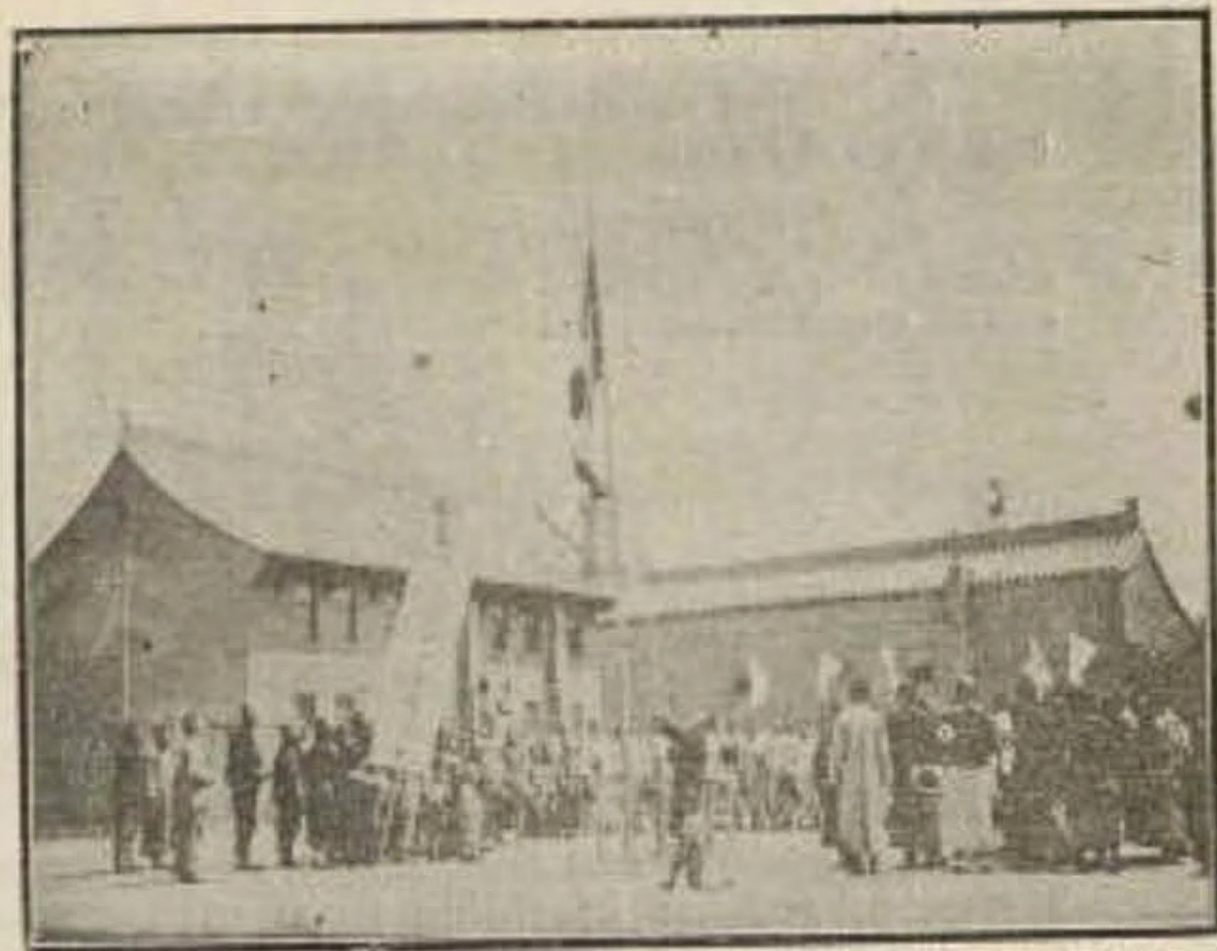
Flag hoisting ceremony at Taiyuanfu. One of the outgrowths of the Y. M. C. A.'s Citizenship Training Movement.

For instance 17 study circles on international or civic problems enrolled nearly 3,000 individuals; 241 lectures and forums were attended by over 70,000 people; 64 lecture teams with 295