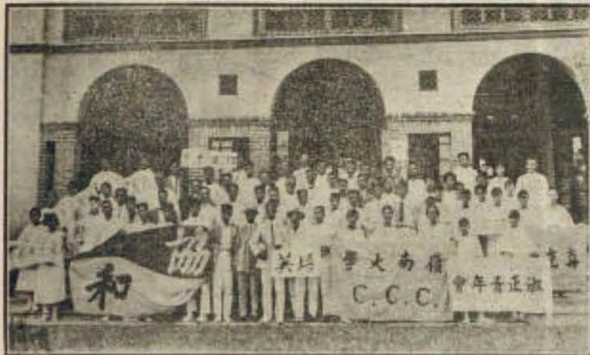
Summer student conference held in Canton 1925.

The statement that "As go the students so goes the nation", may be a trite one, but it nevertheless represents a fact with which China must reckon. The Y. M. C. A. was actually first established at a school in Foochow forty years ago. Great emphasis has always been laid by it upon work among students. A recent paper published in Chinese upon this subject, literally translated, says: "The student movement which may be likened to heavy clouds and raging waves, is bound to have a tremendous effect upon our society and country. This fact puts before us a greater challenge and increases our responsibility".