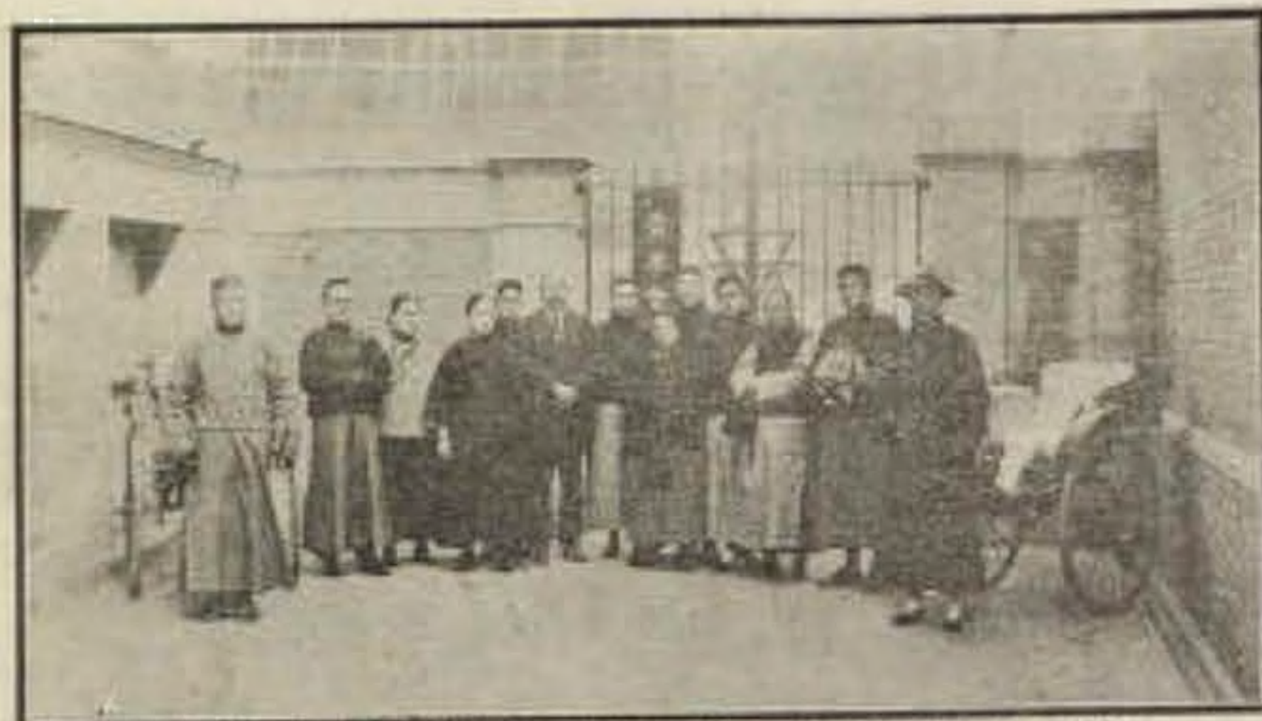
Rickshaw coolies' cooperative society of Tientsin Y. M. C. A.

vehicles has been conducted with success. In Shanghai a Consumers' Co-operative Society is in the process of organization.