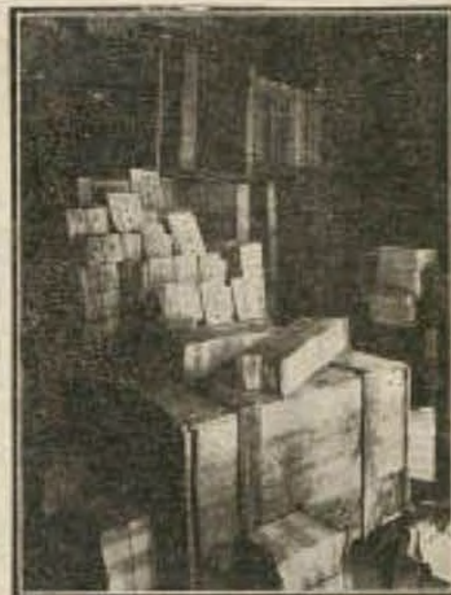
50,000 "Thousand Character" Books Ready for shipment to the Manchurian army at Moukden.

Having worked out the tool, the next logical thing was to think out some device by which the tool could be tested out as to its workability. This was finally done in the form of city-wide campaigns. Four cities, Changsha, Chefoo, Kashing and Hangehow, were then chosen for the purpose. The results of those campaigns were so successful that they attracted nation-wide attention. As the result, similar campaigns were started, one after another, in different places all over the country, so up to this time our local Associations alone had campaigns in such places as Soochow, Ningpo, Nanking, Tsinan, Harbin, Kirin, Antung, Chengtu, Canton, Soochow, Moukden, Tientsin, Nanchang. Within the past year an experiment was carried