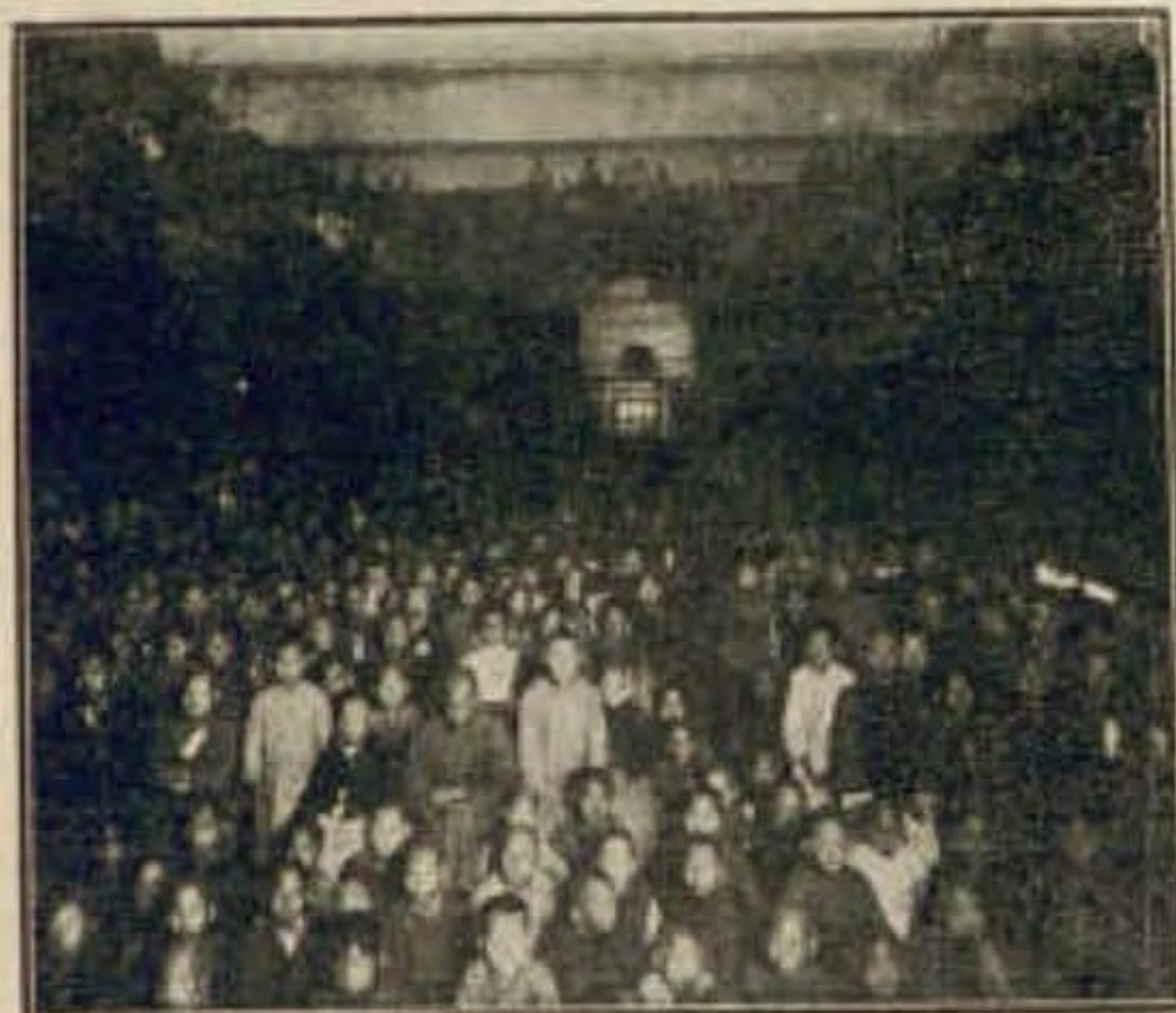
Some of the 4800 "illiterates" graduating in a single year in Hankow Y. M. C. A. schools in the Thousand Character Course.

It has been conceded that the greatest handicap to the progress of the Chinese nation has been the illiteracy of the vast majority of her people. The vastness of the population numbering perhaps four hundred million people has led various reformers to introduce some "short-cut" method in order that the common people might be enabled to learn to read and write. Such devices as Romanization, phonetic script, etc., have been tried during recent years, but all proved to be a failure.