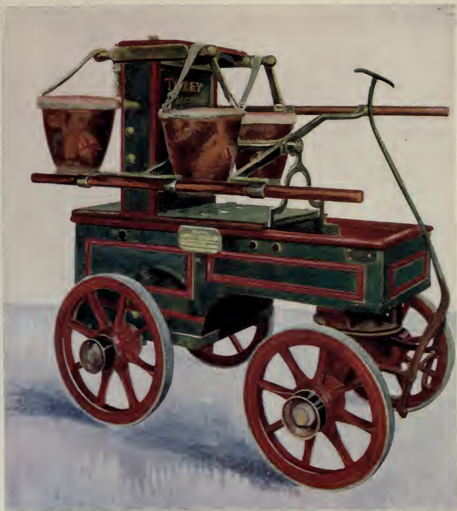
An Old Fire Engine.