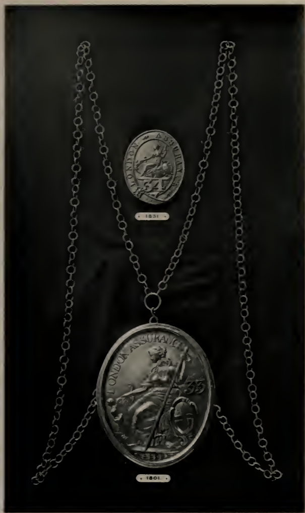
TWO MENS BADGES OF 1801 & 1851