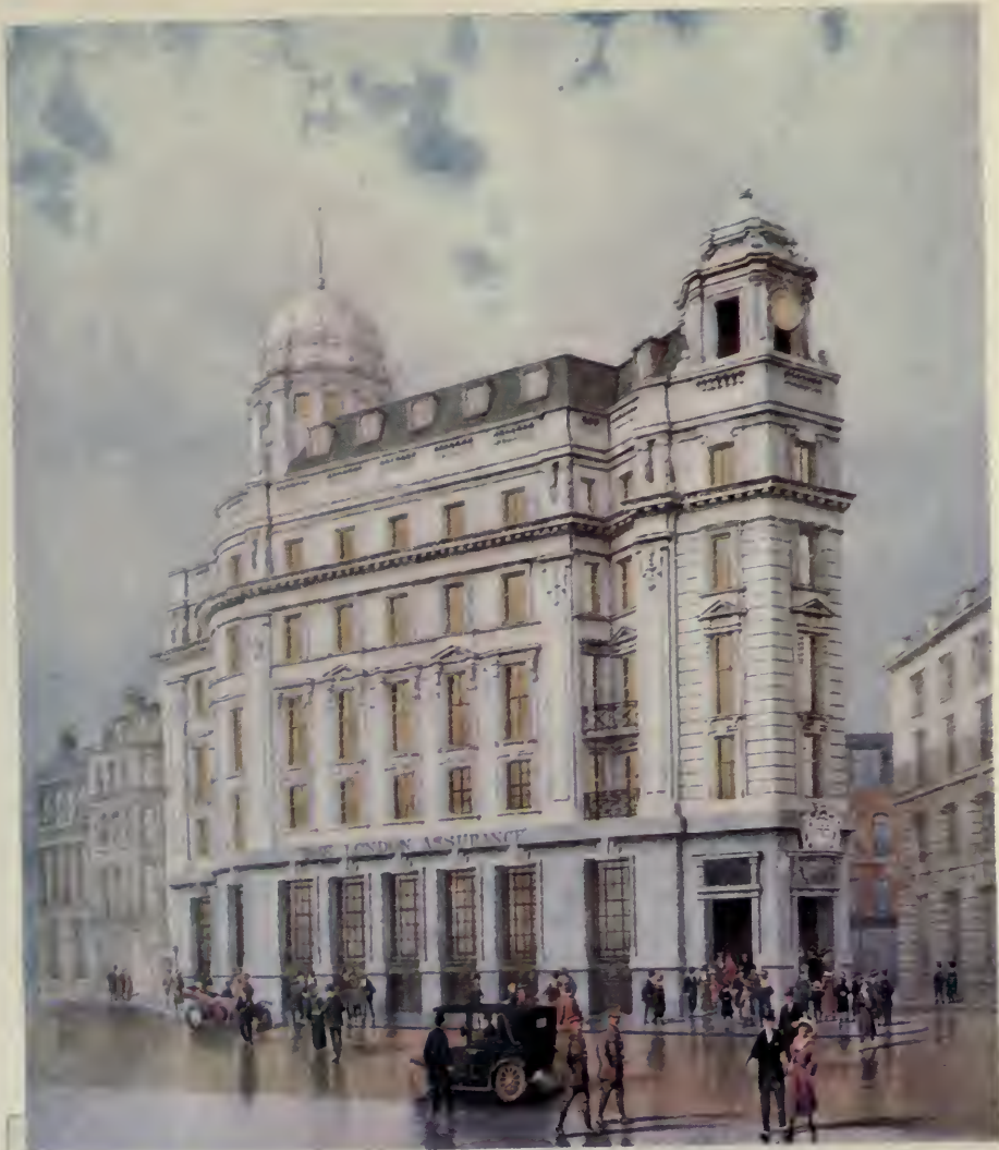
Design for the Corporation's New Buildings at 1 & 2, King William Street, London, E.C.