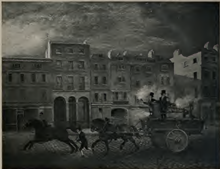
BISHOPSGATE STREET, NR HOUNDSDITCH WITH THE ENGINE AND CART OF THE LONDON ASSURANCE PROCEEDING TO A FIRE. THE LONDON ASSURANCE USED AT THAT TIME A SMALL HAND ENGINE CONVEYED IN A CART MADE FOR THE PURPOSE DRAWN BY TWO OR MORE HORSES TANDEM, THE DRIVER RUNNING BY THE SIDE

REPRODUCED BY PERMISSION FROM A PAINTING IN THE GUILDHALL LIBRARY