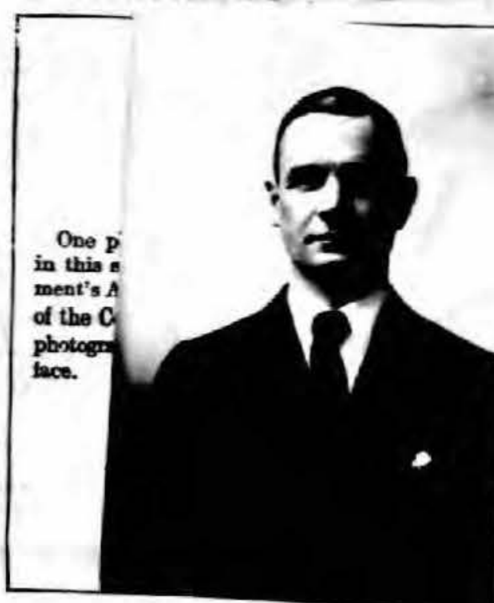
One photo in this document is the official photograph of the applicant.

A signed duplicate of the photograph to be attached hereto must be sent to the Department with the application, to be affixed to the passport with an impression of the Department's seal.