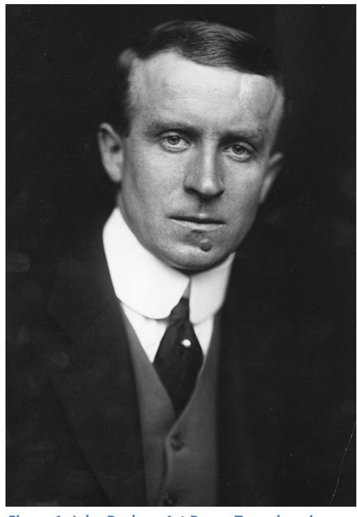
Figure 1: John Buchan, 1st Baron Tweedsmuir, GCMG, GCVO, CH, PC

When the Department of Information was founded by a resolution of the War Cabinet, on the 20th of February [1917], no provision was made for the work of propaganda at home, except in so far as the War Cabinet might direct certain information to be issued to the British Press.