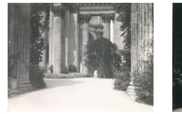
Colonnade, 786 ... >