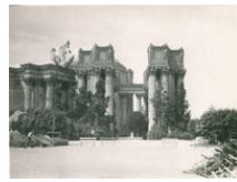
Taken after close. Refuse in corner is from "Carnation" ...