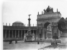
< Court of Universe, 721 ...