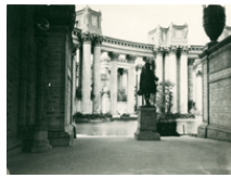
Colonnade, 789 ...