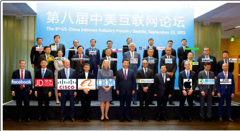
Fig. 1—Xi Jinping and his British-Chinese-American minions. (Sep. 23, 2015). The 8th US-China Internet Industry Forum, Seattle, WA. Front Row, L/R (Obama's Technology Council): Mark Zuckerberg (Facebook), unknown, John Chambers (Cisco), Jack Ma (Alibaba), Virginia Marie "Ginni" Rometty (IBM), Xi Jinping (Chinese Communist Party boss), Satya Nadella (Microsoft), unknown, Tim Cook (Apple), unknown, Jeff Bezos (Amazon); Second Row, 2nd from right: Reid Hoffman (LinkedIn, Facebook, Instagram, PayPal); 4th from right, Bob Swan (Intel). Full size photo (*.png, 5MB). Check your Downloads folder.

CONTRIBUTING WRITERS | OPINION | AMERICANS FOR INNOVATION | DEC. 31, 2020, HAVE A BLESSED NEW YEAR! | PDF | https://tinyurl.com/ycsbrw4z