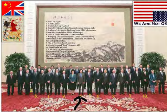
Photo: China Daily, Oct. 31, 2017 For educational purposes only. Fair Use relied upon.