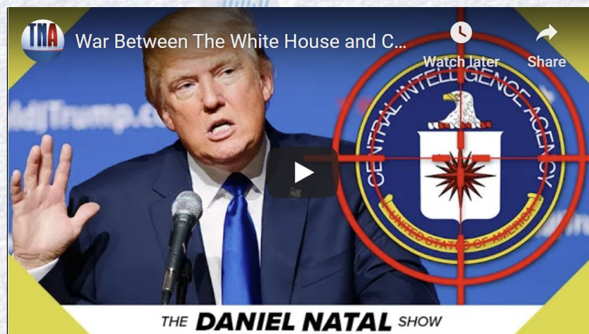
Fig. 7—Daniel Natal. (Dec. 01, 2020). War Between The White House and CIA? The New American Video. https://youtu.be/AEQdn4Pi2s | (Raw *.mp4 video file).