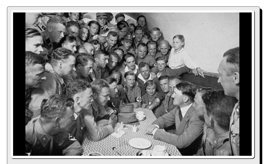
FIG. 1—ADOLF HITLER RELIED UPON HIS "BROWNSHIRTS" TO SPY ON RIVALS

CONTRIBUTING WRITERS | OPINION | AMERICANS FOR INNOVATION | NOV. 06, 2015, UPDATED MAR. 30, 2017 |