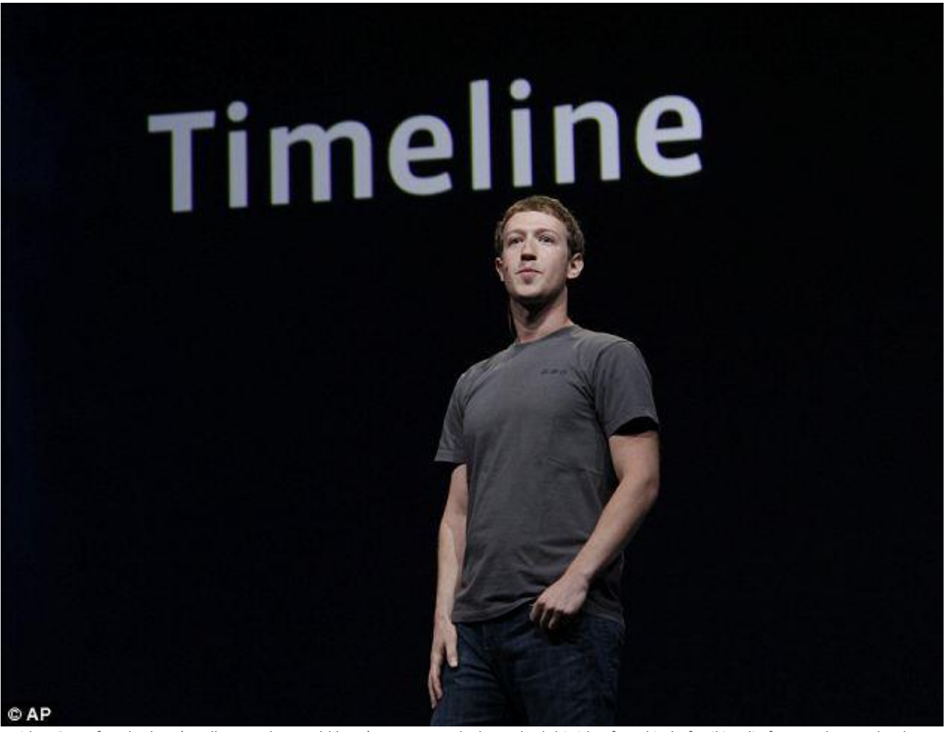
Insider: One of Zuckerberg's colleagues later told her: 'You see, Mark always had this idea for a kind of Wikipedia for people, or what he called a "dark Facebook", where each person would have a wall and people could write anything about them on it'

Zuckerberg had already developed such a programme at Harvard and called it Facemash - but this could potentially be for all of Facebook's 25 million users at the time.