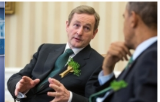
President Obama and Prime Minister Kenny Celebrate the "Incredible Bond" Between the U.S. and Ireland