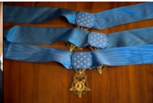
President Obama Awards the Medal of Honor to 24 Army Veterans