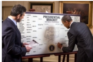
President Obama's Bracket for the 2014 NCAA Men's Basketball Tournament