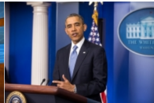
President Obama Announces New Ukraine-Related Sanctions