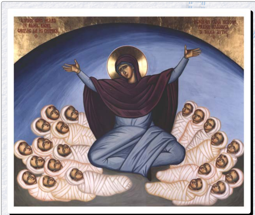
FIG. 1: THE MASSACRE OF THE HOLY INNOCENTS ICON. Whether it is pedophilia, abortion, Satanic ritual abuse and murder, Planned Parenthood trafficking in aborted baby parts, unnecessary immunization or Common Core brainwashing, may the Lord have mercy on our souls for this systematic abuse of the innocents that we in the general public are not storming the gates to stop worldwide.

Clintons, Obamas, Summers were paid in cash for outlandish speaking fees and Foundation donations. Sycophant judges, politicians, academics, bureaucrats and media were fed tips to mutual funds tied to insider stocks like Facebook. Risk of public exposure has ensured silence among pay-to-play beneficiaries. The U.S. Patent Office is their toy box. Click timeline above.